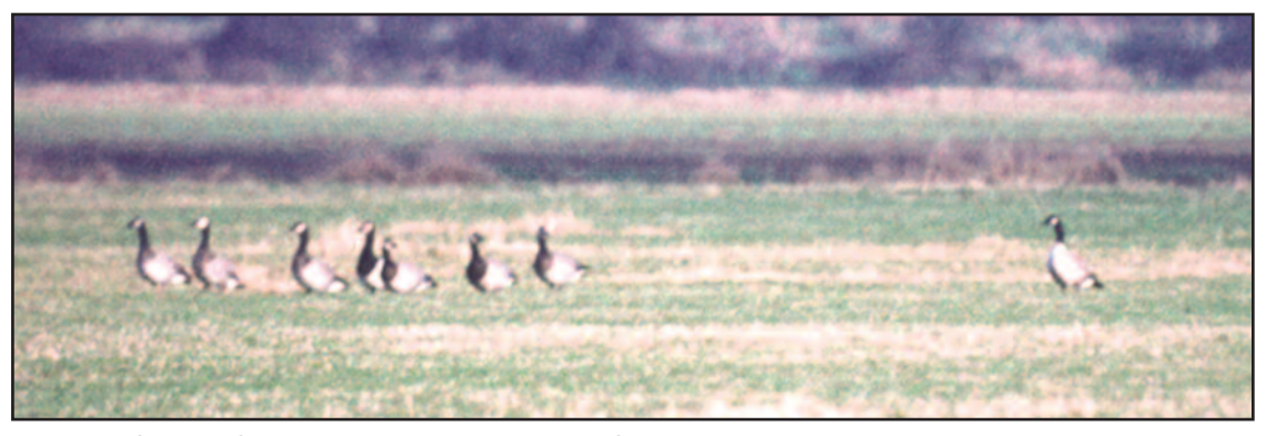
Plate 292. Cackling Goose (right) paired with Barnacle Goose together with four hybrid offspring and two more Barnacle Geese, North Slob, Wexford, 1970, representing the first Irish record of this species. This pair may have been present in 1969 with two hybrid young and may also have been present during the winter of 1974-75, again with a hybrid bird. However, there is insufficient detail available to confirm the identification of the bird(s) present during those two other winters.

B.h.leucopareia (Aleutian Cackling Goose)