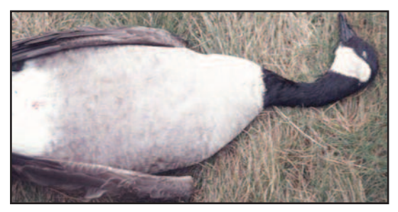
Plate 294. Canada Goose, shot, North Slob, Wexford, 18th January 1971 (Oscar J. Merne). This bird was one of at least four present during that winter, together with the Cackling Goose featured in Plate 292. On examination, this bird was said to have been confirmed as a canadensis however with no other details available for assessment this individual has not been assigned to subspecies.

individuals) and those records between 1954 and 1969 from the Republic of Ireland (34 individuals) are also included in the Appendices as 'presumed to be of North American origin' but unassigned to species.