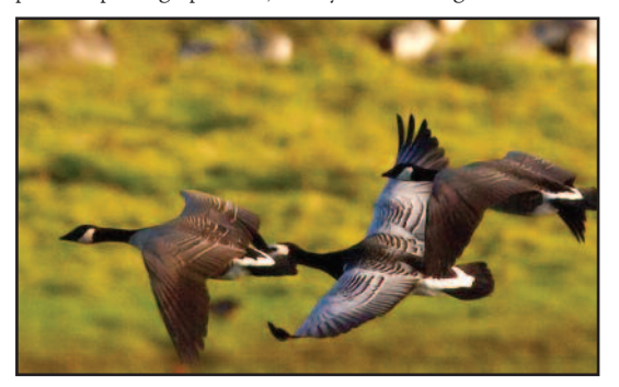
Plate 297. In November 2011 no less than three hutchinsii were present at Lissadell and Ballyconnell, Co. Sligo (Micheál Casey) which is becoming one of the best sites in the country to encounter Cackling Goose. With their characteristic small size (generally smaller than Barnacle Goose), short neck, short bill and square head they are usually relatively straightforward to identify. Some individuals have darker breasts and may represent a different form but with other features seemingly consistent with hutchinsii, for now these are being classified as such.

This review has helped to shed some light on the status of vagrant Canada and Cackling Geese in Ireland but it is by no means the last word on the subject. The IRBC fully expects to be revising this complex area again. We therefore request that all claims of Cackling Goose and any potential 'wild' Canada Goose be supported by detailed notes, including where possible photographs and, ideally video footage.