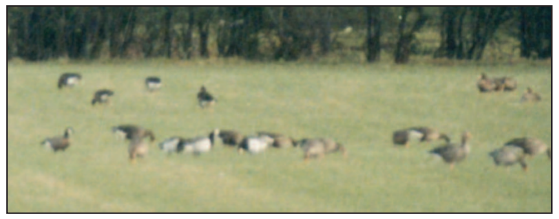
Plate 293. Pictured front left, what appears to be the first confirmed Cackling Goose of the subspecies minima for Ireland. This bird was photographed at Lurgangreen, Co. Louth on 18th February 1996 (Don Hodgers). Its diminutive size, greyish back and very dark, purplish-brown breast and belly strongly support that conclusion. Given the geographical range of this subspecies along the west coast of North America, its popularity in captivity in Europe and perhaps given the eastern location of the record in County Louth the IRBC takes the view that this bird is most likely of feral or captive origin. Other possible examples of minima on record include a sequence of records from Lambay Island, Co. Dublin during the 1980's and a bird at Lissagriffin, Co. Cork in 1985.