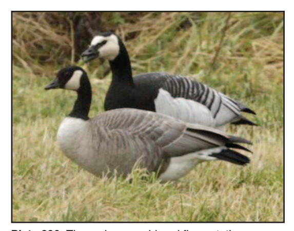
Plate 296. The review considered five putative Cackling Geese of the subspecies taverneri including two birds from Wexford in the 1970's for which no photographic record exists and three more recent birds which were all well photographed. The most recent of these was present at Ballyconnell Co. Sligo from 3rd November 2010 to 27th March 2011 (Micheál Casey). These birds have been characterised as being slightly larger in length than accompanying Barnacle Goose with a longer, narrower neck, a more rounded head profile, a dark gular stripe and a slightly dark breast. None of these features are diagnostic however. North American expert opinion is divided on the identity of these and many other out-of-range taverneri. There are also taxonomic questions over taverneri itself due, in part, to a lack of knowledge and status of Cackling Geese in the high Arctic where the ranges of taverneri and hutchinsii should meet. More importantly, given the far west coast range of taverneri it seems a far less likely candidate for vagrancy to Europe than hutchinsii. Given all these questions that remain the IRBC will for the foreseeable future classify such birds as Cackling Geese, subspecies unassigned.

subspecies interior , the IRBC took the decision in many cases to categorise such records as unassigned to sub-specific level. Similarly, in the case of a number of claims of the smallest subspecies parvipes , it was felt there was insufficient evidence to accept any claims of this form to sub-specific level at present. For example, a well studied and photographed bird in Sligo during winter 2009-2010 (Plate 295) kept company with a Cackling Goose (subspecies butchinsii ) and was felt, by many observers, to be a good candidate for parvipes . However, Fox et al. (2012) found that all specimens of claimed parvipes in Greenland were, in fact, interior type, hence confirming that parvipes has yet to occur there. With this in mind, and that our carrier species come from Greenland, the IRBC has chosen to leave these claims of parvipes unassigned for now.