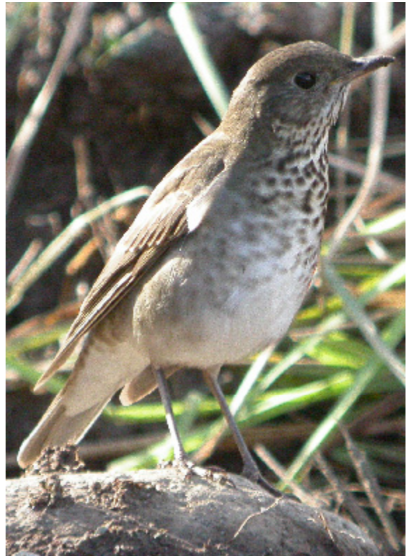
First-winter Grey-cheeked Thrush Catharus minimus , Cape Clear Island, Co.Cork, 31st October 2005.