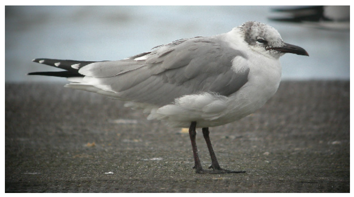
Adult-winter Laughing Gull Larus atricilla, Waterside, Galway City, 12th November 2005.