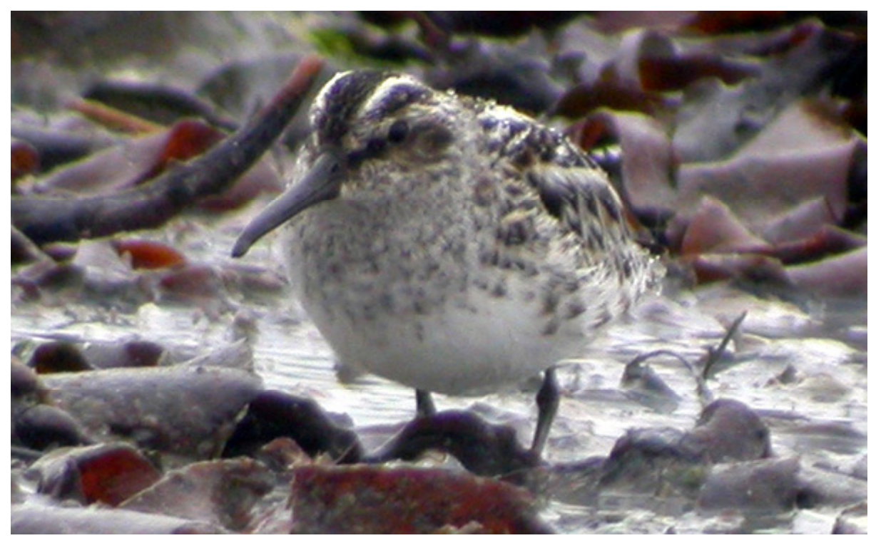
Adult summer Broad-billed SandpiperLimicola falcinellus, Ballycotton, Co.Cork, 2nd May 2005.