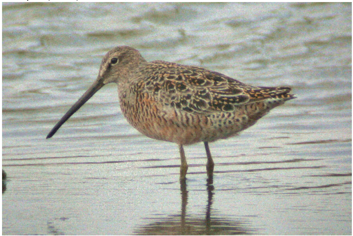
Adult summer Long-billed DowitcherLimnodromus scolopaceus, North Slob, Co.Wexford. 20th May 2005.

Ten in a year equals the previous record, set in 1987.