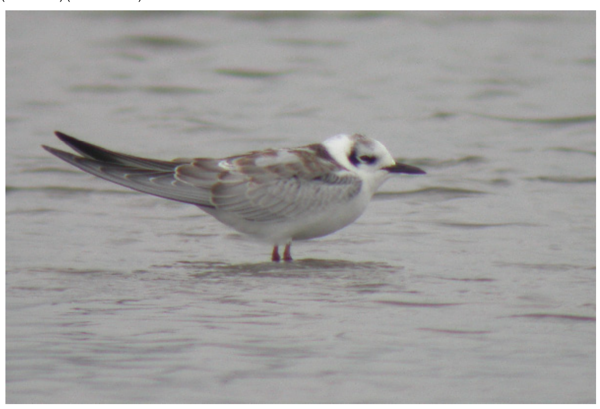
Juvenile White-winged Black Tern Childonias leucopterus , Tacumshin, Co.Wexford, 10th September 2005.

2003 Down Adult and second-summer, Quoile Pondage NNR, 24th and 25th May, previously seen in Antrim (see above) ( NIBR 16:111).