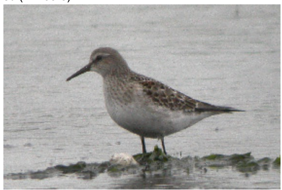
Juvenile White-rumped Sandpiper Calidris fuscicollis, Swords, Co. Dublin, 11th October 2005.