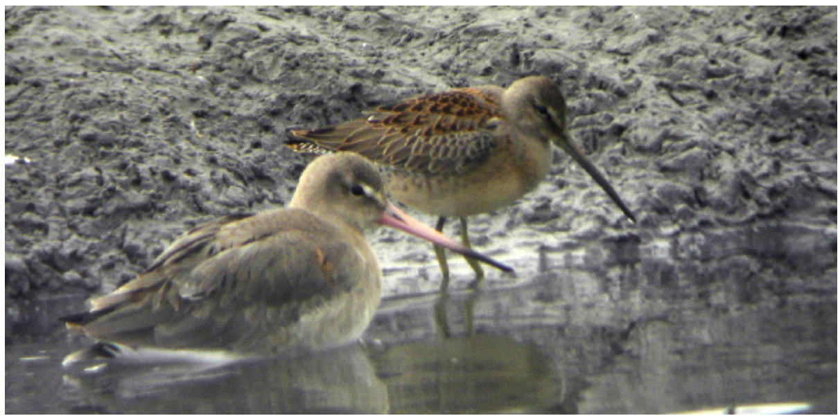
Juvenile Long-billed Dowitcher Limnodromus scolopaceus with Black tailed Godwit Limosa limosa, Clonakilty, Co.Cork, 2nd October 2005.