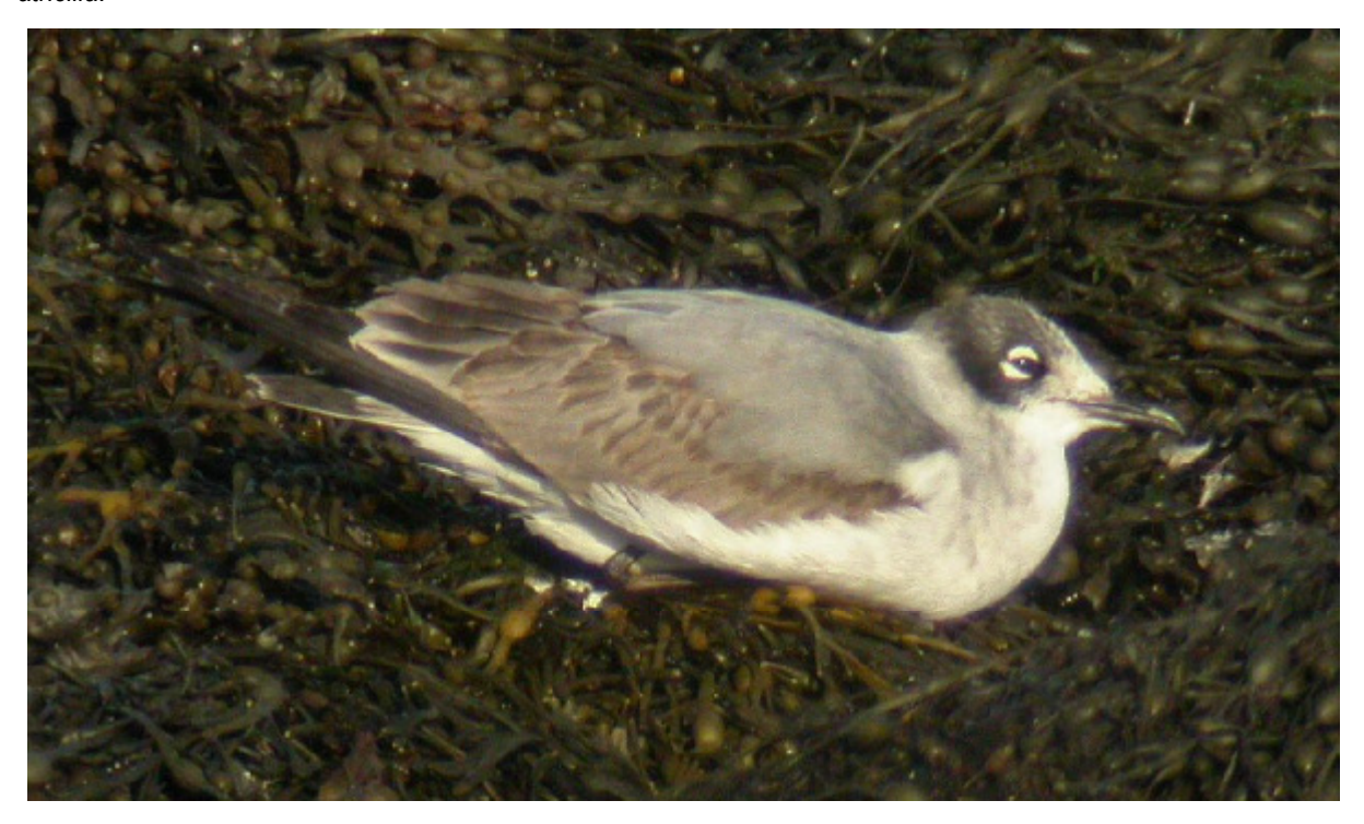
First-winter Franklin's Gull Larus pipixcan, Rossaveal, Co.Galway, November 2005.

Three records in November and December associated with the exceptional influx of Laughing Gulls Larus atricilla.