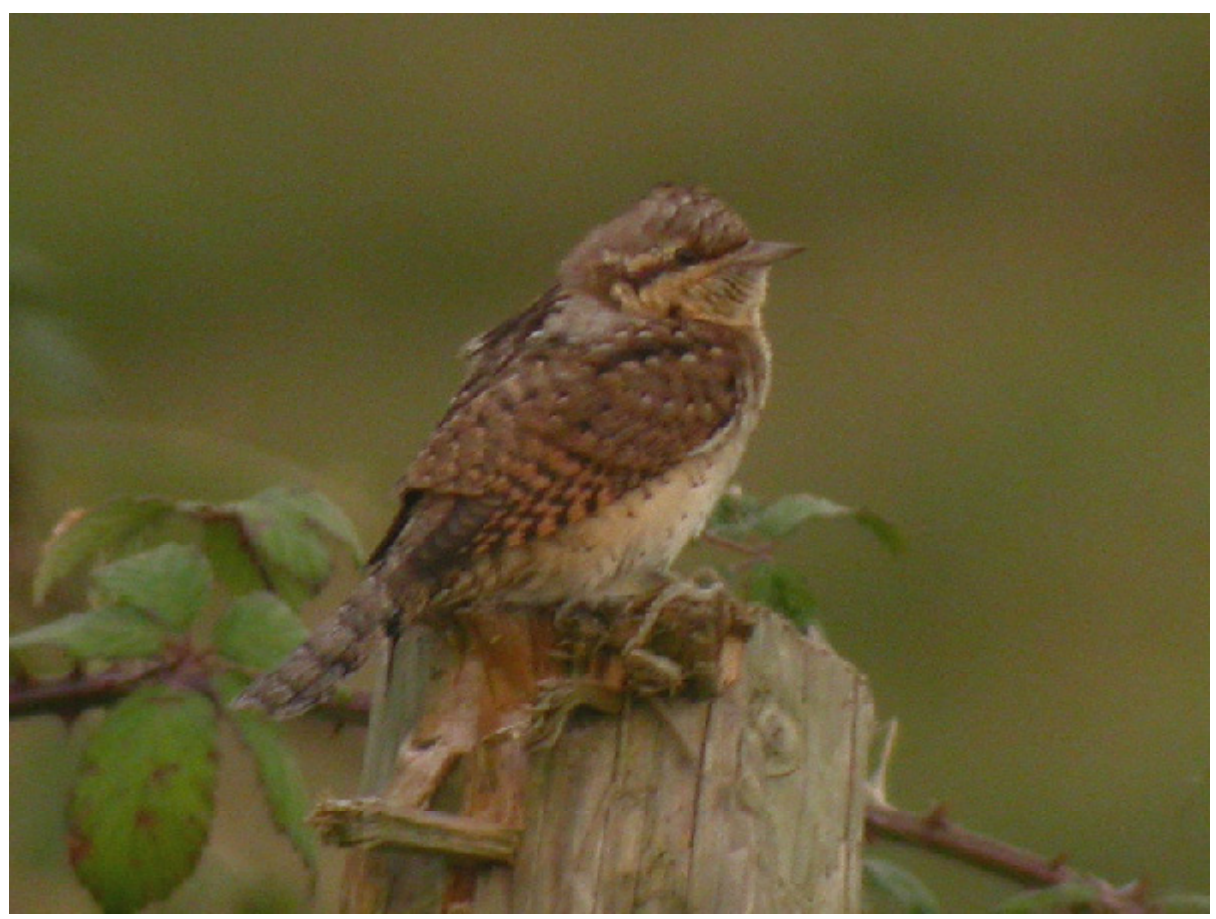
Wryneck Jynx torquilla, Brownstown Head, Co.Waterford, 4th September 2005.