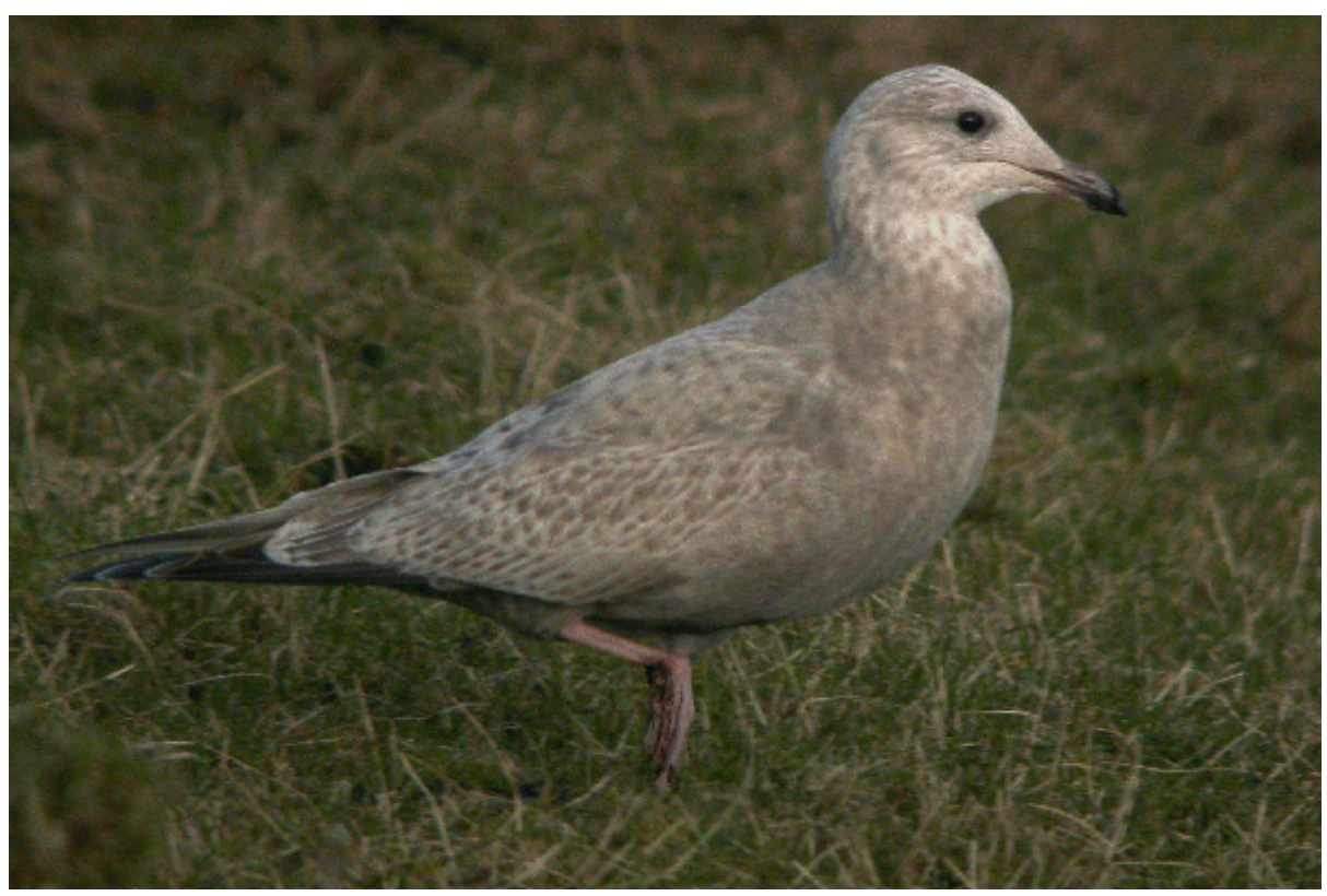
Juvenile/first-winter presumed Thayer's Gull Larus thayeri, Barnatra, Co.Mayo, 7th March 2005.