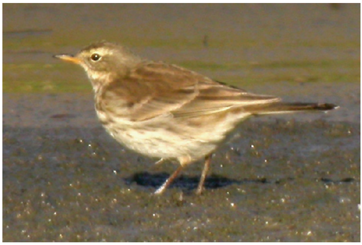
Water Pipit Anthus spinoletta, Kilmeadan Pools, Co.Waterford, 23rd January 2005.

Heightened observer awareness and improved knowledge of the habits of wintering birds at favoured sites contributed to the best year yet for this species.