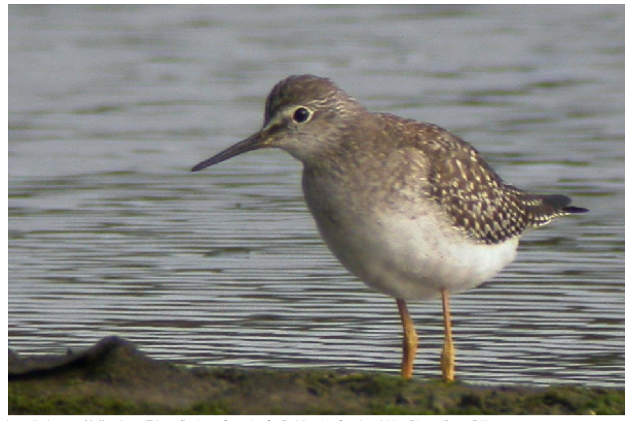
Juvenile Lesser Yellowlegs Tringa flavipes, Swords, Co.Dublin, 1st October 2005.

Following a blank in 2004, a record total, far exceeding the previous best of seven in 1991.