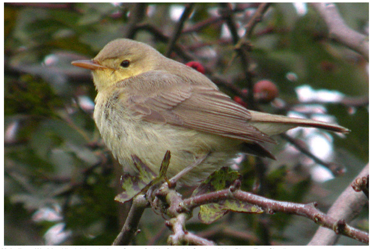
Melodious Warbler Hipplolais polyglotta, Carne, Co.Wexford, 8th October 2005.

Wexford First-year, Carne, 6th to 9th October, photographed (K.Mullarney et al.).