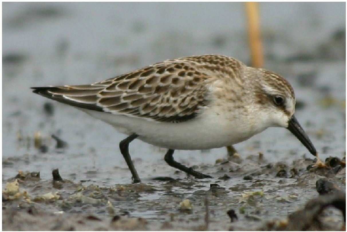
Juvenile Semipalmated Sandpiper Calidris pusilla, Ballycotton, Co.Cork, 7th September 2005.

Clare Juvenile, Shannon Airport Lagoon, 14th to 18th September (J.N.Murphy et al. ). Cork Juvenile, Ballycotton, 7th to 10th September (G.Walsh et al. ), photographed ( Birdwatch 161:68). Down One, Belfast Lough RSPB Reserve, 31st August to 7th September (A.McGeehan). Kerry Juvenile, Blennerville, 5th September (F.King et al. ).