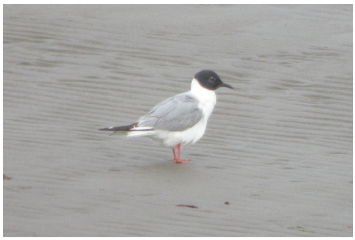
Adult summer Bonaparte's Gull Chroicocephalus philadelphia, between Balbriggan & Skerries, Co.Dublin, 9th July 2005.