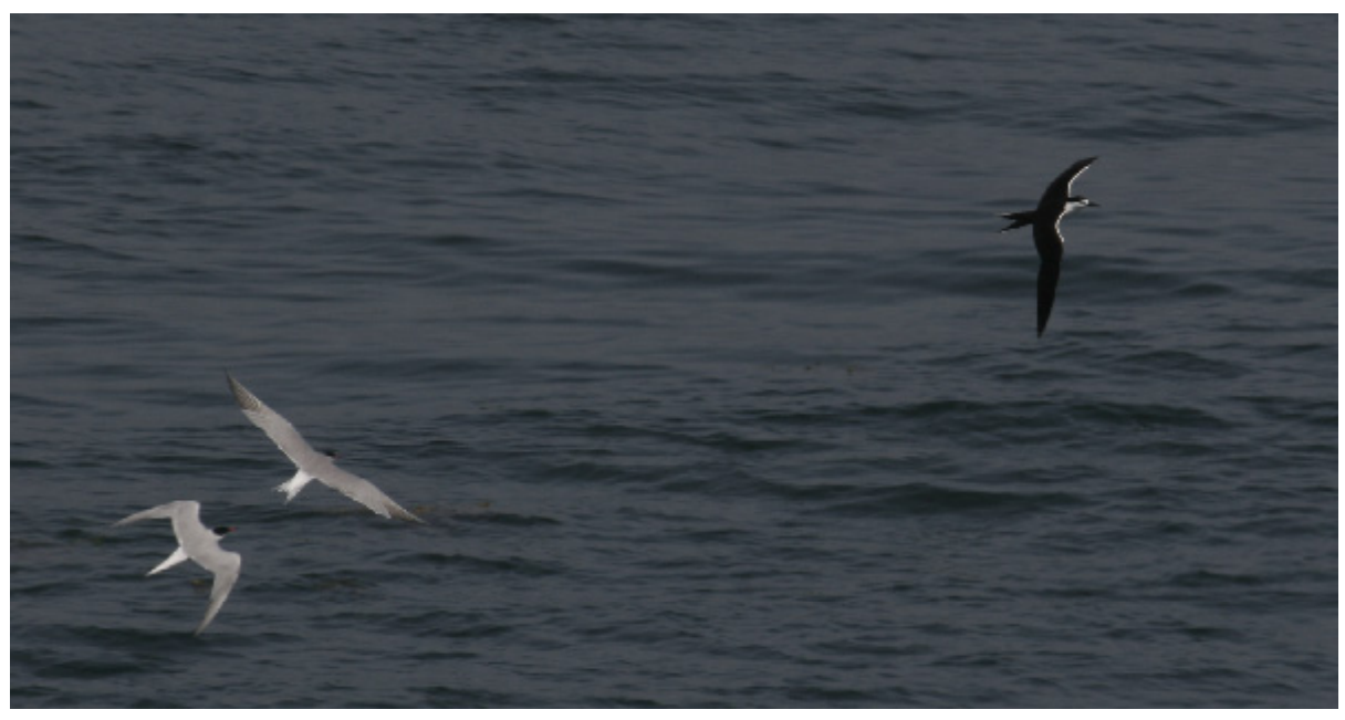
Adult Sooty Tern Sterna fuscata with Common Terns Sterna hirundo, Rockabill, Co Dublin, 12th July 2005.