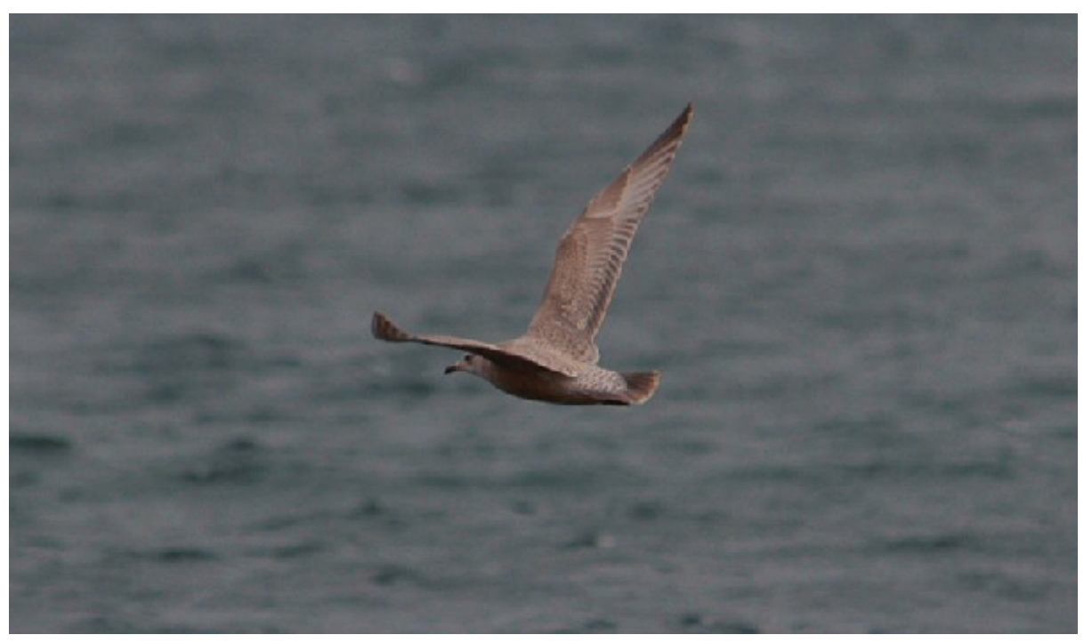
Juvenile/first-winter presumed Thayer's Gull Larus thayeri, Barnatra, Co.Mayo, 17th March 2005.