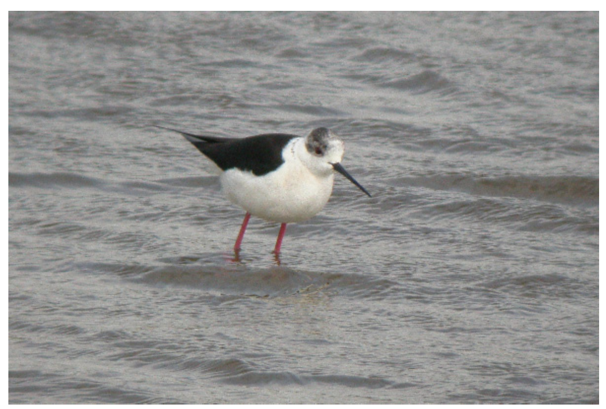
Adult male Black-winged Stilt Himantopus himantopus , Whites Marsh, Clonakilty, Co.Cork, 1st May 2005.