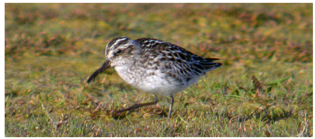
Adult summer Broad-billed Sandpiper Limicola falcinellus, Tacumshin, Co.Wexford, 7th May 2005.