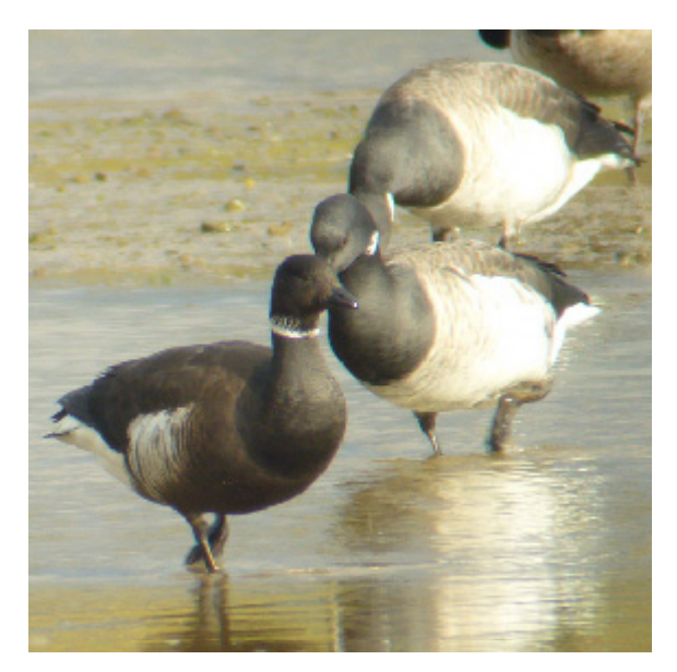
Adult Black Brant Branta bernicla nigricans , Dungarvan, Co. Waterford, 25th November 2005.