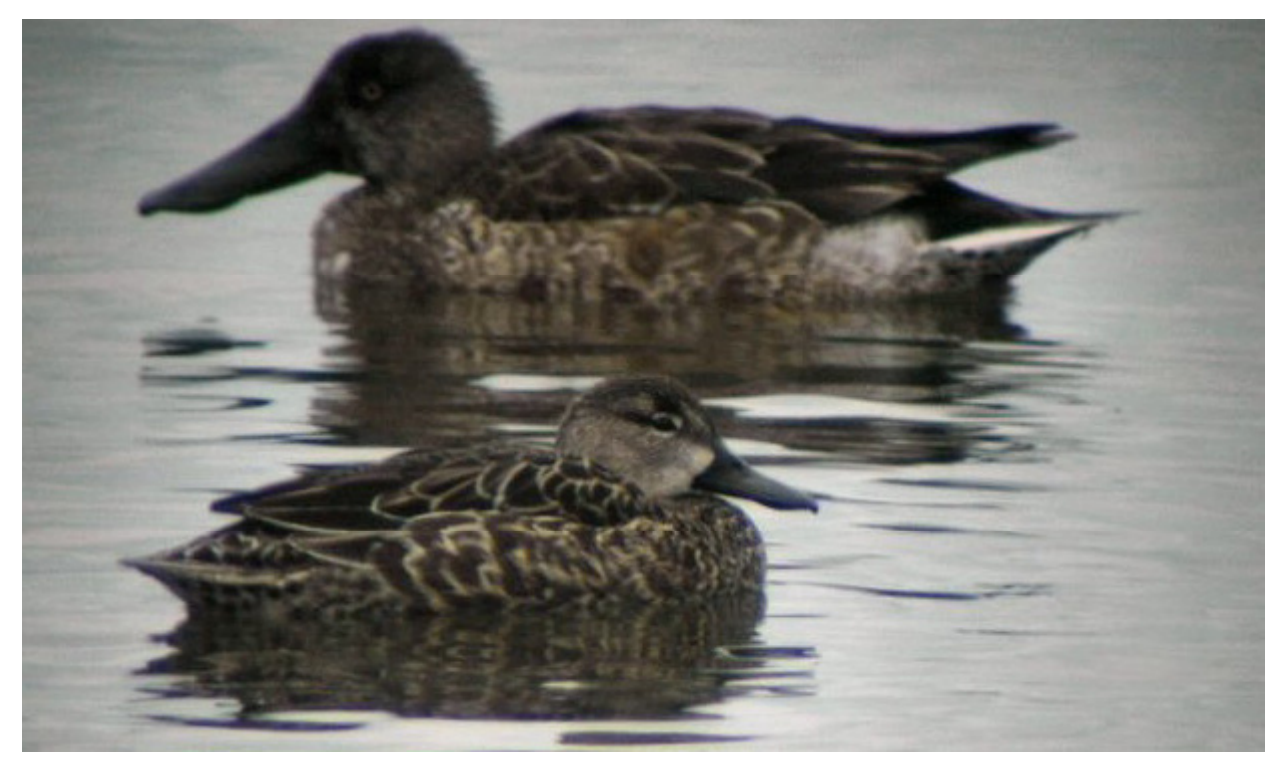
Adult female Blue-winged Teal Anas discors with Shoveler Anas clypeata , Bull Island, Co.Dublin, 18th December 2005.