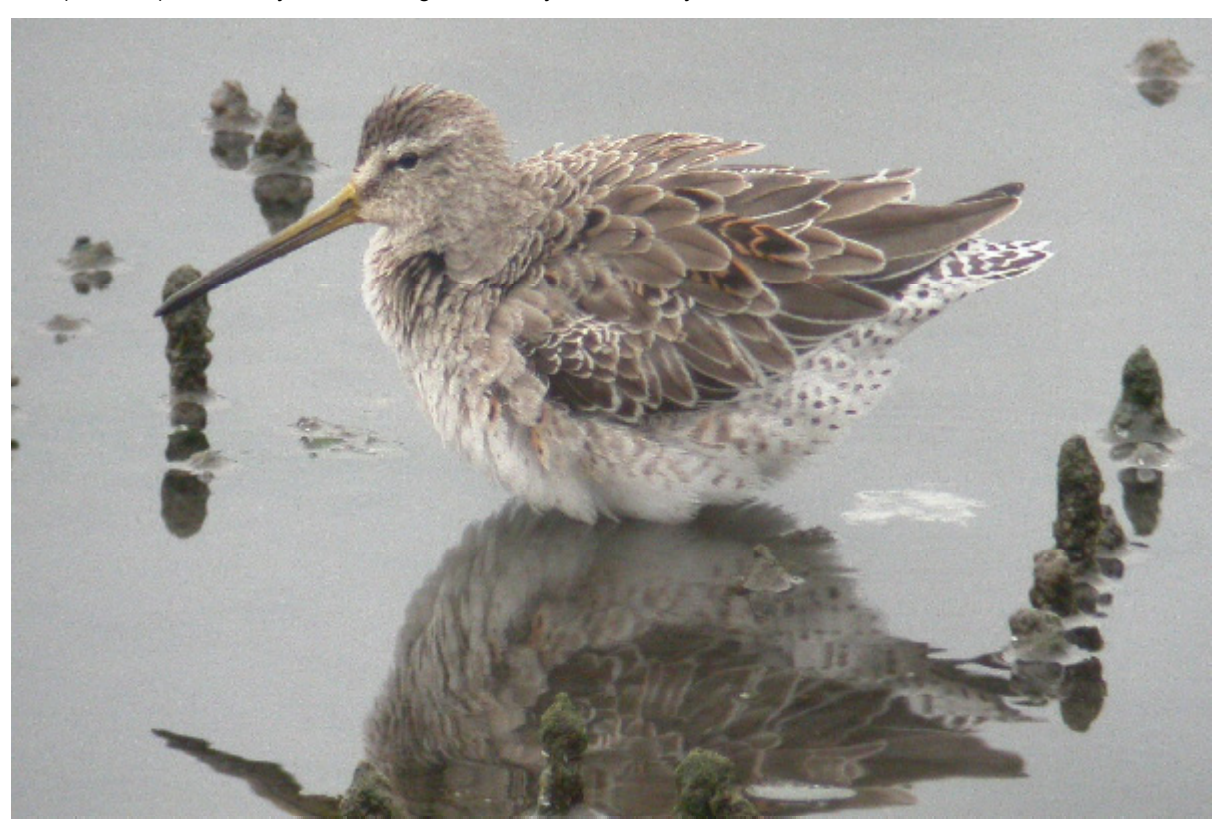
Adult Short-billed Dowitcher Limnodromus griseus , Booterstown Marsh, Co.Dublin, 1st April 2005.

Correction: 2004 Wexford Both photographs on Plate 27 ( Irish Birds 8:112) were taken at Lady's Island Lake (Wexford) on 6th July and 2nd August 2004 by K. Mullarney.