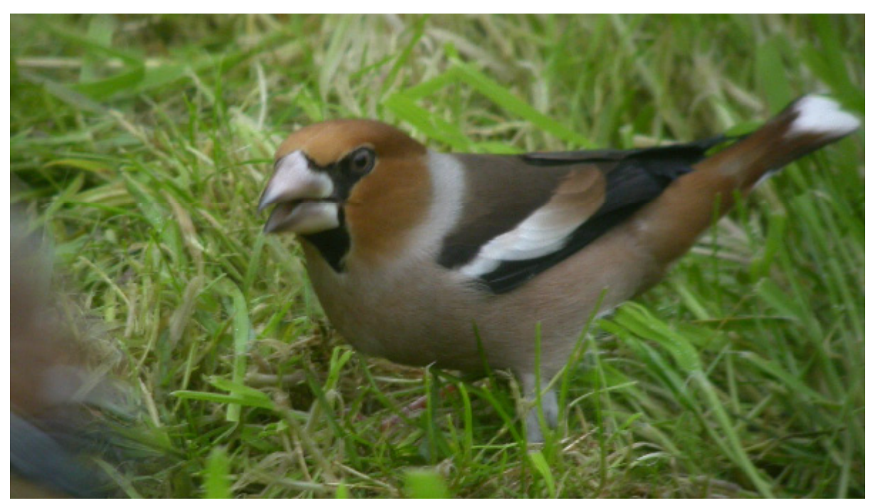
Hawfinch Coccothraustes coccothraustes, Cape Clear Island, Co.Cork, 18th October 2005.

Autumn influxes of this species are not unprecedented; the last influx of a similar scale was in autumn 1988.