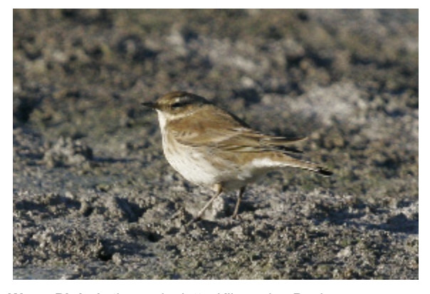
Water Pipit Anthus spinoletta, Kilmeadan Pools, Co.Waterford, 4th December 2005.

Blue-headed Wagtail Motacilla flava flava (50; 1) Clare Male, Kilbaha, Loop Head, 19th July to 30th August, photographed (J.N.Murphy, M.O'Keeffe et al. ). 2004 Londonderry Male, Lough Beg, 24th May ( NIBR 16:120).