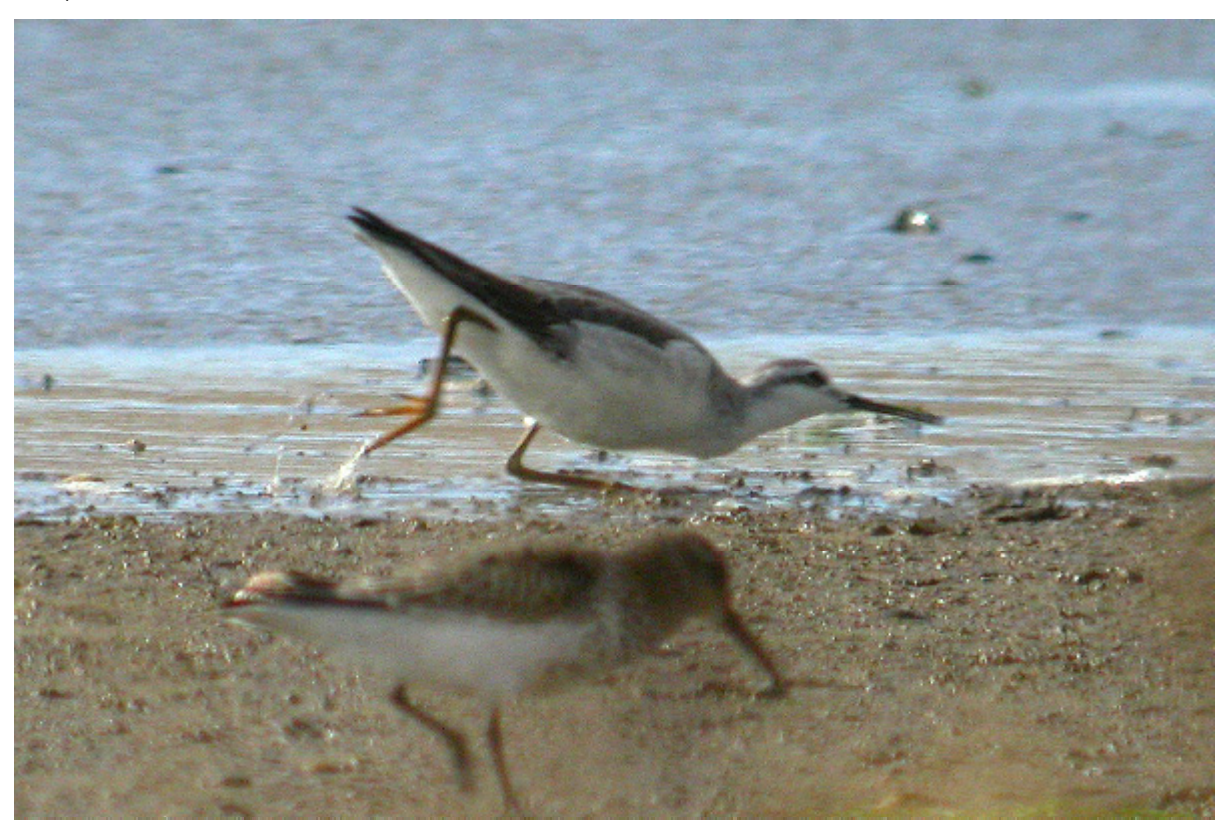
First-winter Wilson's Phalarope Phalaropus tricolor, Tacumshin, Co.Wexford, 25th September 2005.

Correction: 2004 Wexford First-winter, Tacumshin, 24th and 25th September, photographed ( Irish Birds 8:113).