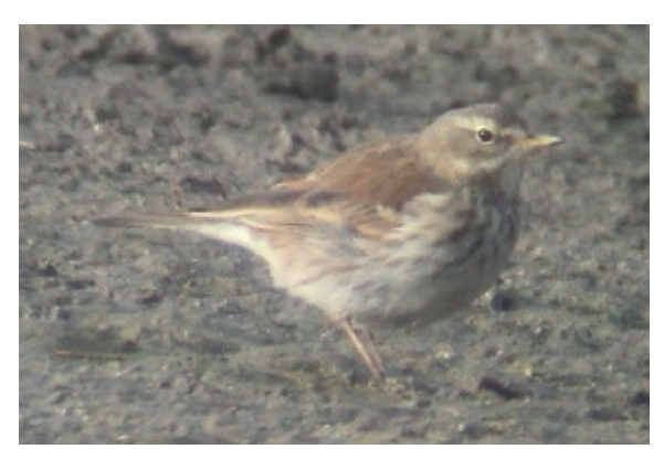
Water Pipit Anthus spinoletta, Kilmeadan Pools, Co.Waterford, 6th February 2005.