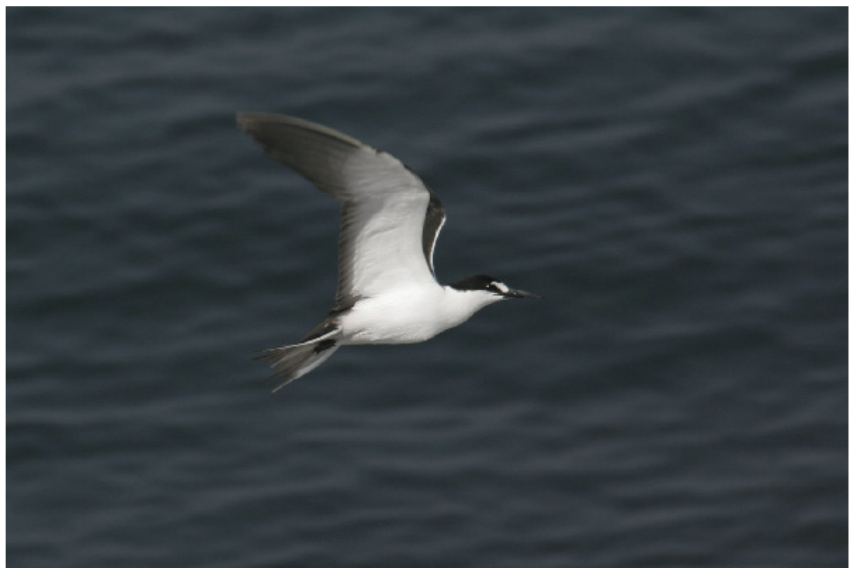
Adult Sooty Tern Sterna fuscata, Rockabill, Co Dublin, 12th July 2005.