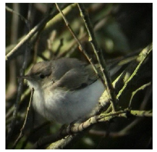
Western Bonelli's WarblerPhylloscopus bonelli, Brownstown Head, Co.Waterford, 31st October 2005.