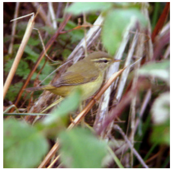
Radde's Warbler Phylloscopus schwarzi, Ballymacrown, Co.Cork, 16th October 2005.