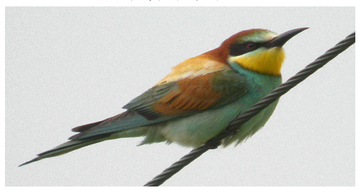
Adult Bee-eater Merops apiaster, Carnsore Point, Co. Wexford, 4th June 2005.