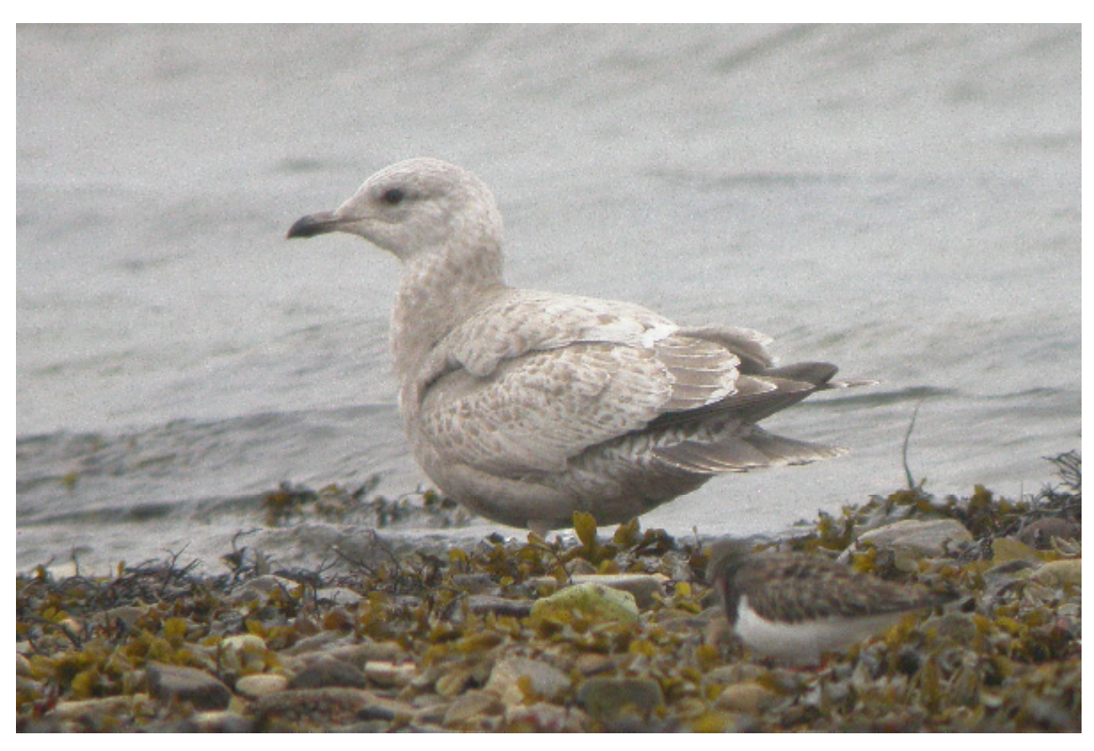
Juvenile/first-winter presumed Thayer's Gull Larus thayeri, Barnatra, Co.Mayo, 17th March 2005.