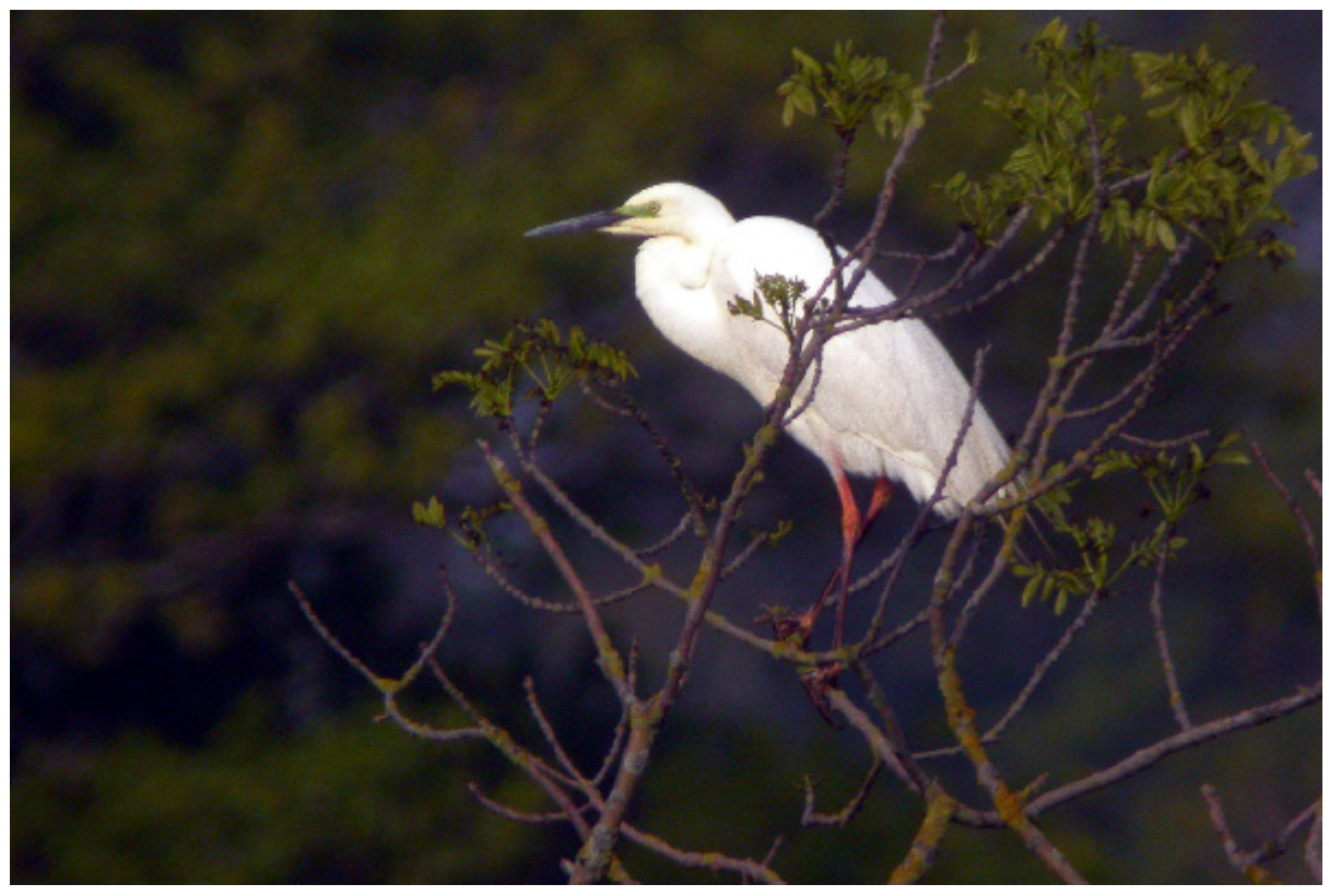
Adult summer Great White Egret Adrea alba , Killoughter, Co. Wicklow, 21st May 2005.

The Cork, Wicklow and Wexford sightings are presumed to have involved the same individual.