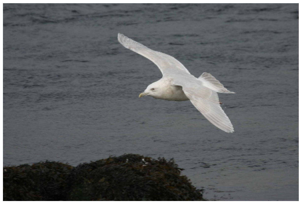
Second-winter Kumlien's Gull Larus glauciodes kumlieni, Nimmo's Pier, Co.Galway, 31st December 2005.

A total of 13 sets a new record for a year, quite typically, all but one occurred in the first part of the year. The inland occurrence (Fermanagh) is unusual.