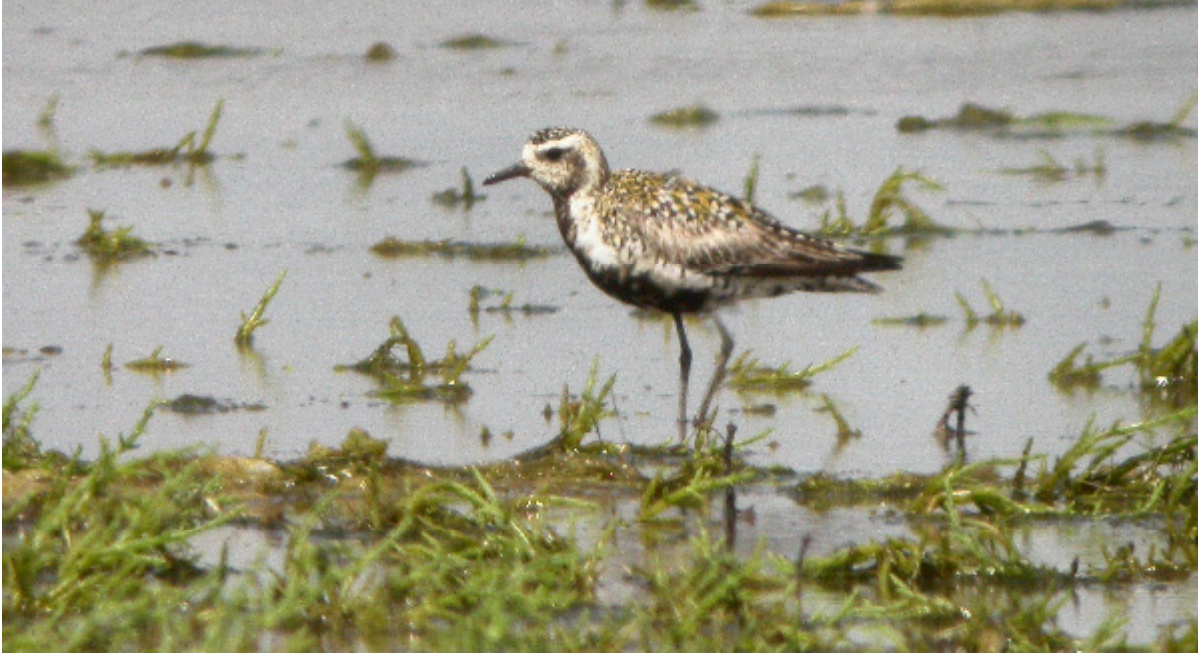
First-summer Pacific Golden Plover Pluvialis fulva, Tacumshin, Co.Wexford, 2nd August 2005.