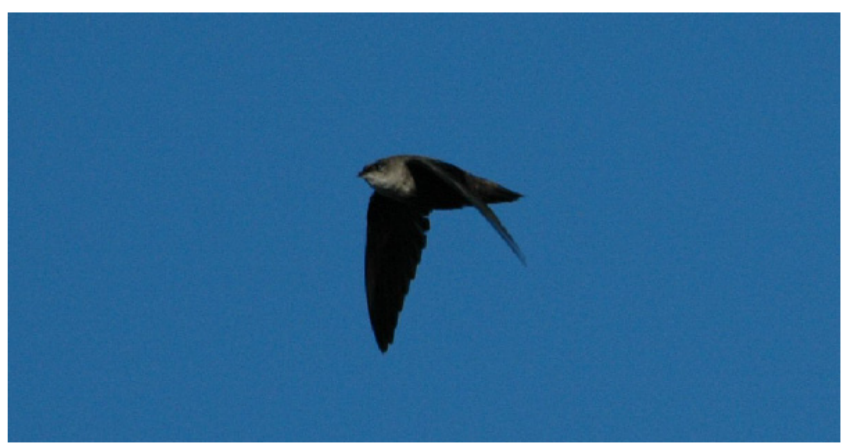
Chimney Swift Chaetura pelagica, Baltimore, Co.Cork, 30th October 2005.