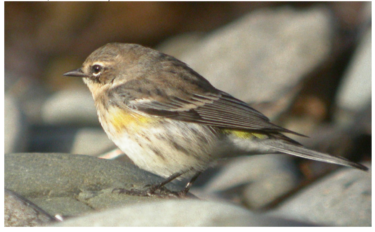
First-winter Yellow -rumped Warbler Dendroica coronata, Cape Clear Island, Co.Cork, 31st October 2005.

Yellow-rumped Warbler Dendroica coronata (10; 1) Cork First-winter, Cape Clear Island, 30th and 31st October (J.F.Dowdall et al. ), photographed. ( Birding World 18: 450, Birdwatch 162:68)