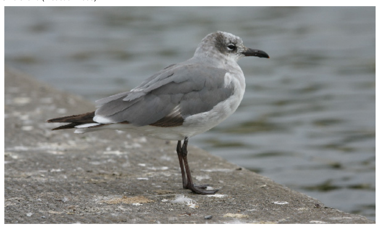
First-summer Laughing Gull Larus atricilla, Nimmo's Pier, Co.Galway, 31st July 2005.

The highest total ever, with most occurring in the second half of the year. Several individuals were highly mobile and frequented several sites during their stay, the most nomadic being the Cork first-summer which, on the basis of photographic evidence, was later shown to have occurred in Galway. This arrival formed the vanguard of a major influx of this species and Franklin's Gull Larus pipixcan into Western Europe during the winter of 2005/2006 and was associated with Hurricane Wilma off the eastern seaboard of the USA (Ahmad 2005, Fraser & Rogers et al. 2005). The influx produced up to 60 birds in Britain, at least 28 in the Azores and single records from several sites on the Continent, including the first for Switzerland (Piot et al. 2006).