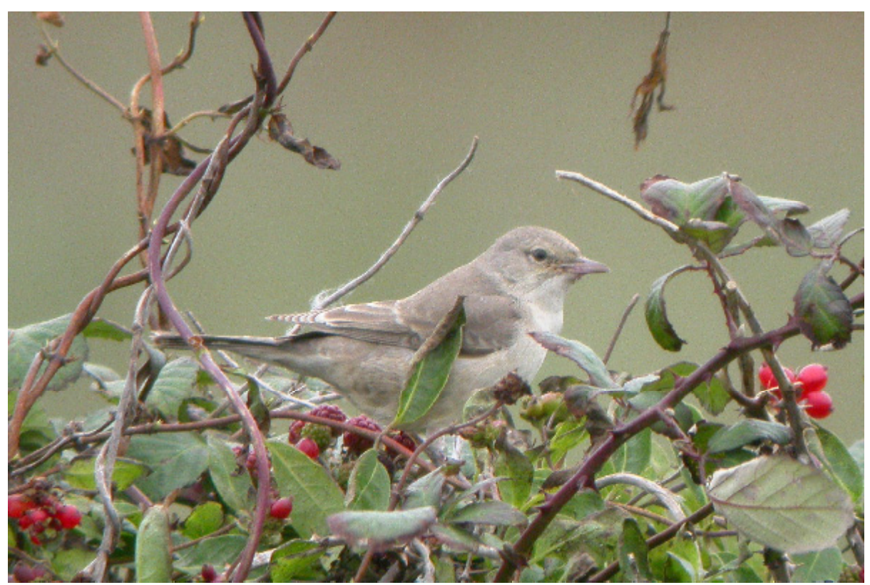
First-winter Barred Warbler Sylvia nisoria, Cape Clear Island, Co.Cork, 3rd October 2005.

A record tally, improving on the previous best of six in 1989.