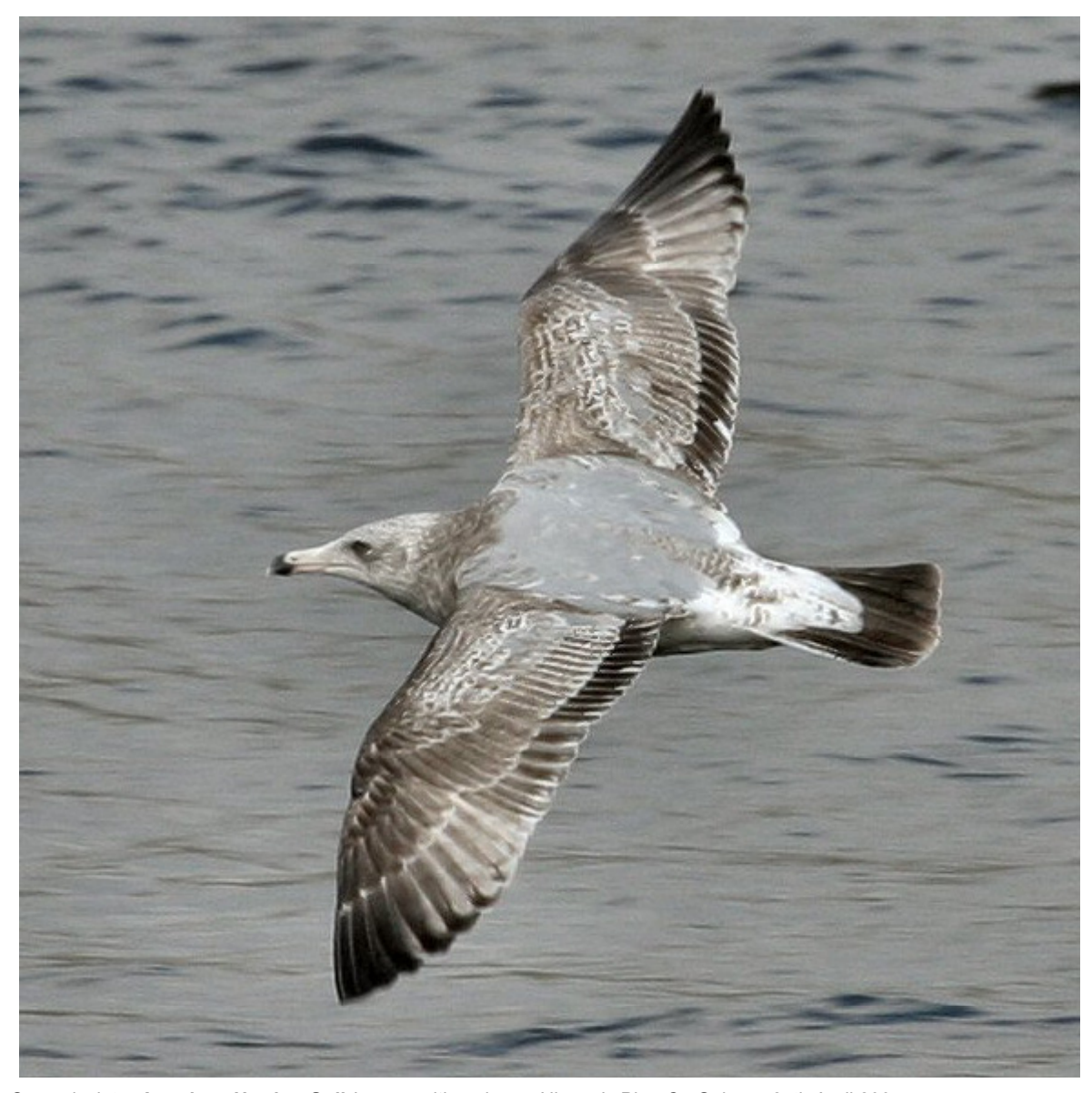
Second-winter American Herring Gull Larus smithsonianus, Nimmo's Pier, Co.Galway, 24th April 2005.