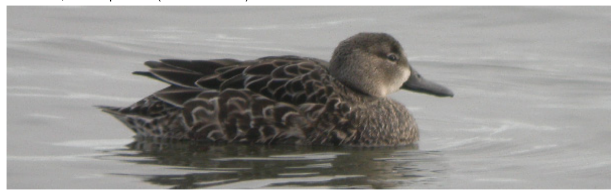
Adult female Blue-winged Teal Anas discors. Bull Island, Co.Dublin, 30th December 2005.

Wexford First-year female, North Slob, 17th September, shot on 1st October; presumed same individual, Tacumshin, 24th September (T. Kilbane et al. ).