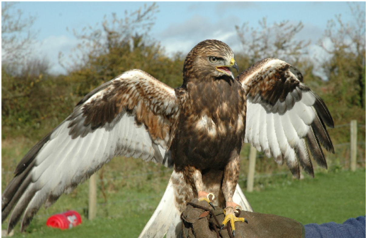
Juvenile Rough-legged Hawk Buteo lagopus sanctijohannis, Tulla, Co Clare, 28th October 2005.