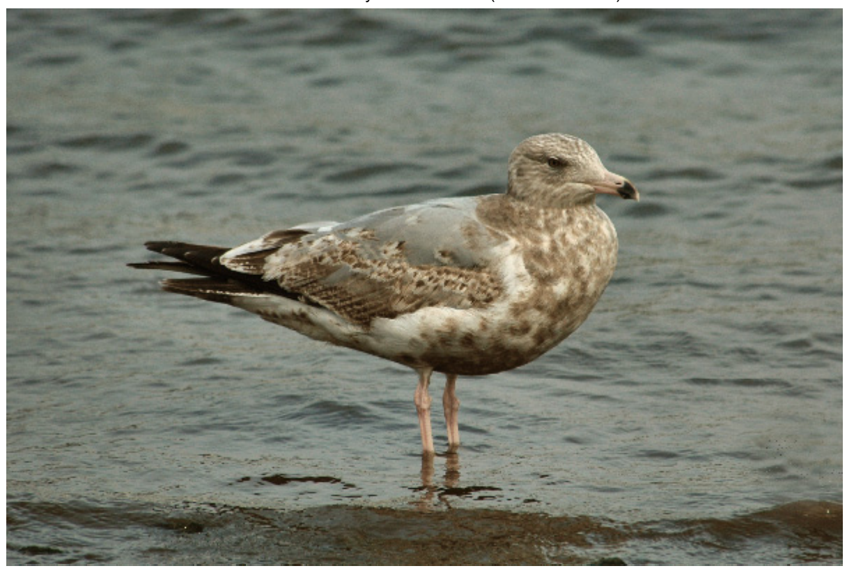
Second-winter American Herring Gull Larus smithsonianus , Nimmo's Pier, Co.Galway, 31st March 2005.

2003 Londonderry Two first-winters, Culmore Refuse Tip, 21st January, ( NIBR 16:102), in addition to three other individuals recorded at this site from January to March 2003 ( Irish Birds 7:561).