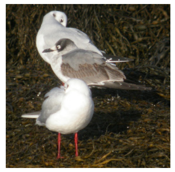
First-winter Franklin's Gull Larus pipixcan, Rossaveal, Co.Galway, 10th November 2005.