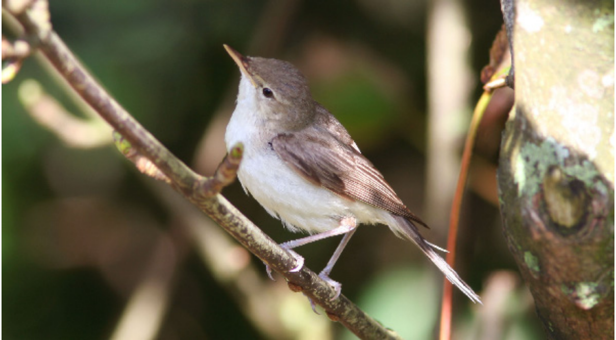
Eastern Olivaceous Warbler Hippolais pallida , Cape Clear Island, Co. Cork, 1st October 2006.

The third Irish record following records in 1977 and 1999.