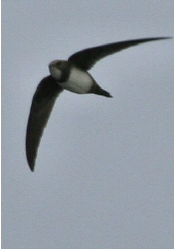
Alpine Swift Apus melba , Ballycotton, Co. Cork, 17th April 2006.

A good spread of records in early April. In the totals, the Wicklow sightings are assumed to have involved three individuals, though clearly, more may have been present.