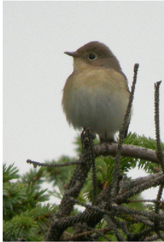
First-winter Red-breasted Flycatcher Ficedula parva , Cape Clear Island, Co. Cork, 16th October 2006.