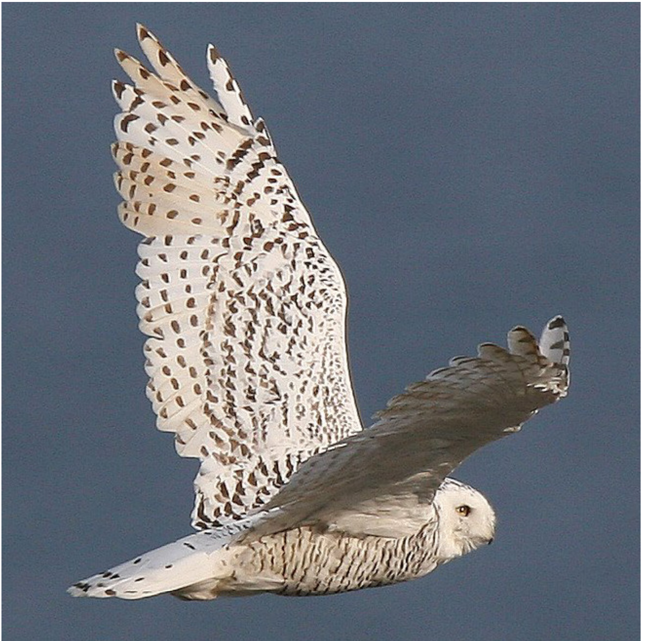
Second-year female Snowy Owl Bubo scandiacus , The Mullet, Co. Mayo, 9th September 2006.

A bird which considerably enlivens the dull landscape of western blanket bog. The increase in sightings is very encouraging for a species which has already attempted to breed ( Irish Birds 7:378).