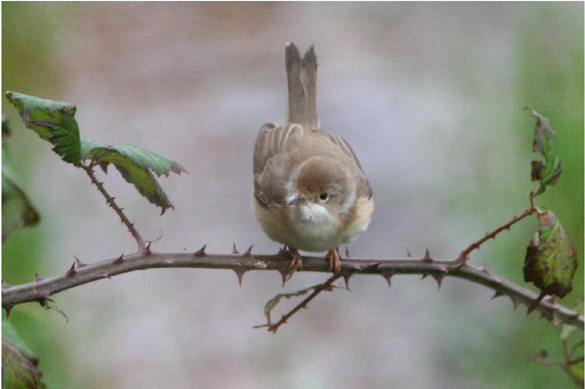
First-winter Subalpine Warbler Sylvia cantillans , Cape Clear Island, Co. Cork, 10th October 2006.

Cork First-winter, Cape Clear Island, 10th October, photographed (S.Wing et al. ); female, 13th October (C.Cronin et al. ). First-winter, Old Head of Kinsale, 15th October (H.Hussey, P.Rowe et al. ).