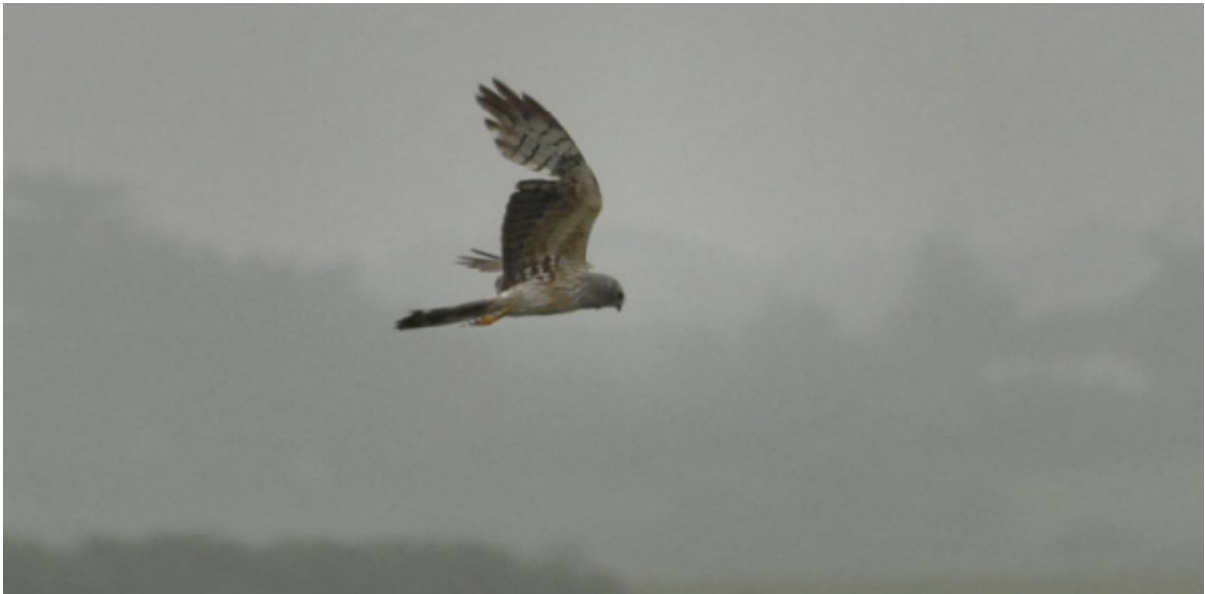
First-summer male Montagu's Harrier Circus pygargus, Tacumshin, Co. Wexford, 24th May 2006.

The Down bird followed hot on the heels of the first for Northern Ireland in 2005.