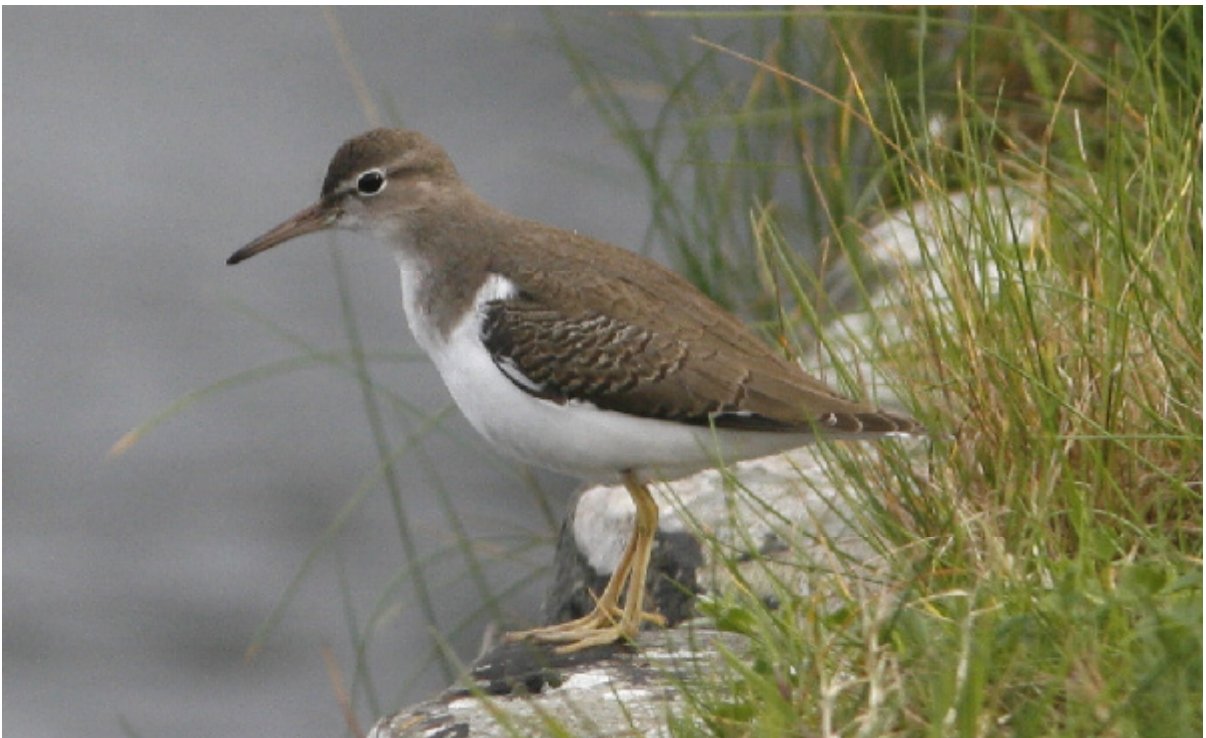
Juvenile Spotted Sandpiper Actitis macularia , Loop Head, Co. Clare, 7th October 2006.