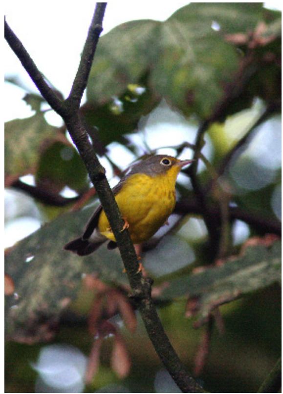
First-winter Canada Warbler Wilsonia canadensis , Loop Head, Co. Clare, 11th October 2006.