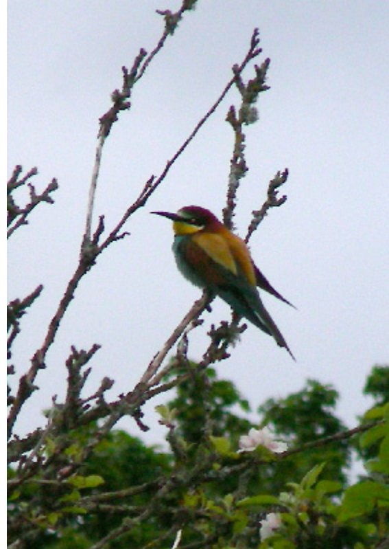
Adult Bee-eater Merops apiaster , Letterkenny, Co. Donegal, 28th May 2006.