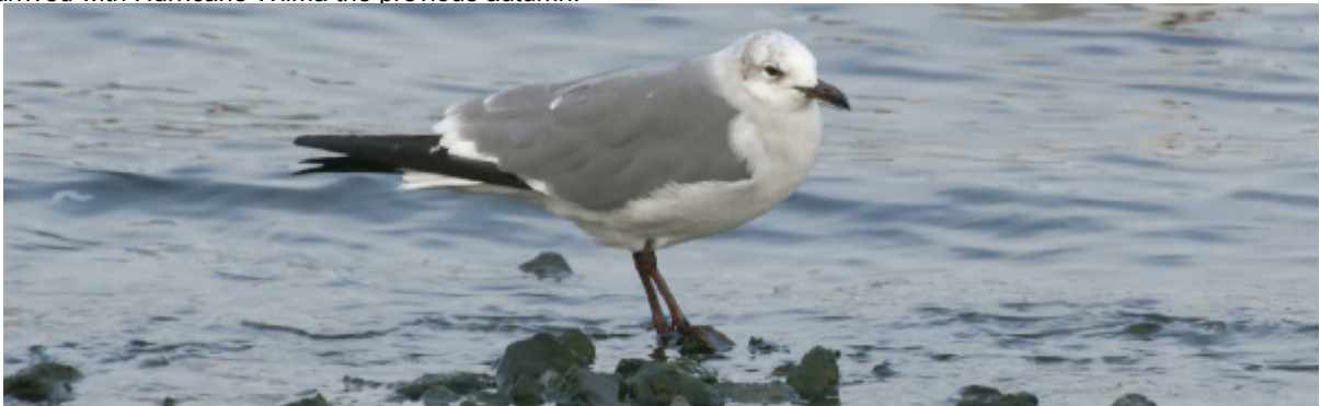
Second-winter Laughing Gull Larus atricilla , Nimmo's Pier, Co. Galway, 8th January 2006.

Eight more following the twelve seen in 2005. All were found in the first half of the year, presumably having arrived with Hurricane Wilma the previous autumn.