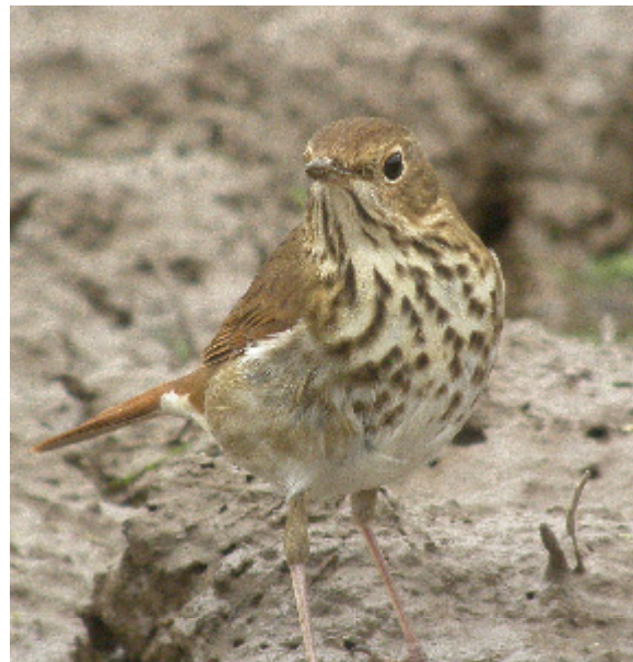
First-winter Hermit Thrush Catharus guttatus , Cape Clear Island, Co. Cork, 20th October 2006.