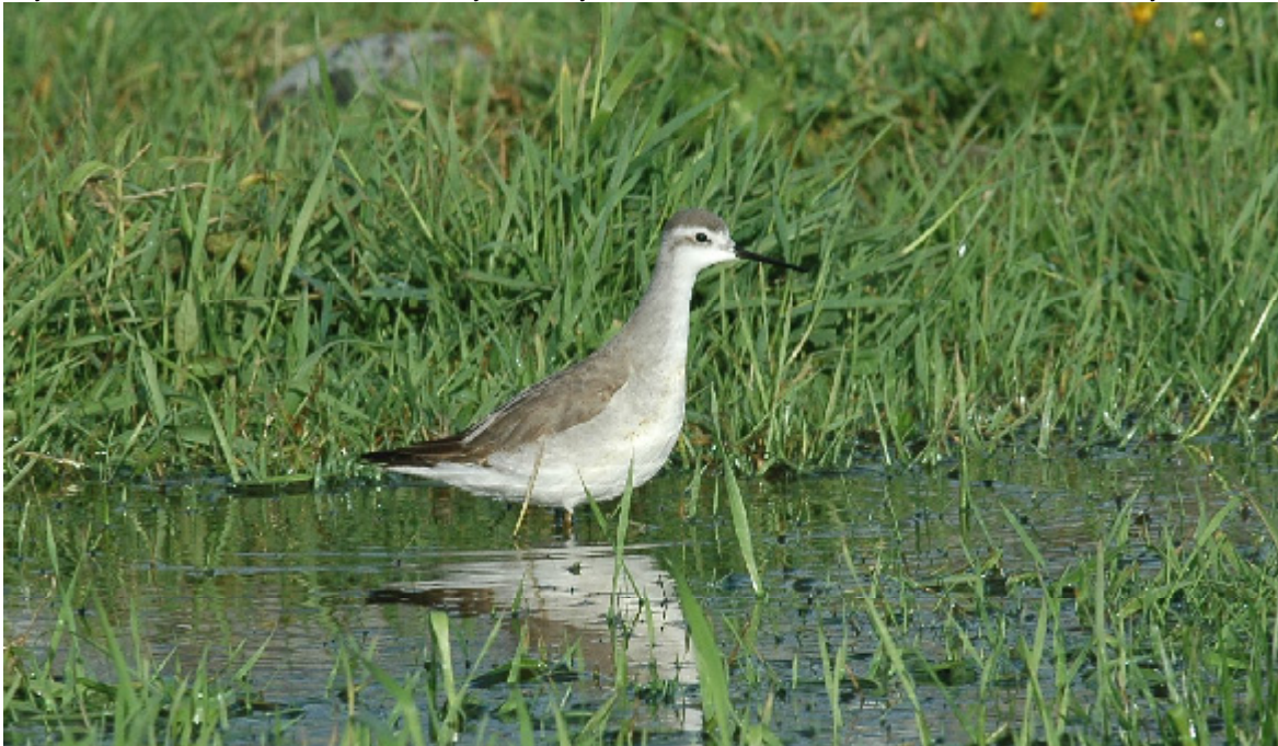
First-winter Wilson's Phalarope Phalaropus tricolor, Ross Bay, Bridges of Ross, Co. Clare, 24th September 2006.

Only the second for Clare and, remarkably, the only record to date from the west coast north of Kerry.