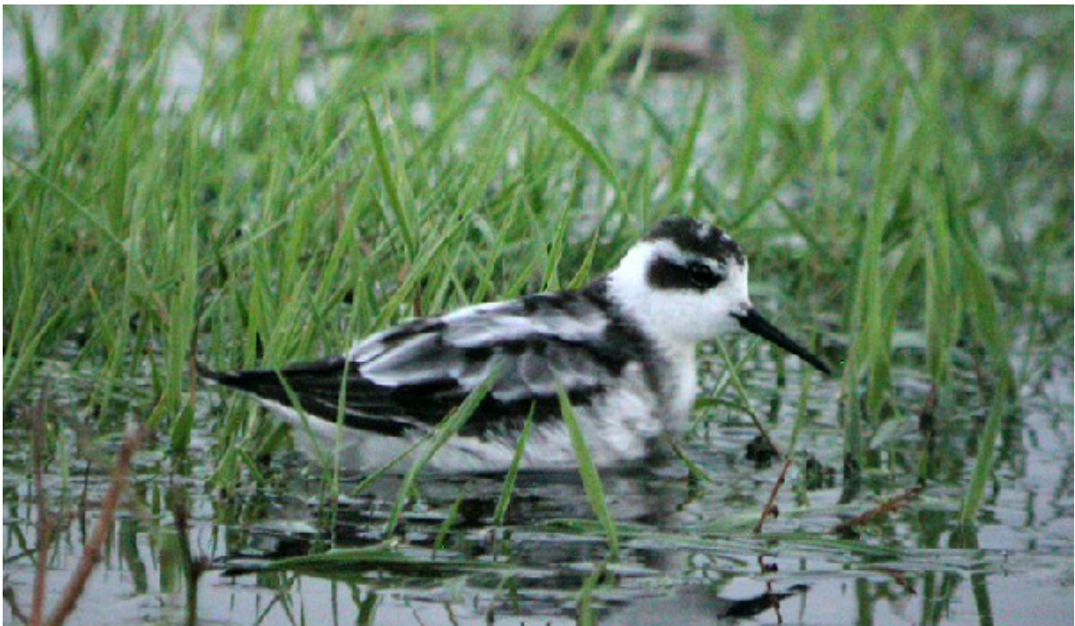
juvenile Red-necked Phalarope Phalaropus lobatus , Kilcoole, Co. Wicklow, 1st October 2006.

Wicklow Juvenile, Kilcoole, 1st to 4th October, photographed (A.G.Kelly, E.A.MacLochlainn et al. ).