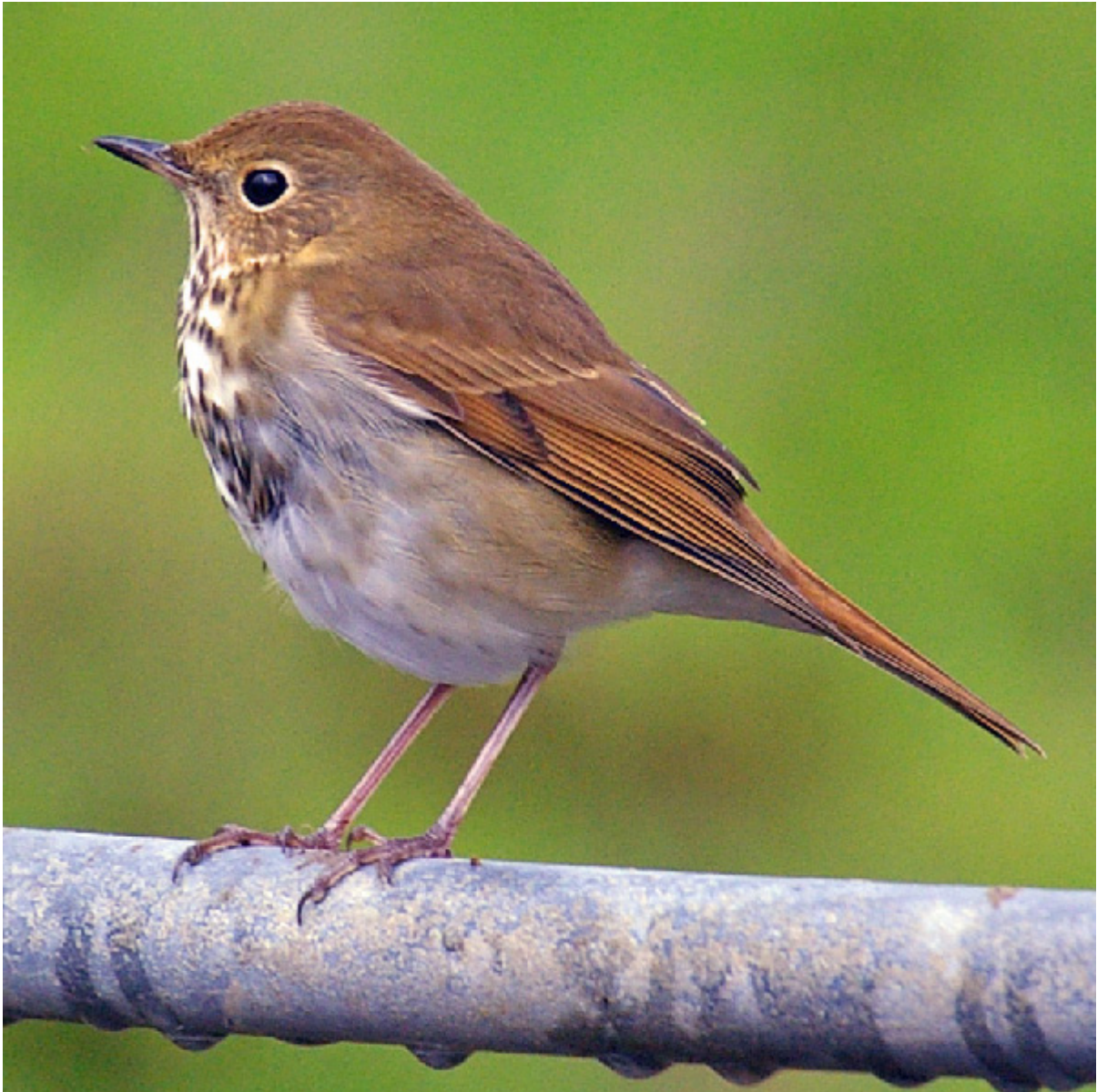
First-winter Hermit Thrush Catharus guttatus , Cape Clear Island, Co. Cork, 19th October 2006.

The second Irish record, the first having been in 1998. One of the star birds of the year, obliging all who witnessed it with memorable views and the photographers among them with prized shots. This is one of the rarest of the North American thrushes to have occurred in Europe, with only 7 records in Britain compared with 45 Grey-cheeked Catharus minimus and 24 Swainson's Catharus ustulatus , up to the end of 2006 (Dudley et al 2006).