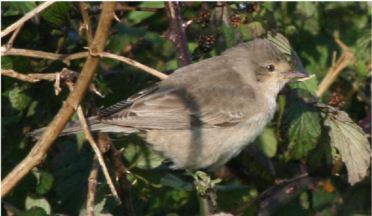
First-winter Barred Warbler Sylvia nisoria , Old Head of Kinsale, Co. Cork, 20th October 2006.

Donegal First-winter, Tory Island, 5th October (J.F.Dowdall et al. ).