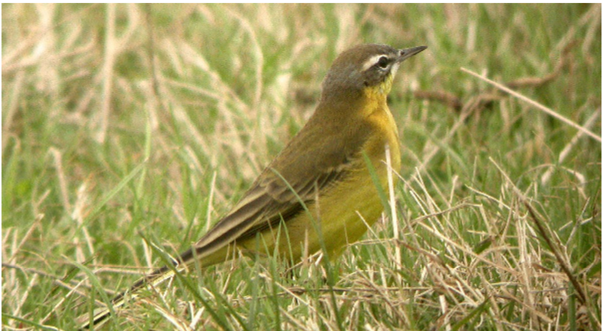
'Blue-headed' Wagtail Motacilla flava flava , Tacumshin, Co. Wexford, 23rd September 2006.

This bird was part of an exceptionally large flock of up to 40 Yellow Wagtails Motacilla f. flavissima that descended on some of the fields bordering the lake, their arrival coinciding with that of a Tawny Pipit Anthus campestris and a Black-winged Stilt Himantopus himantopus at the same location.