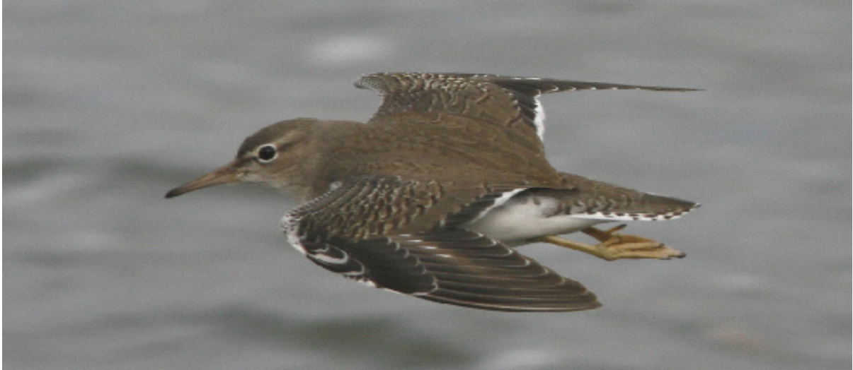
Juvenile Spotted Sandpiper Actitis macularia , Loop Head, Co. Clare, 7th October 2006.