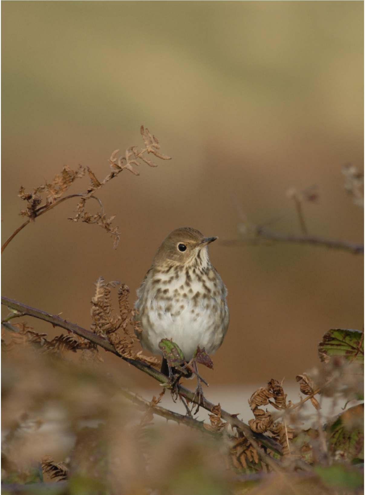
First-winter Hermit Thrush Catharus guttatus , Cape Clear Island, Co. Cork, 20th October 2006.