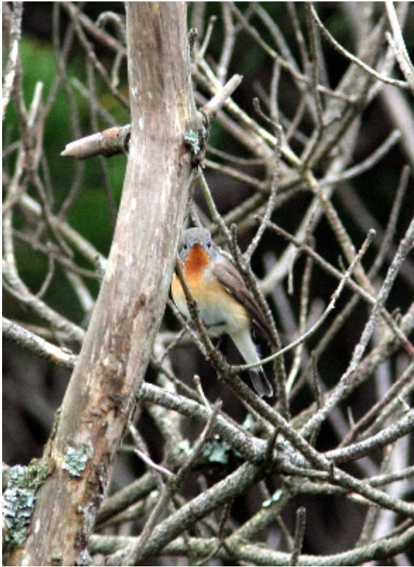
Adult Red-breasted Flycatcher Ficedula parva , Cape Clear Island, Co. Cork, 16th October 2006.