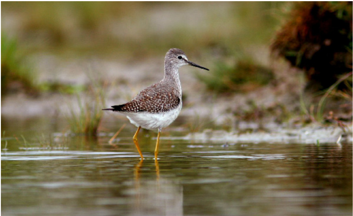
First-winter Lesser Yellowlegs Tringa flavipes , Lissagriffin, Co. Cork, 10th September 2006.

Wexford Juvenile, Rosslare Backstrand, 21st September (K.Mullarney), photographed.