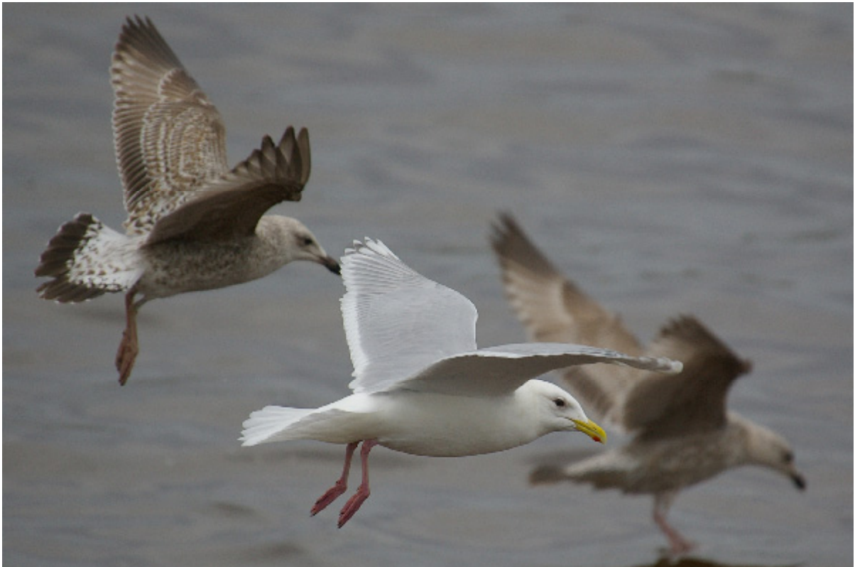
Adult Kumlien's Gull Larus glaucoides kumlieni , Killybegs, Co. Donegal, 12th March 2006.

A very poor year, mirroring the pattern of American Herring Gull Larus smithsonianus .