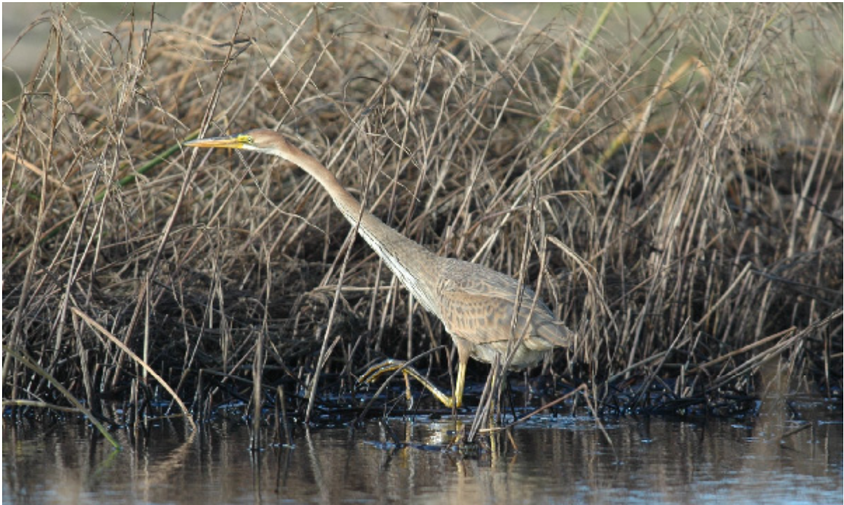
Juvenile Purple Heron Ardea purpurea, Lough Donnell, Co.Clare, 1st October 2006.

Only the third autumn record, the last of which was also in Clare (1996), and the first juvenile ever.