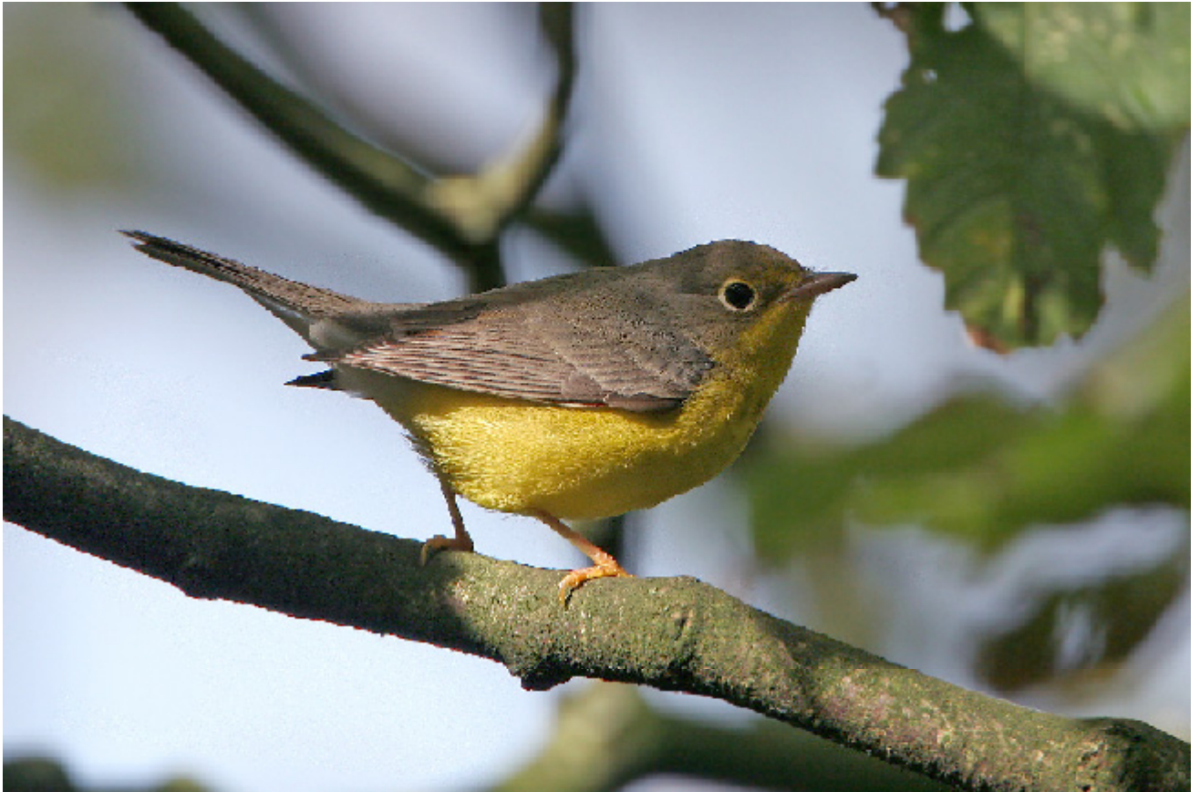
First-winter Canada Warbler Wilsonia canadensis , Loop Head, Co. Clare, 11th October 2006.

The first Irish record and the eleventh species of American warbler to be found in Ireland. The only previous Western Palearctic record concerns one seen in Iceland in September 1973.