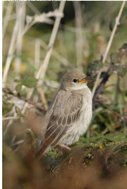
Juvenile Rose-coloured Starling Sturnus roseus , Cape Clear Island, Co. Cork, October 2006.