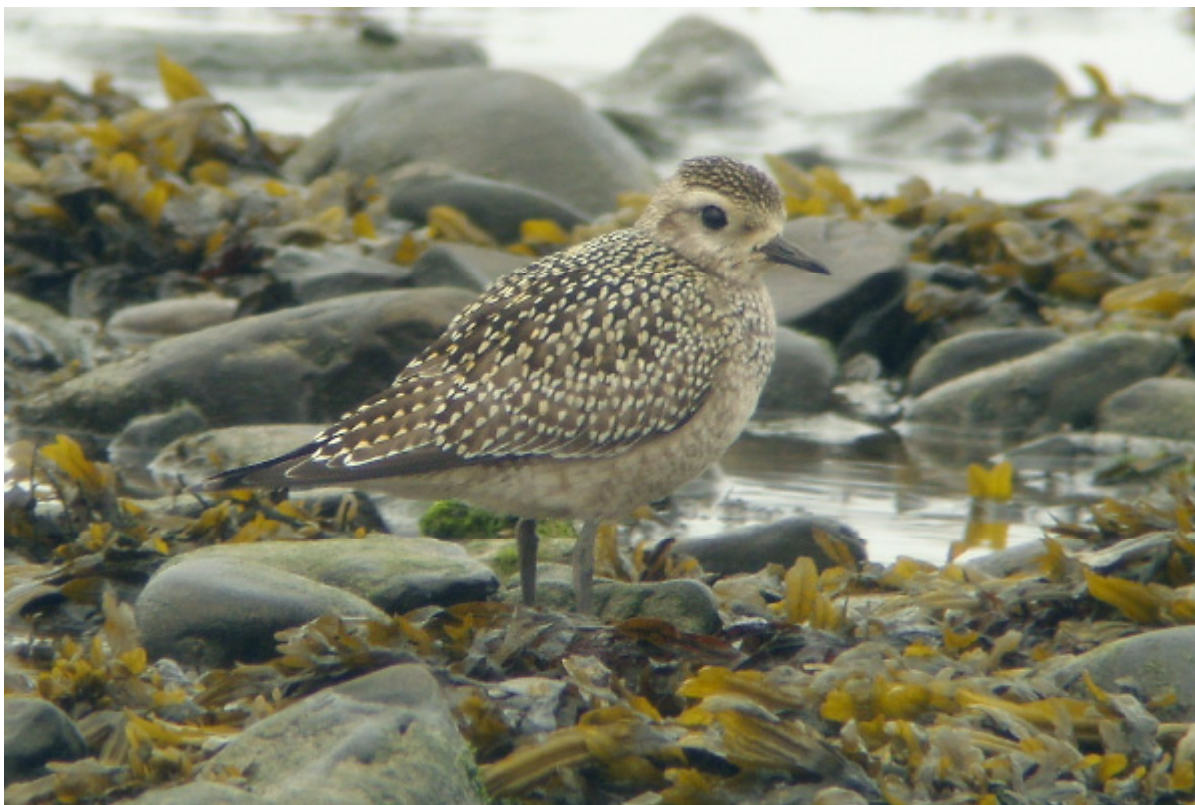
Juvenile American Golden Plover Pluvialis dominica , Doonbeg, Co. Clare, 14th October 2006.