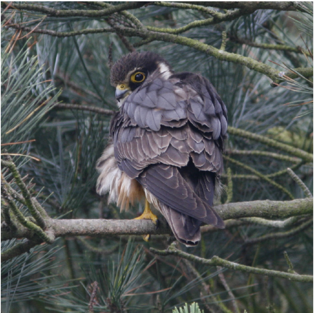
First-summer Hobby Falco subbuteo , North Slob, Co. Wexford, 17th June 2006.

A record showing, following a series of poor years for this species.