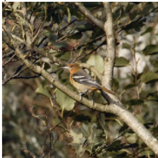
First-winter Baltimore Oriole Icterus galbula , Cape Clear Island, Co. Cork, 17th October 2006.