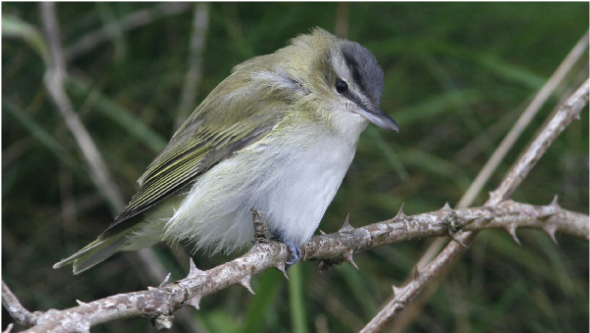
First-winter Red-eyed Vireo Vireo olivaceus, Loop Head, Co. Clare, 7th October 2006.