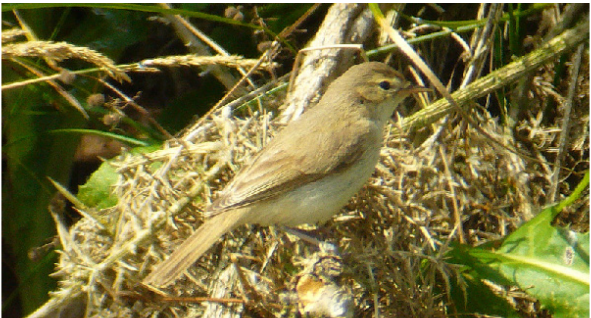
First-winter Booted Warbler Hippolais caligata , The Cunnigar, Dungarvan, Co. Waterford, 27th August 2006.

Waterford First-winter, The Cunnigar, Dungarvan, 26th and 27th August, photographed (C.Flynn, M.Cowming et al. ).