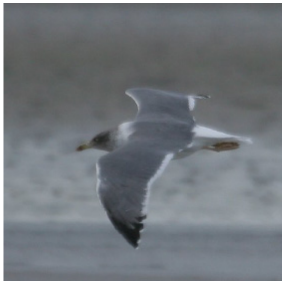
Adult Yellow-legged Gull Larus michahellis, showing characters of the Atlantic island form L. m. atlantis, Carrahane Strand, Co. Kerry, 4th October 2006.