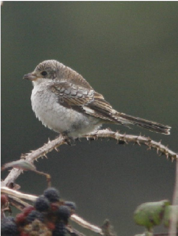
First-winter Woodchat Shrike Lanius senator , Hook Head, Co. Wexford, 1st October 2006.