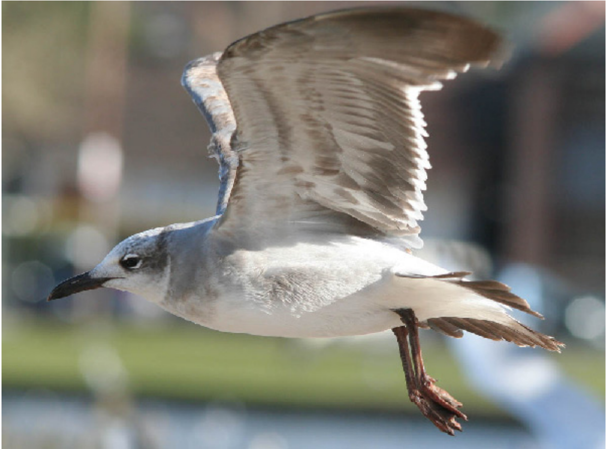
First-winter Laughing Gull Larus atricilla , The Lough, Cork City, 21st February 2006.