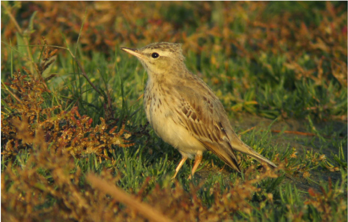
First-winter Tawny Pipit Anthus campestris , Tacumshin, Co.Wexford, 22nd September 2006.

Wexford First-winter, Tacumshin, 19th to 29th September, photographed (B.Haslam et al. ) ( Birdwatch 173: 68); one, presumed same, 15th October (N.Keogh).