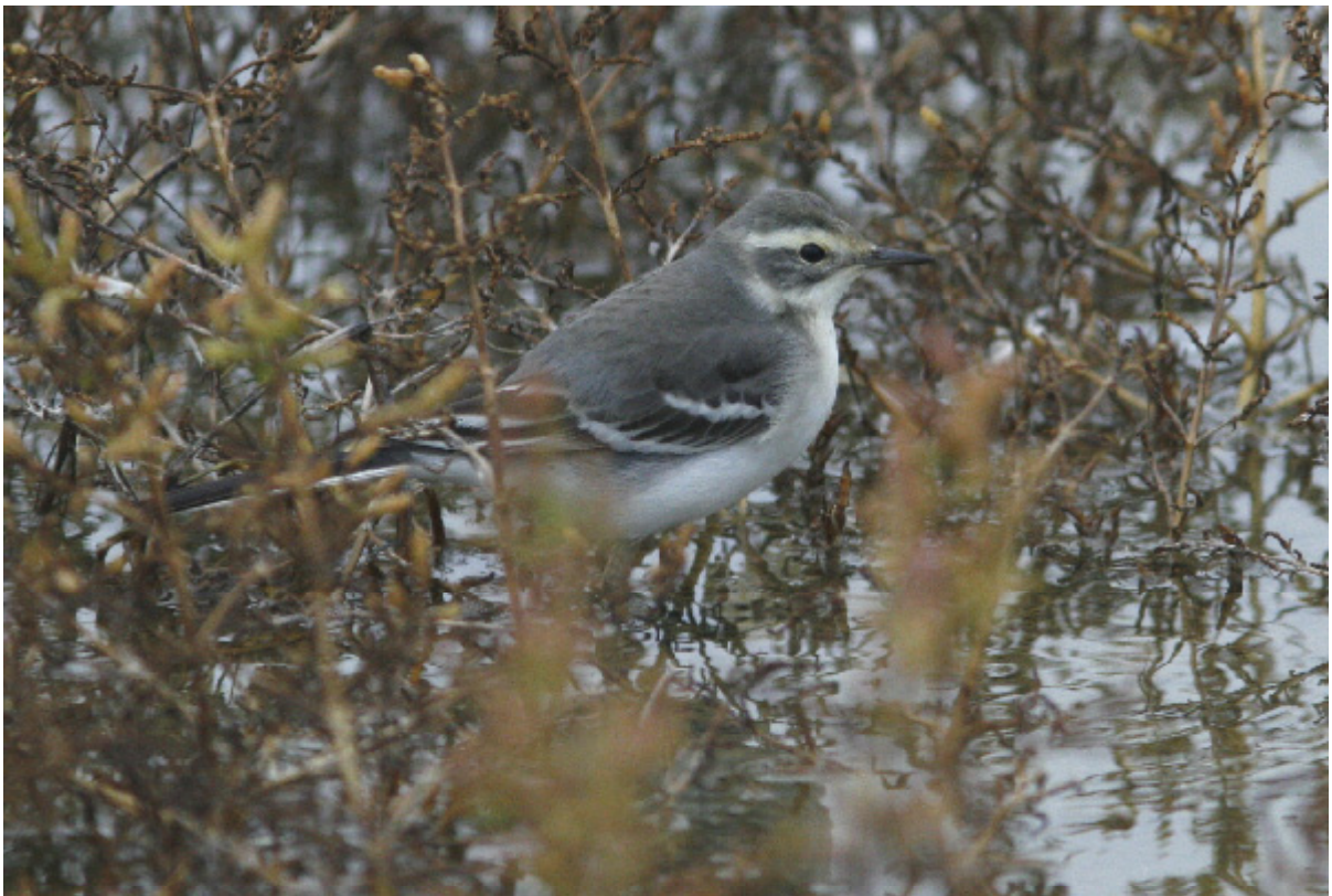
First-winter Citrine Wagtail Motacilla citreola , Tacumshin, Co. Wexford, 16th September 2006.