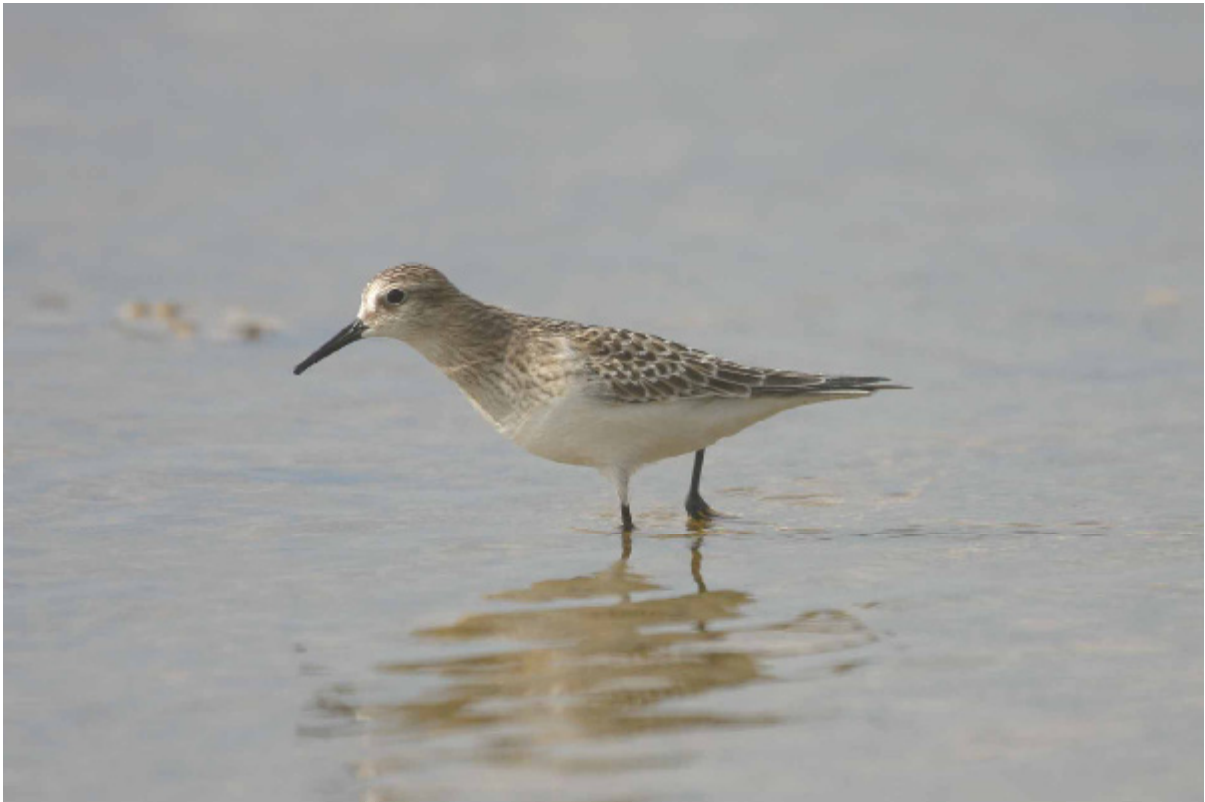
Juvenile Baird's Sandpiper , Calidris bairdii , The Mullet, Co. Mayo, 24th September 2006.

Wexford One, Tacumshin, 13th to 16th May, photographed (P.Kelly et al. ).