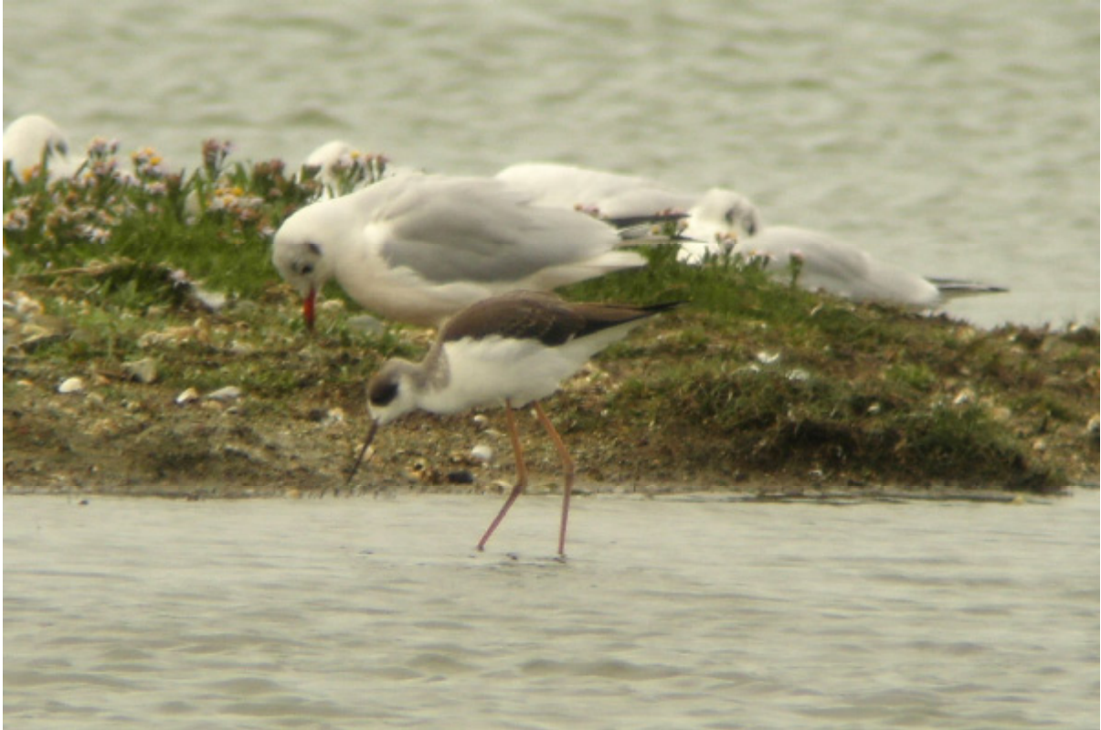
First-winter Black-winged Stilt Himantopus himantopus , Tacumshin, Co. Wexford, 22nd September 2006.

Of the 31 individuals recorded since 1981, the Wexford bird is only the seventh to be found in autumn and the first to be aged as a first-winter.