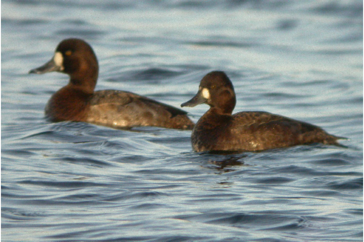
First-winter female Lesser Scaup Aythya affinis (right, with Greater Scaup Aythya marila ) Knock Lake, Co. Dublin, 28th November 2006.