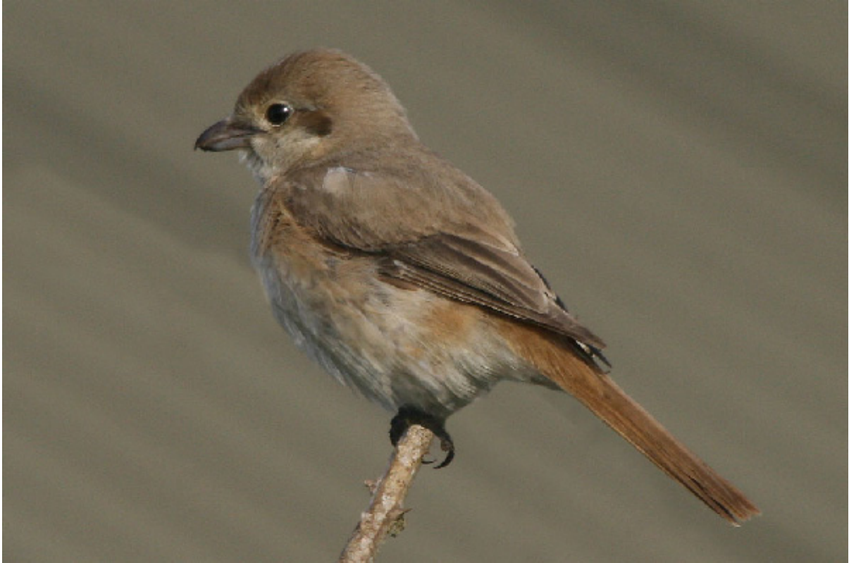
First-winter Isabelline Shrike Lanius isabellinus , considered to be a 'Daurian Shrike' L.i.isabellinus , Old Head of Kinsale, Co. Cork, 20th October 2006.

The second Irish record and, as with the first in 2000, considered to involve the race ( L.i. isabellinus ) or 'Daurian Shrike'.