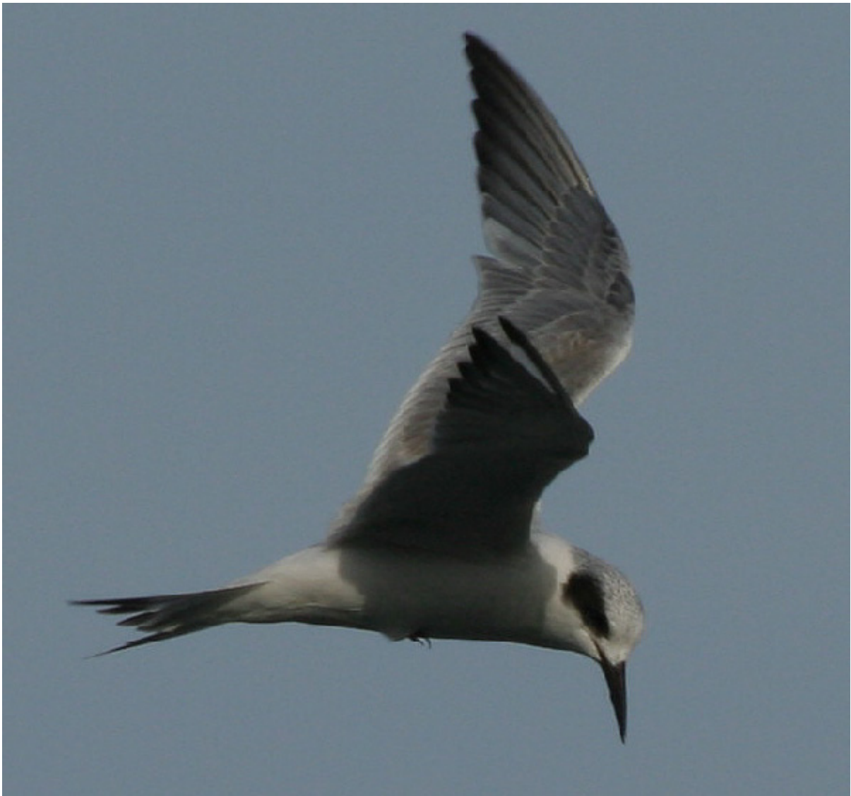
First-winter Forster's Tern Sterna forsteri , Ballycotton, Co. Cork, 22nd January 2006.

These include the long-overdue first for Cork.