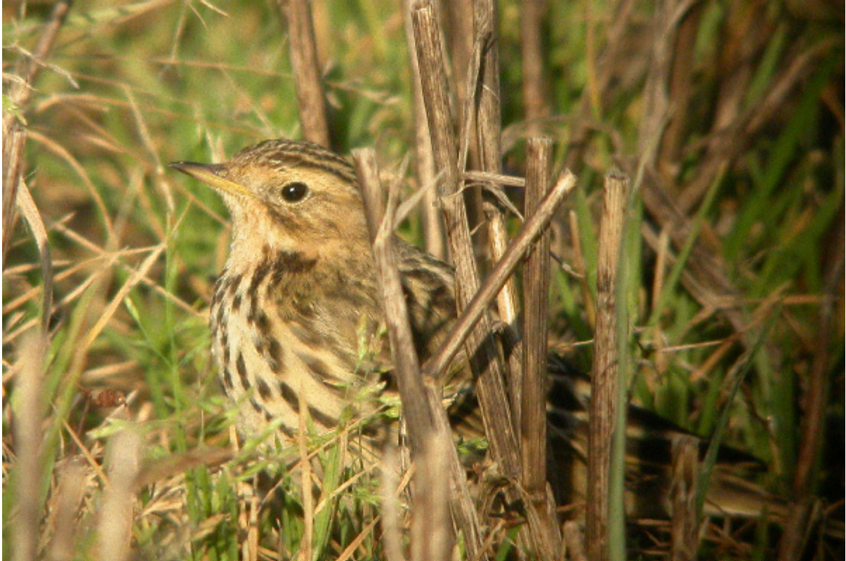
Red-throated Pipit Anthus cervinus, Rogerstown, Co. Dublin, 6th January 2007.

Winter records of this species north of the Mediterranean basin are extremely rare.