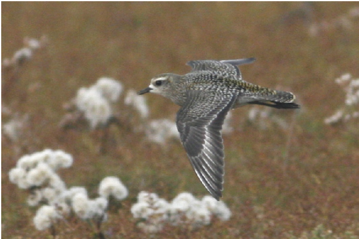
Juvenile American Golden Plover Pluvialis dominica , Tacumshin, Co. Wexford, 19th September 2006.

The total of 19 sets a new record, well exceeding the twelve of 2003. Late autumn occurrences continue to increase in frequency: prior to 2004, there were only three November records but over the past three years, no less than ten birds have been seen in that month.