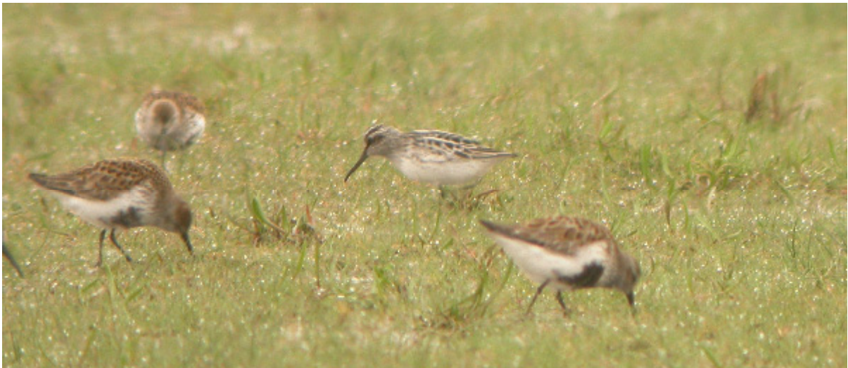
Broad-billed Sandpiper Limicola falcinellus, Tacumshin, Co. Wexford, 13th May 2006.