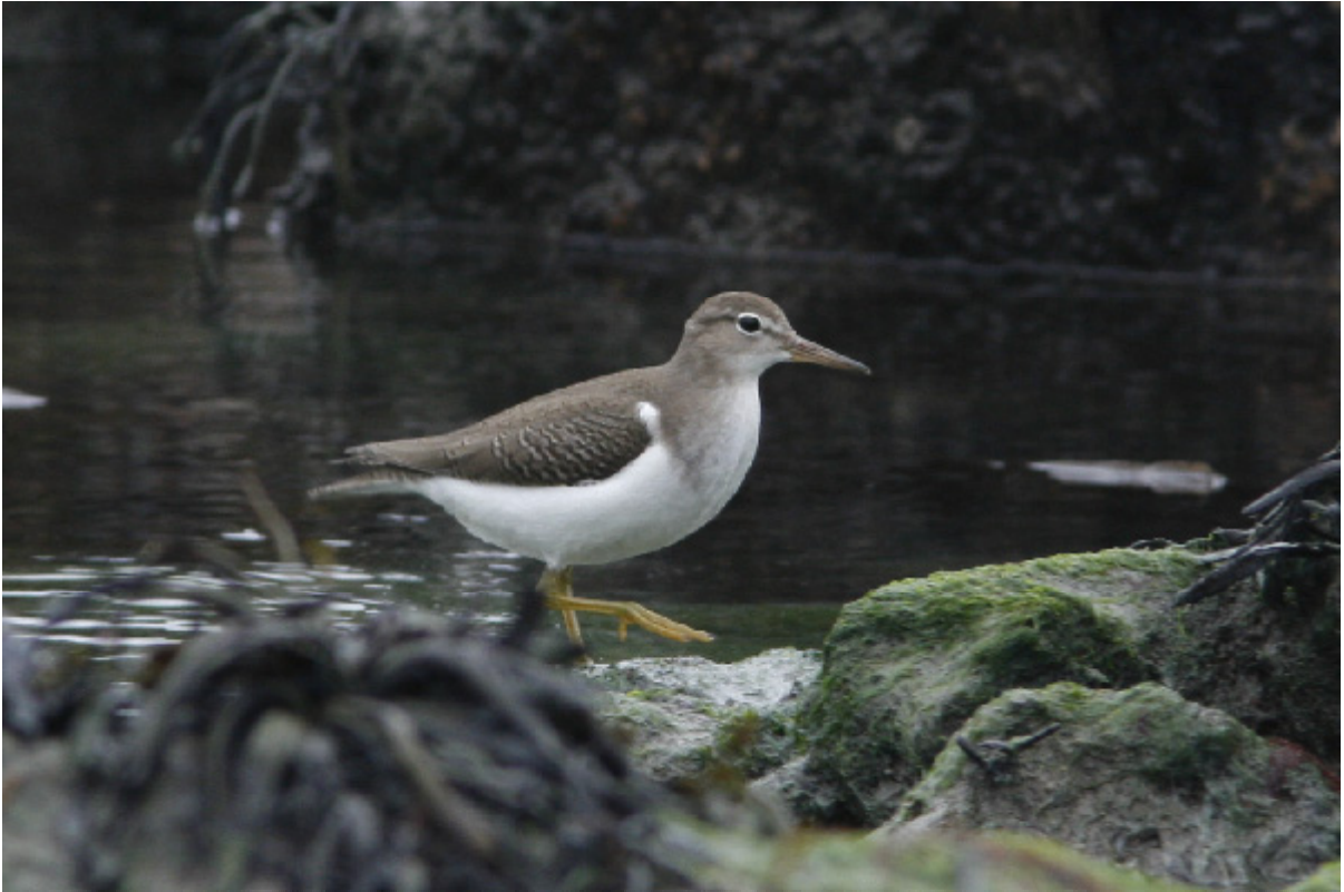
Juvenile Spotted Sandpiper Actitis macularia, Nethertown, Co. Wexford, 12th September 2006.

Another good year. Nine birds (almost half of the total) have been found since 2003. The August record from Limerick is the first for that month.