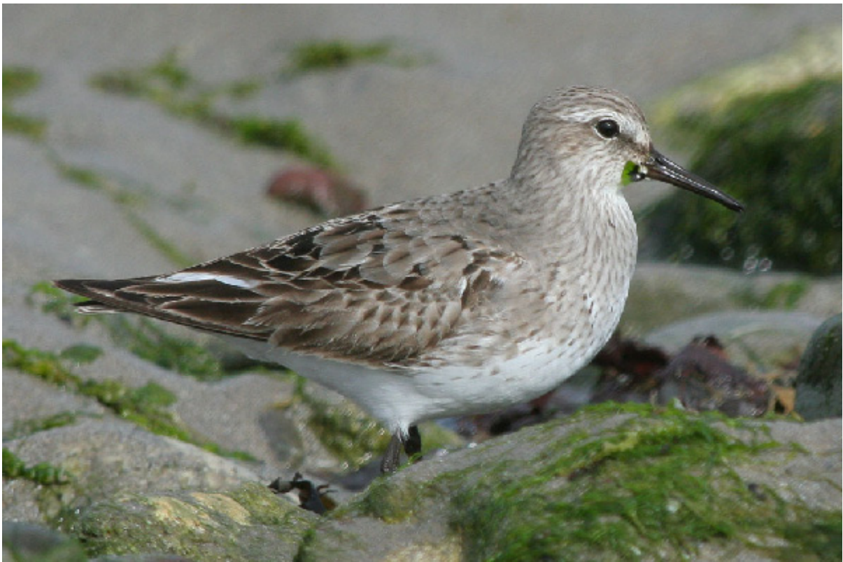
Adult White-rumped Sandpiper Calidris fuscicollis , Ballycotton, Co. Cork, 13th September 2006.

An astonishing total, leaving the previous record of twelve (in 1995 and 2000) in the shade. The gathering at Tacumshin in November is also the largest number ever seen at one site, improving on the peak of five present there on 8th-10th October 1996. The above series also includes the long overdue first for Waterford, as well as the first for Louth and second records for Clare and Sligo.