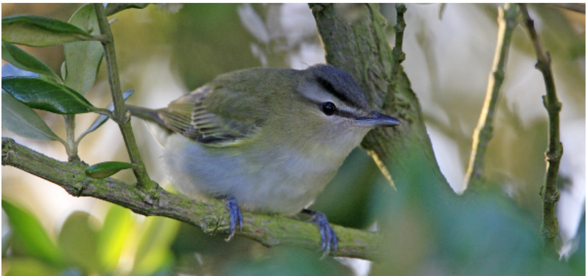
First-winter Red-eyed Vireo Vireo olivaceus , Loop Head, Co. Clare, 9th October 2006.