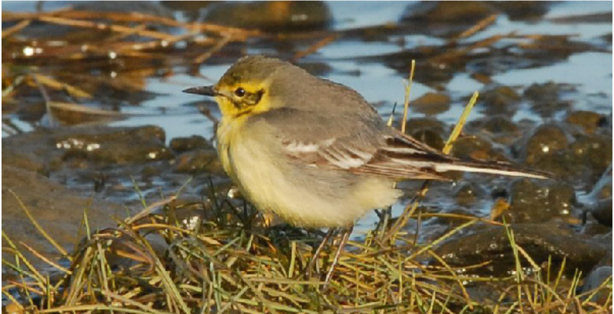
First-summer female Citrine Wagtail Motacilla citreola , Tacumshin, Co. Wexford, 2nd June 2006.

These include the second for Kerry and the first in spring; with the exception of the latter bird, all to date have been found in September or October.