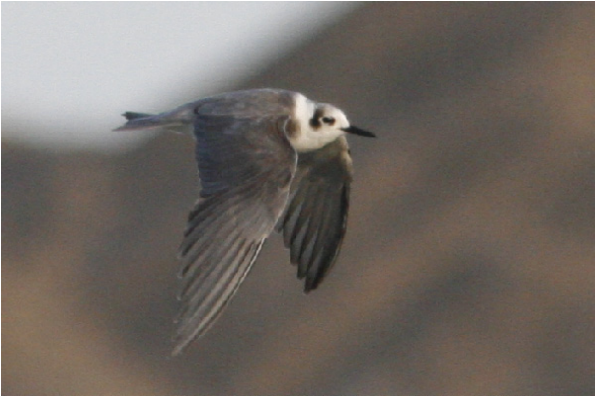
First-summer American Black Tern Chlidonias niger surinamensis , Lady's Island Lake, Co. Wexford, 16th July 2006.

The two previous records involved autumn juveniles in Dublin in 1999 and Kerry in 2003.