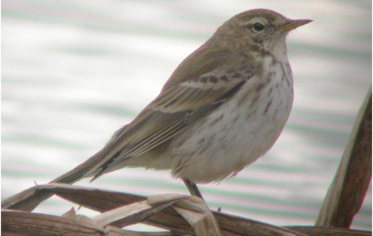
Water Pipit Anthus spinoletta , Kilmeaden Pools, Co. Waterford, 18th January 2006.

Wexford One, Tacumshin 23rd September, photographed (P.Kelly et al. ).