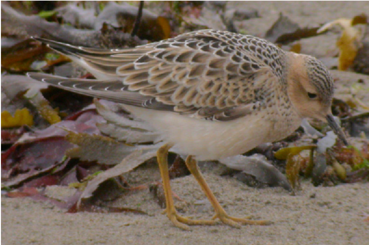
Juvenile Buff-breasted Sandpiper Tryngites subruficollis , Clonea Beach, Co. Waterford, 13th September 2006.

Yet another Nearctic wader found in record numbers.