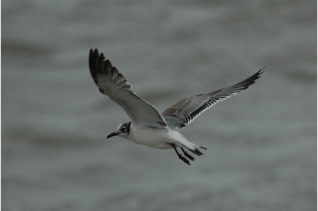
First-winter Franklin's Gull Larus pipixcan , Wicklow Harbour, Co. Wicklow, 19th March 2006.

Birds showing characters of the Atlantic island form L. m. atlantis , in particular the somewhat more distinctive Azorean population.