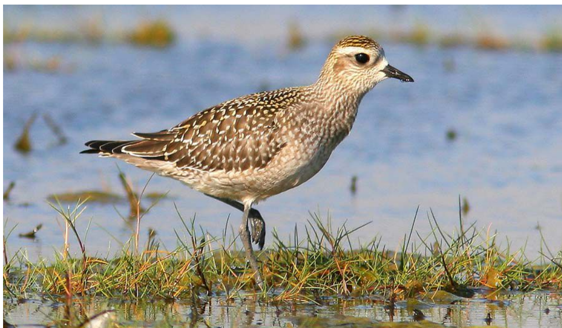
Juvenile American Golden Plover ( Pluvialis dominica ) Tacumshin, Co. Wexford, 22 September 2007.

Cork Juvenile, Ballycotton, 3 to 11 November, photographed (H.Hussey, R.McLaughlin et al. )