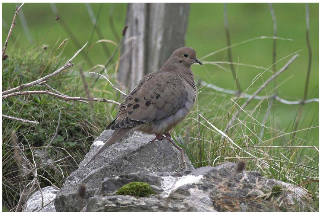
First winter Mourning Dove ( Zenaida macroura) Inishbofin, Co. Galway, 3 November 2007.