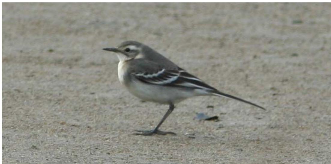
First-winter Citrine Wagtail ( Motacilla citreola ) Lissagriffin, Co. Cork, 22 September 2007.

Citrine Wagtails have been recorded annually since 2002 but this series includes only the second in spring, which, like the first, was found at Tacumshin.