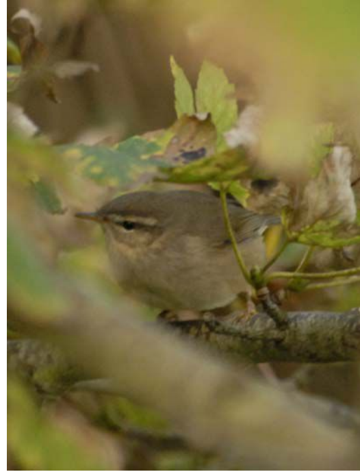
Dusky Warbler ( Phylloscopus fuscatus ) Ballycotton, Co. Cork, 22 October 2007.

2005 Cork One, trapped and ringed, Cape Clear Island, 4 to 17 September, photographed (S.Wing et al. ).