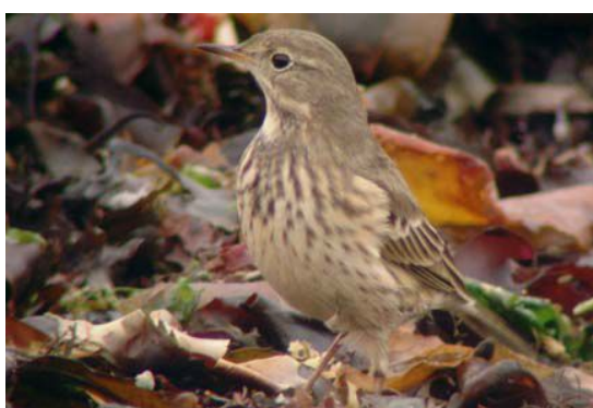
Buff-bellied Pipit ( Anthus rubescens ) Ballycotton, Co. Cork, 2 November 2007.