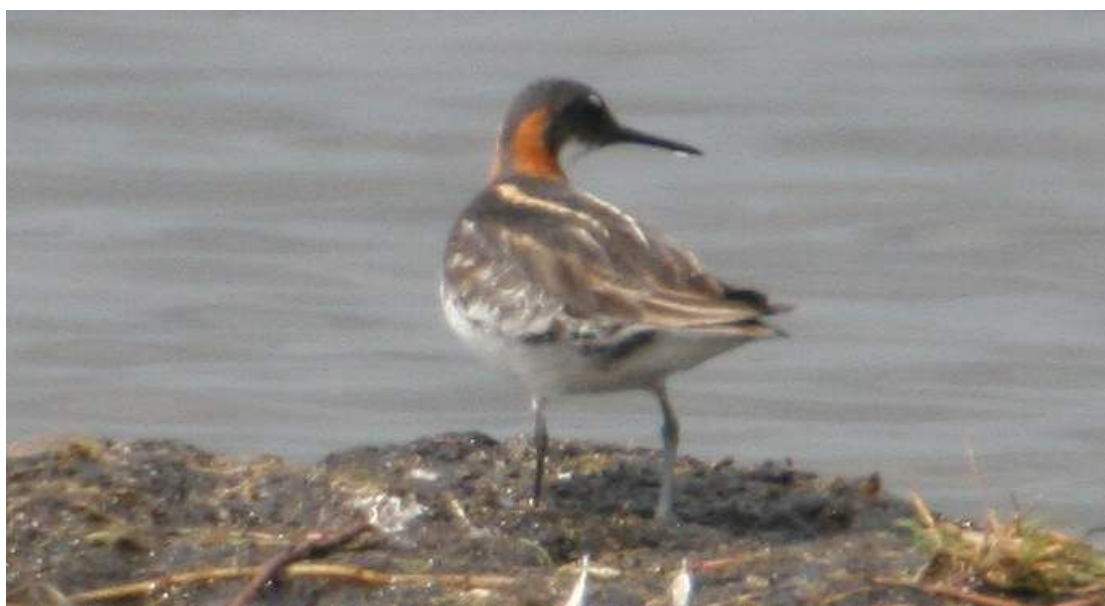
Adult female Red-necked Phalarope ( Phalaropus lobatus ) Lough Boora, Co. Offaly, 12 June 2007.

Antrim Adult, Kinbane Head, 12 September (G.Campbell). Juvenile, Ramore Head, 14 September (C.Guy).