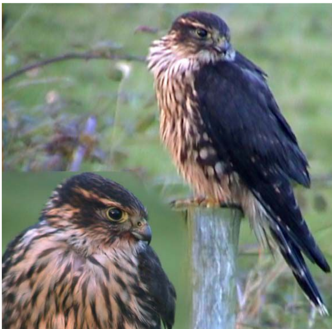
Female Taiga Merlin ( Falco columbarius columbarius ) Cape Clear Island, Co. Cork, 29 September 2000.

A good spread of records from the north and the south indicating the increasing frequency with which this species is met. The Cork record is only the second of two together in the Republic of Ireland, while the Fermanagh and Mayo records are the first for these counties.