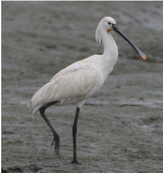
Third calendar year Spoonbill ( Platalea leucorodia ) Lough Beg, Co. Cork, 22 June 2007.