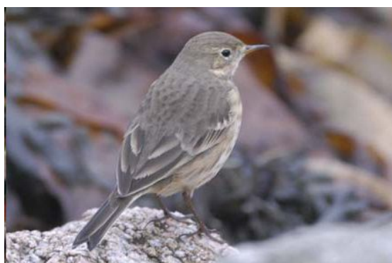
Buff-bellied Pipit ( Anthus rubescens ) Carnsore Point, Co. Wexford, 2 November 2007.