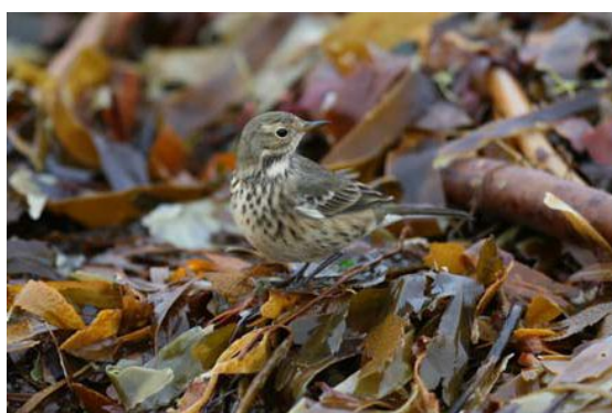
Buff-bellied Pipit ( Anthus rubescens) Clahane, Liscannor, Co. Clare, 13 October 2007.