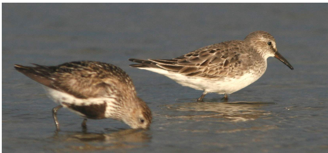
Adult or 1st summer White-rumped Sandpiper ( Calidris fuscicollis) with Dunlin ( Calidris alpina) Tacumshin, Co. Wexford, 15 August 2007.

Although a total of ten have been found in the past ten years, this species is still far from annual in occurrence. These are the first for both Donegal and Louth. The extremely early date of the spring record (the next earliest spring date is 23rd May) suggests that this bird had wintered further north than usual, perhaps even in Ireland.