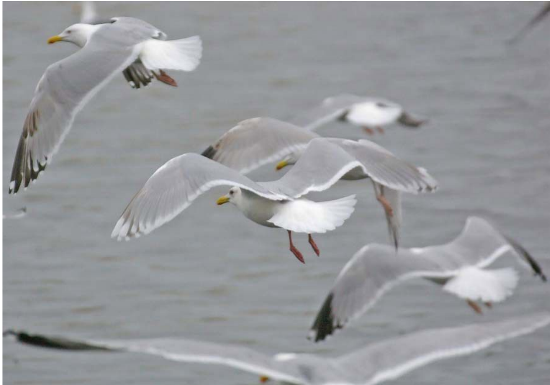
Adult Kumlien's Gull ( Larus glaucooides kumlieni ) Killybegs, Co. Donegal, 11 March 2007.

Antrim First-winter, Dargan Bay, 3 to 30 March, photographed (P.Kelly); second-winter, 30 December (D.Charles).