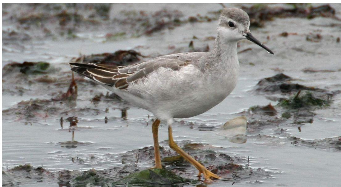
First winter Wilson's Phalarope ( Phalaropus tricolor) Nethertown, Co. Wexford, 29 August 2007.

The fourth year in the current decade that birds have been observed in late May or early June.