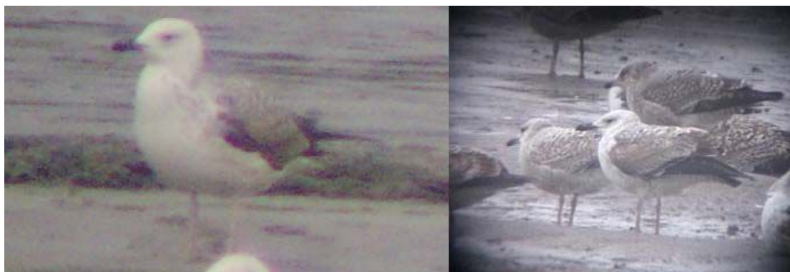
First –winter Caspian Gull ( Larus cachinnans ) Youghal Refuse Tip, Co. Cork. 24 February 2007

Eight of the overall total have been found in the first three months of the year, and all but one (the Cork / Waterford bird above) have been found at northern or eastern localities between Donegal and Wexford.