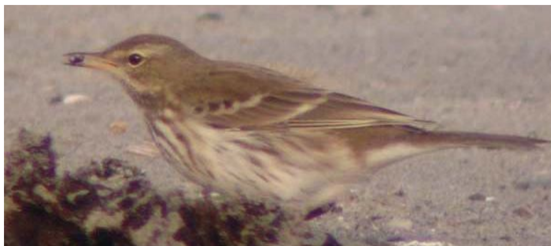
Water Pipit ( Anthus spinoletta ) Ballycotton, Co. Cork, 14 Nov 2007.

The Water Pipit boom continues - almost three-quarters of the overall total have been found in the current decade. However, it should be noted that the totals do not take the possibility of returning individuals, which some birds are quite likely to be (e.g. at Tacumshin), into account. This year's crop includes the first for Galway and, long-awaited there, Cork. The Pilmore / Redbarn area in the latter county furthermore hosted a Buff-bellied Pipit in December.