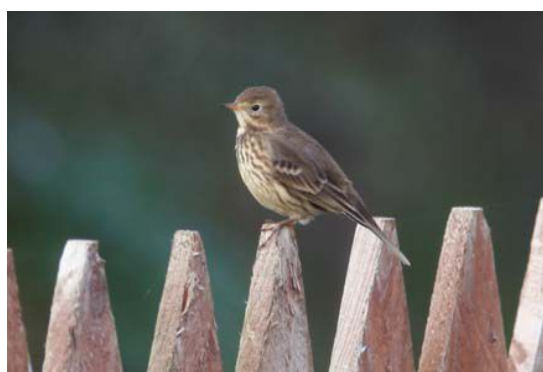
Buff-bellied Pipit ( Anthus rubescens ) Red Barn Beach, Youghal, Co. Cork, 25 November 2007.