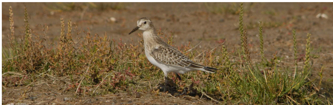
Juvenile Baird's Sandpiper ( Calidris bairdii ) Tacumshin, Co. Wexford, 22 September 2007.

The Inishkea Islands are perhaps not the most obvious place to search for American waders but the above bird was just one of three to be found there in mid-July. The only Galway record prior to the Inishbofin individual was in 1984, while the long-staying Cork bird that remained well into the winter is particularly noteworthy. The additional 2006 birds extend that year's record tally to a very impressive 31.