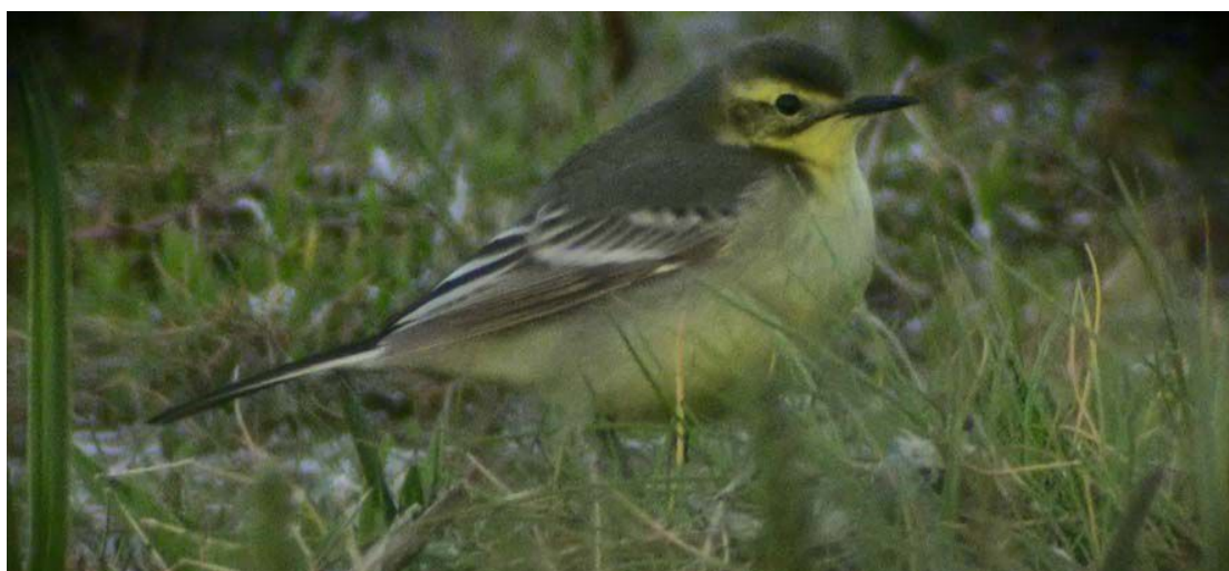
First-summer female Citrine Wagtail ( Motacilla citreola ) Tacumshin, Co. Wexford, 23 May 2007.

Cork One, Cape Clear Island, 15 October (P.Phillips, M.A.Stewart).