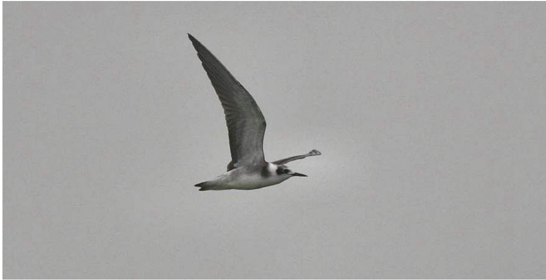
Juvenile American Black Tern ( Chlidonias niger surinamensis ) Rahasane Turlough, Co. Galway, 2 September 2007.