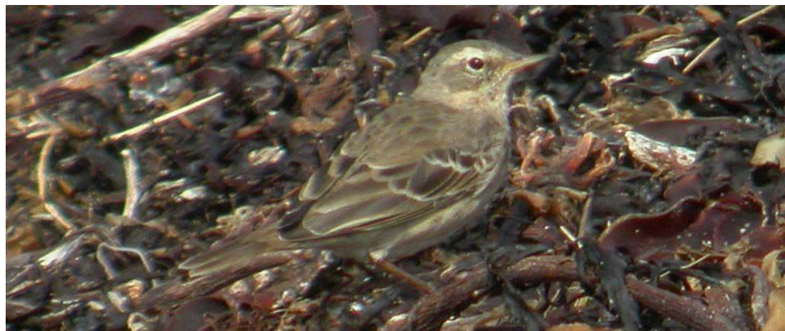
Water Pipit ( Anthus spinoletta ) Carnsore Point, Co. Wexford, 25 March 2007.