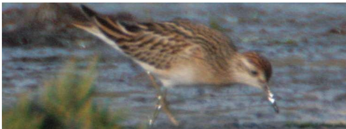
Juvenile Sharp-tailed Sandpiper ( Calidris acuminata ) Ballycotton, Co. Cork, 5 October 2007.

The first juvenile and considerably later than the first three, which were all found between 27 July and 14 September.