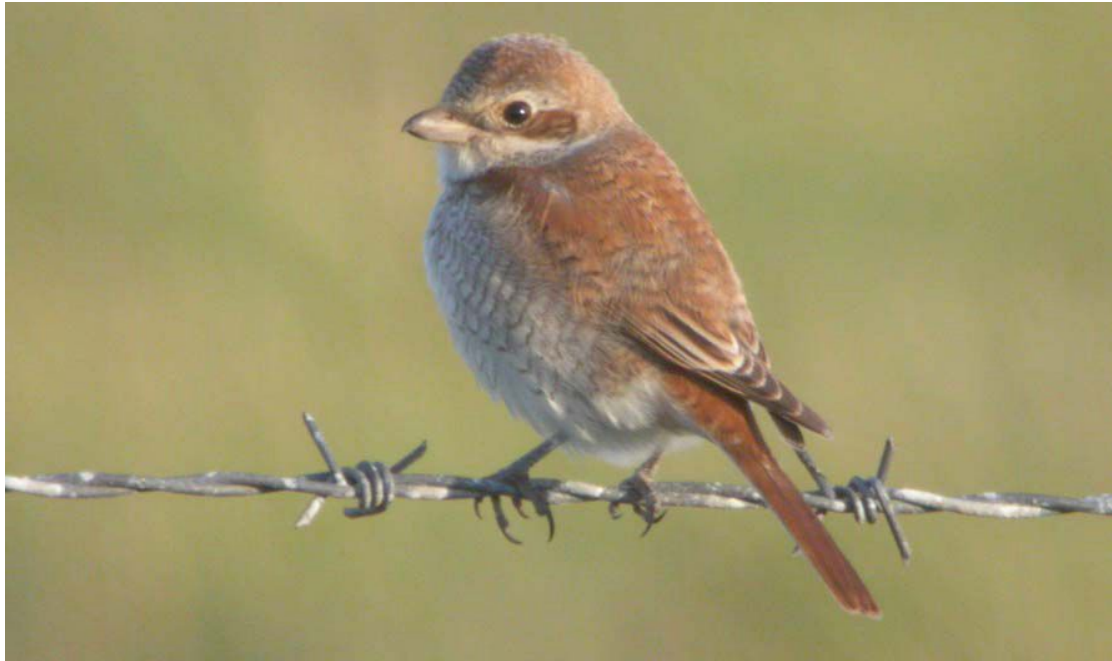
Juvenile Red-backed Shrike ( Lanius collurio ) Tory Island, Co. Donegal, 2 October 2007.