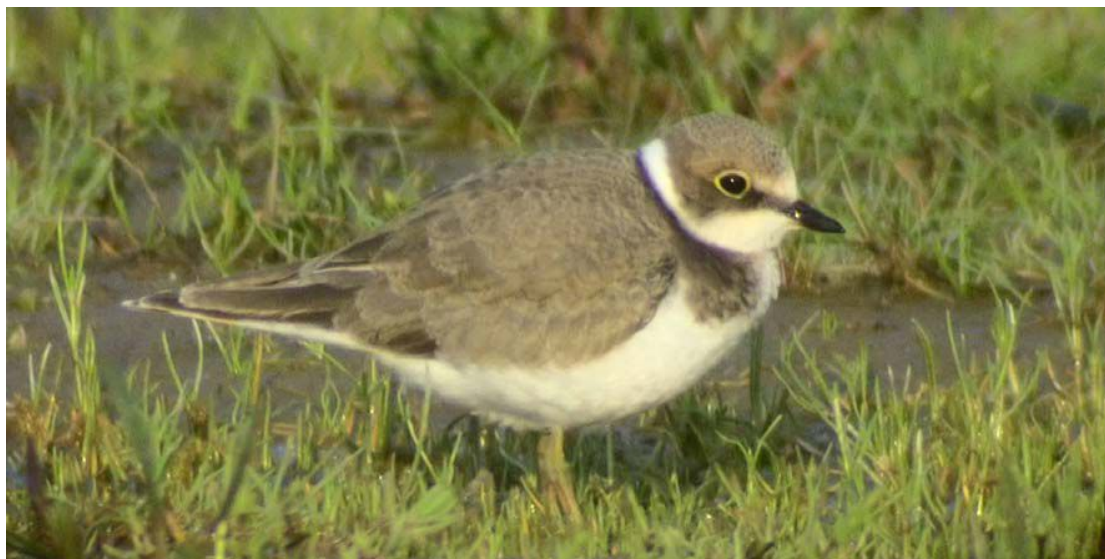
Juvenile Little Ringed Plover ( Charadrius dubius ) Tacumshin, Co. Wexford, 27 June 2007.

The Wexford individual was extremely late, only the fifth to be recorded in November and the first to linger into December.