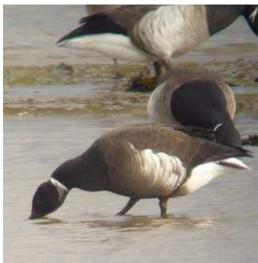
Adult Black Brant ( Branta bernicla nigricans ) Dungarvan, Co. Waterford, 11 February 2007.

Down One, Killyleagh Harbour, 26 March; presumed same individual, Myra Castle, 10 April (G.McElwaine, D.Nixon). One, Strangford Floodgates, 21 October to 4 November (D.Charles).