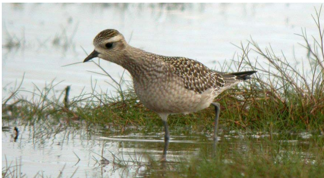
Juvenile American Golden Plover ( Pluvialis dominica ) Tacumshin, Co. Wexford, 21 September 2007.

The increase in late autumn records continues, with four more individuals seen in November.