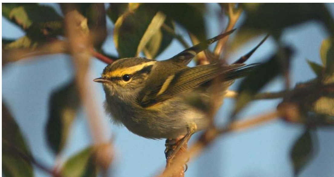
Pallas's Warbler Phylloscopus proregulus Hook Head, Co. Wexford 23 October 2007

A record year, continuing the run: there were four in 2006 and three in 2005. This series is also notable for its lateness; only four had previously been found in October, while a late August invasion of this species in Britain (Golley 2007) went unnoticed here.