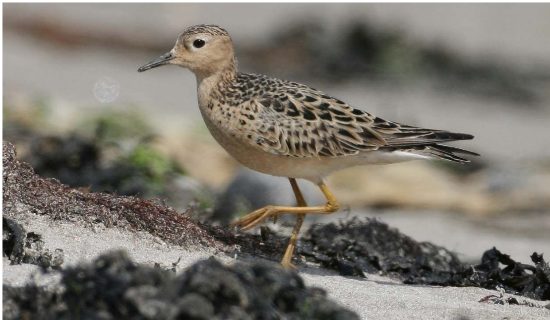
Adult Buff-breasted Sandpiper ( Tryngites subruficollis ) Ballycotton, Co. Cork, 22 June 2007.

Clare Juvenile, Doonbeg, 1 to 3 September (L.Benson et al. ).