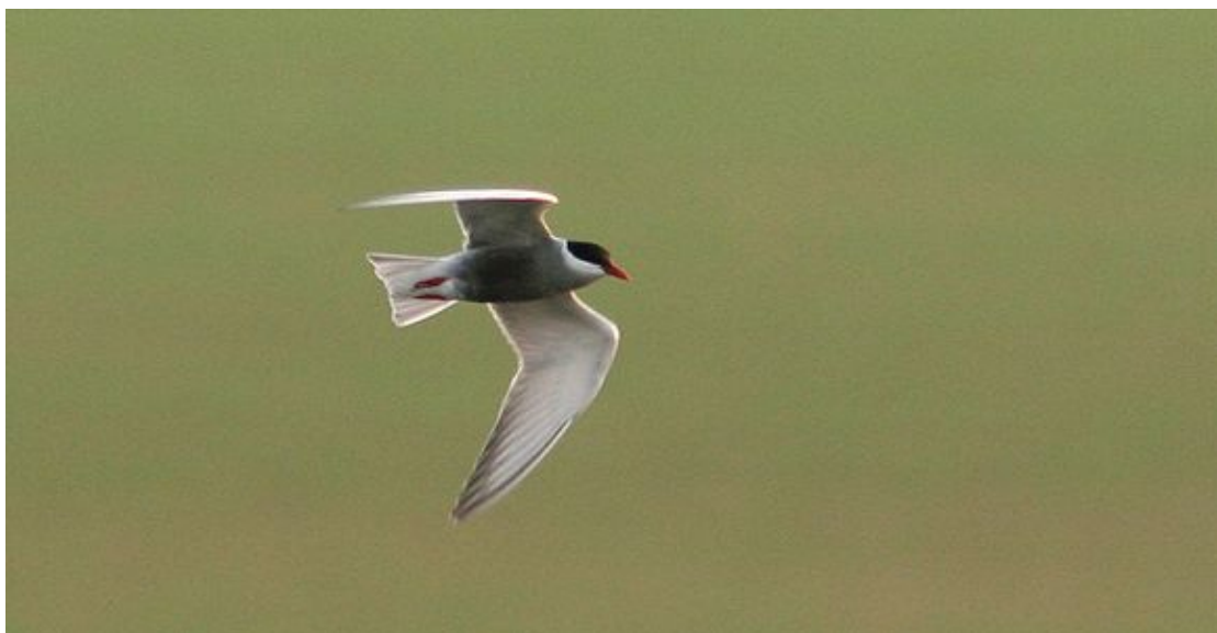
Adult summer Whiskered Tern ( Chlidonias hybrida) Lough Beg, Co. Cork, 30 April 2007.

Whiskered Tern Chlidonias hybrida (19; 1)