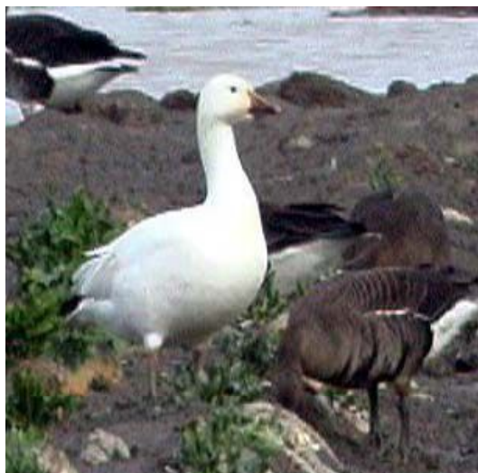
Snow Goose ( Anser caerulescens ) North Slob, Co. Wexford, 8 March 2007.

The first Irish record of this form, now recognised as a full species. Two records of small Canada Goose Branta canadensis , involving three birds seen in Cork and Dublin in 1985 ( Irish Birds 3: 297), were published as the subspecies minima (now a subspecies of Cackling Goose), under the caveat of "showed characters of...". In view of the complexities and difficulties of Canada and Cackling Goose identification, in particular at a subspecies level, the IRBC now regards the assignment of the 1985 birds to the form minima as tentative, at best, requiring confirmation through a review.