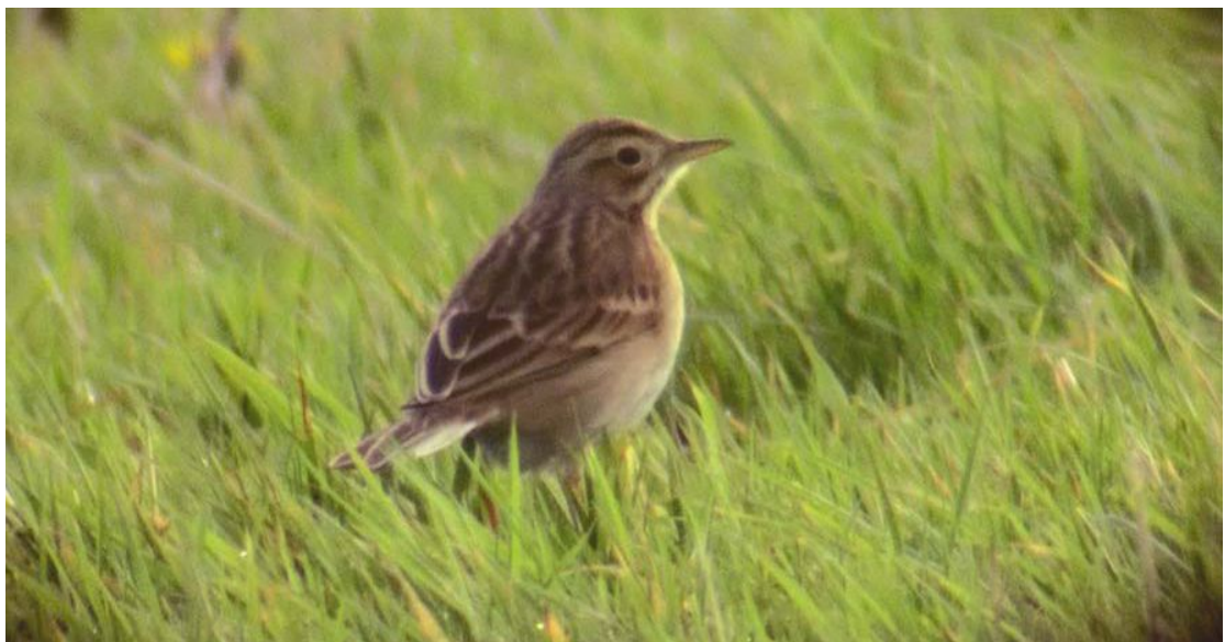
Richard's Pipit ( Anthus richardi) Tacumshin, Co. Wexford.