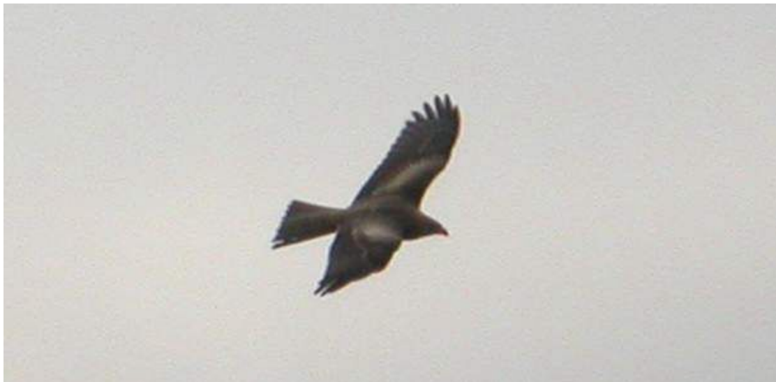
Juvenile Black Kite ( Milvus migrans ) South Slob, Co. Wexford, 13 September 2007.

These are the first since 1995, including only the second autumn occurrence ever. The only other autumn record also involved a long-staying individual, which remained in Wicklow for nine days in September 1982. Five of the total have been found in April.