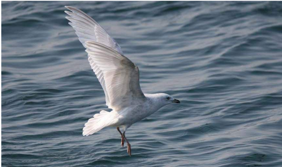
2nd winter Kumlien's Gull ( Larus glaucooides kumlieni ) Rossaveel, Co. Galway, 31 March 2007.

The late 2005 records published here extend the record total for that year to 17 birds, seven more than in the previous best year (1998), but even this figure pales compared to the 27 recorded in 2007. A notable aspect of the 2007 series is the relatively high proportion of older (3rd winter or adult) birds, these making up almost one-third of the total.