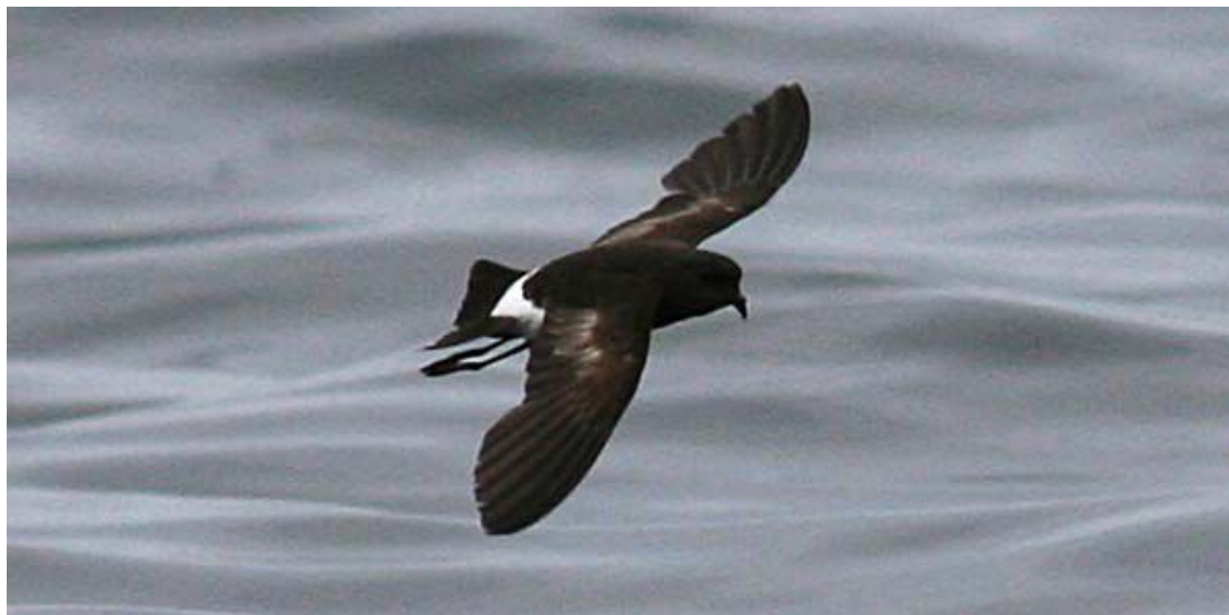
Wilson's Petrel ( Oceanites oceanicus) 6 miles SW of Inishtearaght, Blasket Islands, Co. Kerry 27 August 2007.

None in 2007, only the second blank year for this species since 1999. This 2006 record is the third at this locality since 1999. There is only one previous record of two together, off Cape Clear in September 1978.