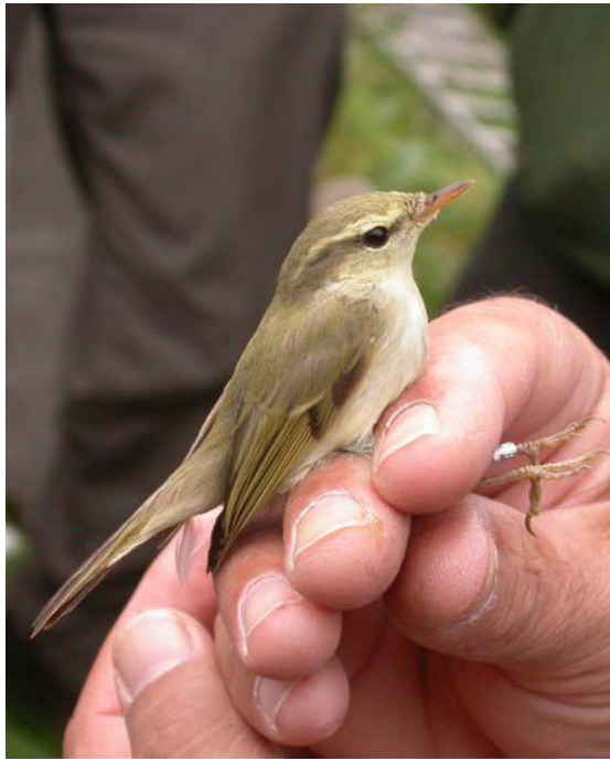
Greenish Warbler ( Phylloscopus trochiloides ) Cape Clear, Co. Cork, 11 October 2007.