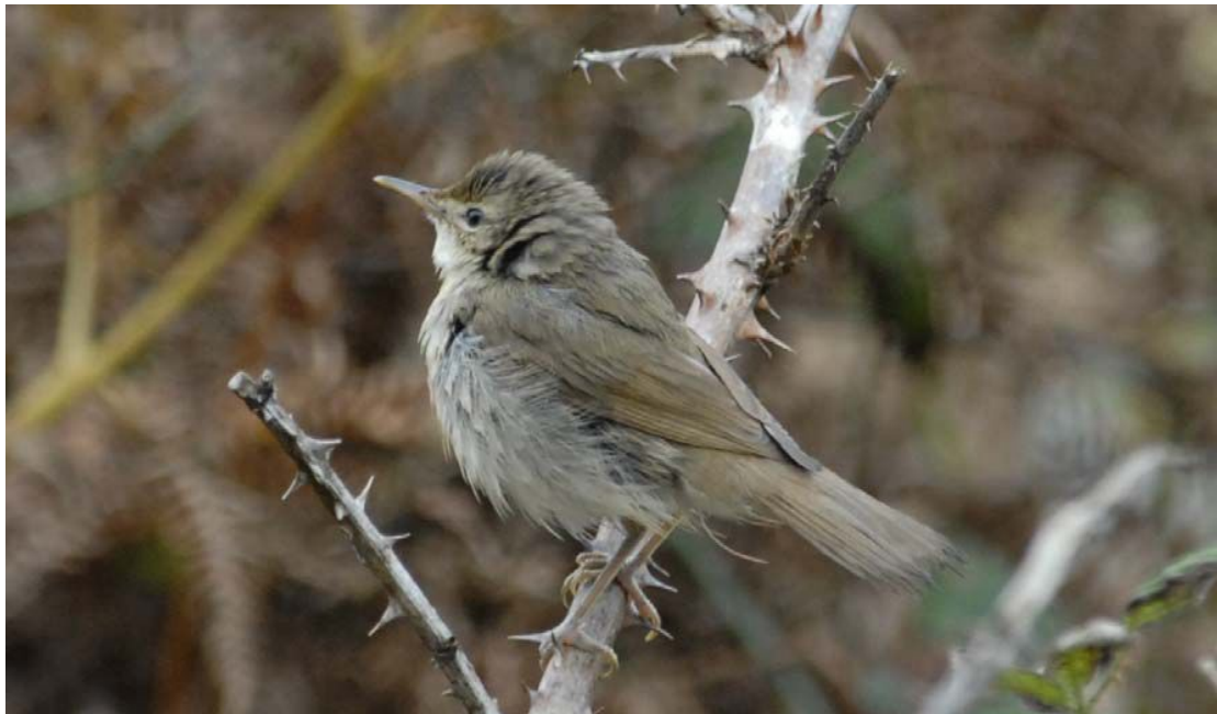
Blyth's Reed Warbler ( Acrocephalus dumetorum ) Cape Clear Island, Co. Cork, 20 October 2006

Cork One, Three Castles, Mizen Head, 10 to 15 October (K.Mullarney et al. ), sound-recorded, photographs Birdwatch 186: 76; Wings 47: 32 (Mullarney 2007b).