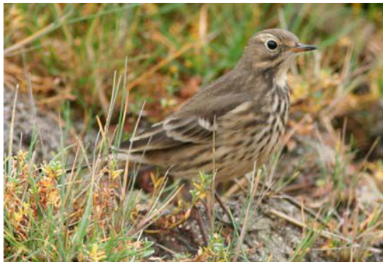
Buff-bellied Pipit ( Anthus rubescens ) – second bird - Lissagriffin, Co. Cork, 7 October 2007.