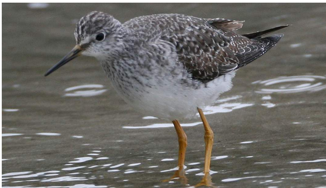
First winter Lesser Yellowlegs ( Tringa flavipes ) Rosscarbery, Co. Cork, 22 January 2007

Another excellent showing, including the first for Donegal. The three years 2005 to 2007 account for almost one-quarter of the overall total. Each of these years has furthermore seen new individuals (first-years) wintering in the Rosscarbery / Inchydoney area in Cork.