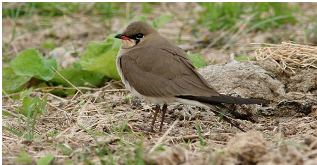
Adult Collared Pratincole ( Glareola pratincola) Annagh Beach, The Mullet, Co. Mayo, 7 June 2007.

June arrivals are unusual but not unprecedented.