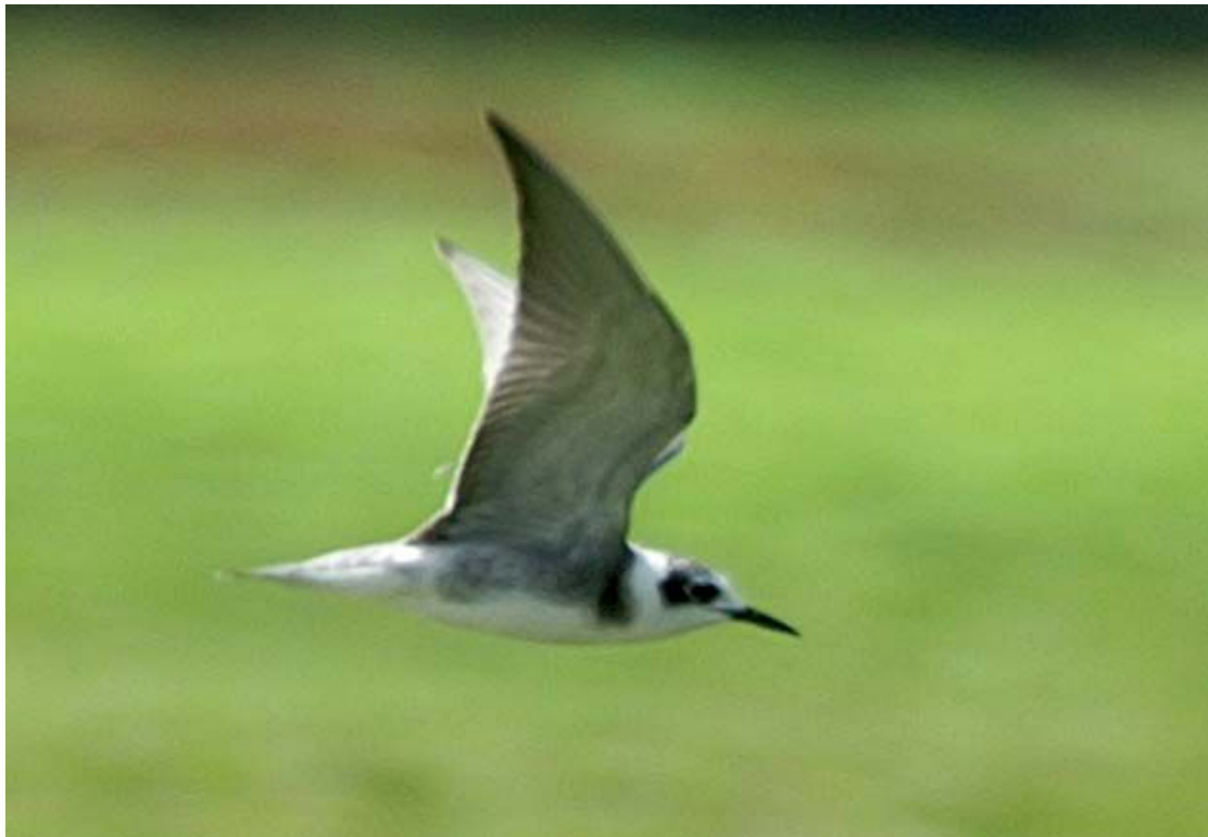
Juvenile American Black Tern ( Chlidonias niger surinamensis ) Rahasane Turlough, Co. Galway, 3 September 2007.

2006 Cork Adult, Sherkin Island, 19 July ( CBR 2005 & 2006: p.83) was presumably the same individual recorded off Cape Clear Island the next day ( Irish Birds 8: 387).