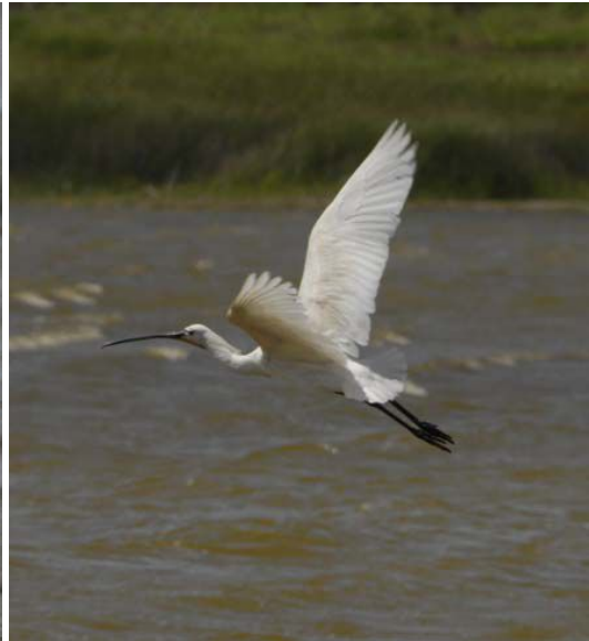
Adult Spoonbill ( Platalea leucorodia ) Tacumshin & Lady's Island, Co. Wexford, 1 July 2007.