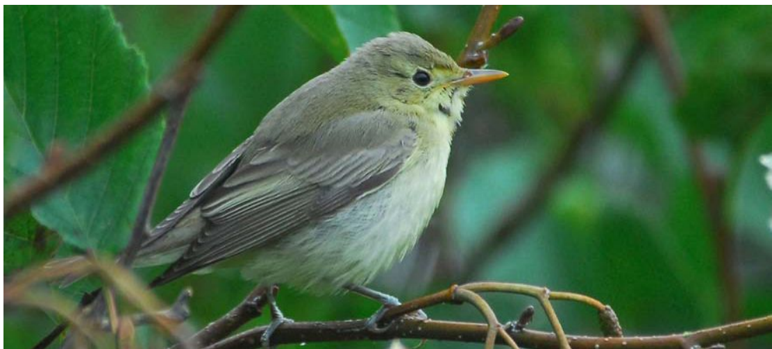
First-winter Icterine Warbler ( Hippolais icterina ) Cape Clear Island, Co.Cork, 9 to 20 October 2007.

A very poor year, which furthermore failed to produce any records of Melodious Warbler Hippolais polyglotta .