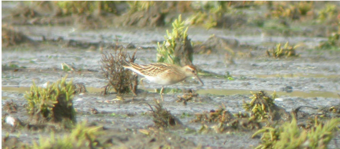
Juvenile Sharp-tailed Sandpiper ( Calidris acuminata) Ballycotton, Co. Cork, 5 October 2007.