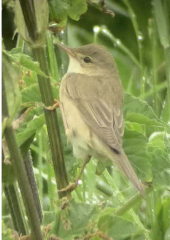
Marsh Warbler ( Acrocephalus palustris ) Carnsore Point, Co. Wexford, 3 June 2007.

Cork First-winter, Cape Clear Island, 9 to 20 October, photographed (P.Phillips et al. ) ( Wings 48: 27).