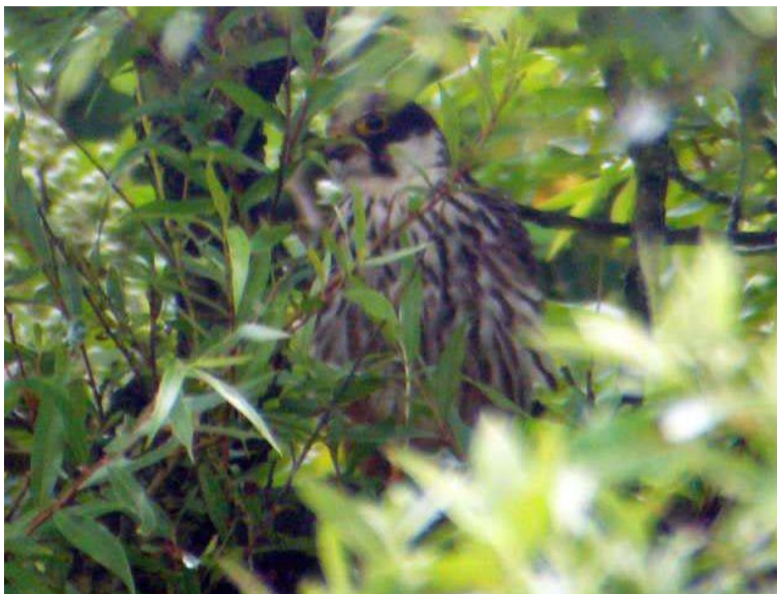
First summer Hobby ( Falco subbuteo ) Ballynagaul, Co. Waterford, 30 June 2007.

This extremely approachable, apparently exhausted bird arrived after a period of strong southwesterly winds that also brought the first Blue-winged Warbler Vermivora pinus for the Western Palearctic to the island the following week. This is the second Western Palearctic record of this Nearctic subspecies, following a record of one found dead in southwest Iceland on 23 October 1989 (Petersen 1992). More recently, single birds were reported from the Azores in October 2007 (Crochet 2008) and in October-November 2008 ( http://azores.seawatching.net ).