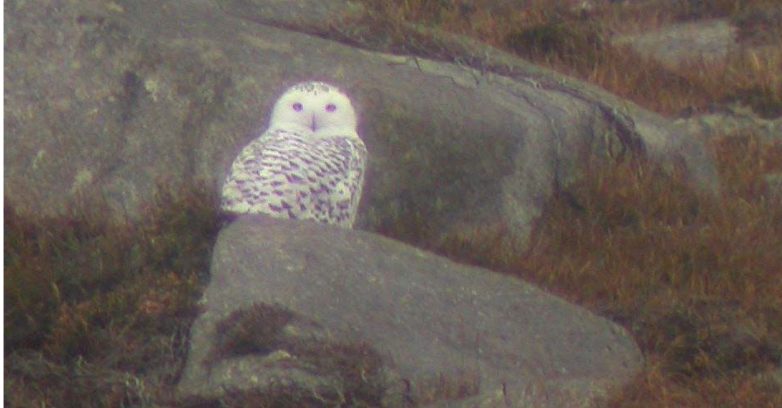
Adult female Snowy Owl ( Bubo scandiacus ) Blacksod, The Mullet, Co. Mayo, 6 October 2007.

2005 Cork Of the four birds seen at Courtmacsherry on 1 November ( Irish Birds 8: 387), three remained on 2 November, when they were seen at Galley Head ( CBR 2005 - 2006 p.92).