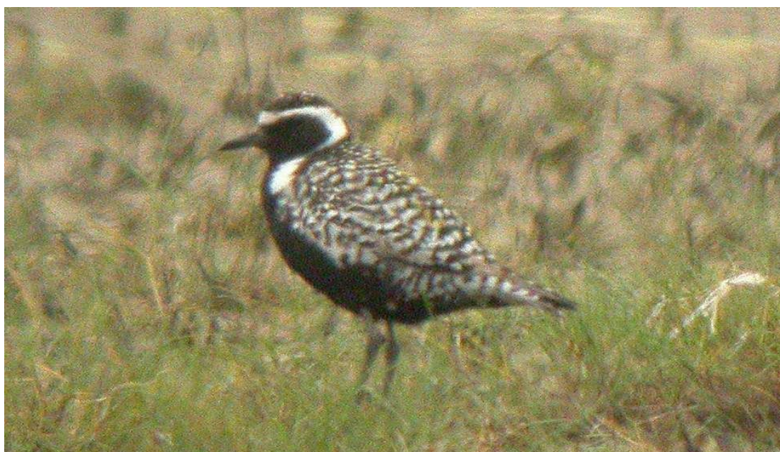
Adult Pacific Golden Plover ( Pluvialis fulva ) Tacumshin, Co. Wexford, 11 July 2007.

A very typical record; six of the total have been seen close to the south Wexford coast in July or August.