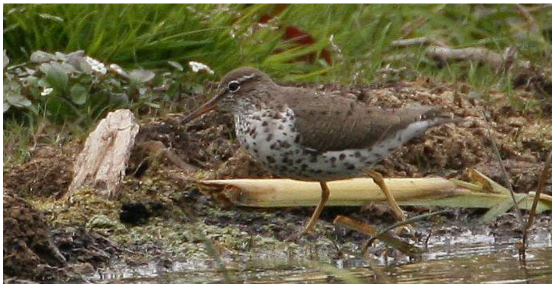
Adult summer Spotted Sandpiper ( Actitis macularius ) Blackditch Reserve, Newcastle, Co. Wicklow, 11 May 2007.