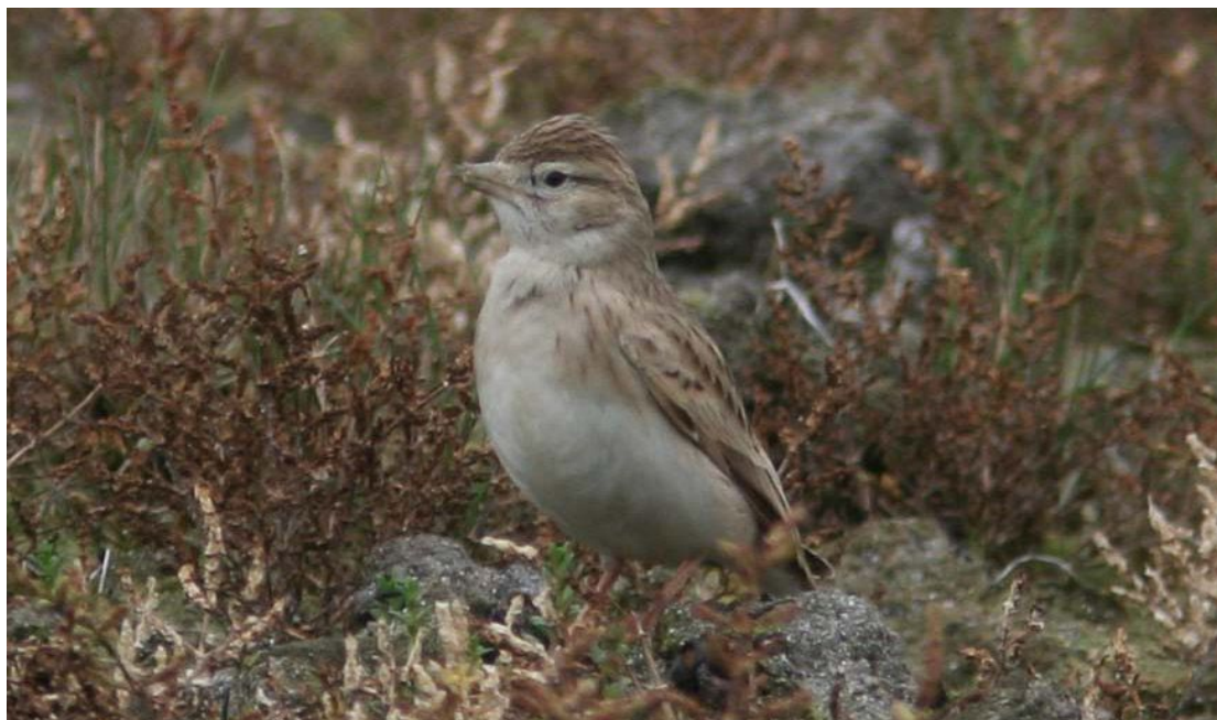
Short-toed Lark ( Calandrella brachydactyla) Lissagriffin, Co. Cork, 21 October 2007.

There is only one previous record away from the eastern seaboard (Kerry, 1976), so this was a most unexpected addition to the island list and, indeed, the county list.