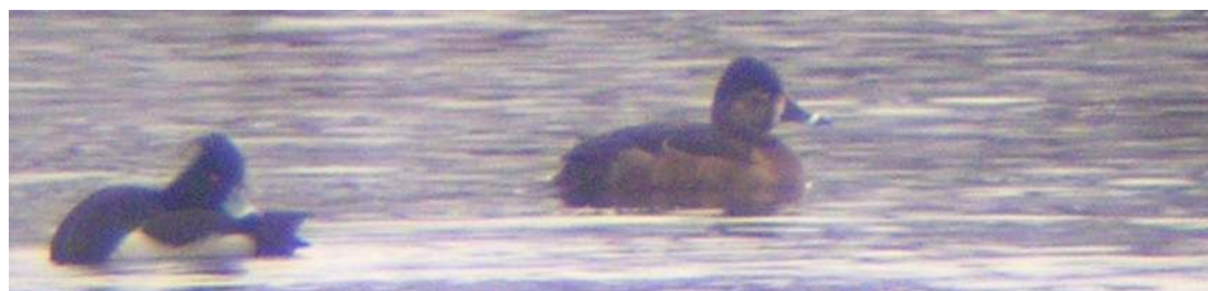
Female Ring-necked Duck ( Aythya collaris ) with Tufted Duck ( Aythya fuligula ) Lough Inchiquin, Corofin, Co. Clare, 29 January 2007.

2005 Londonderry Adult female, Lough Beg, 3 September ( NIBR 17: 50).