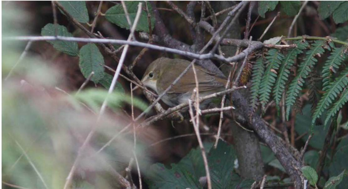
Blyth's Reed Warbler ( Acrocephalus dumetorum ) Three Castles, Mizen Head, Co. Cork, 11 October 2007.