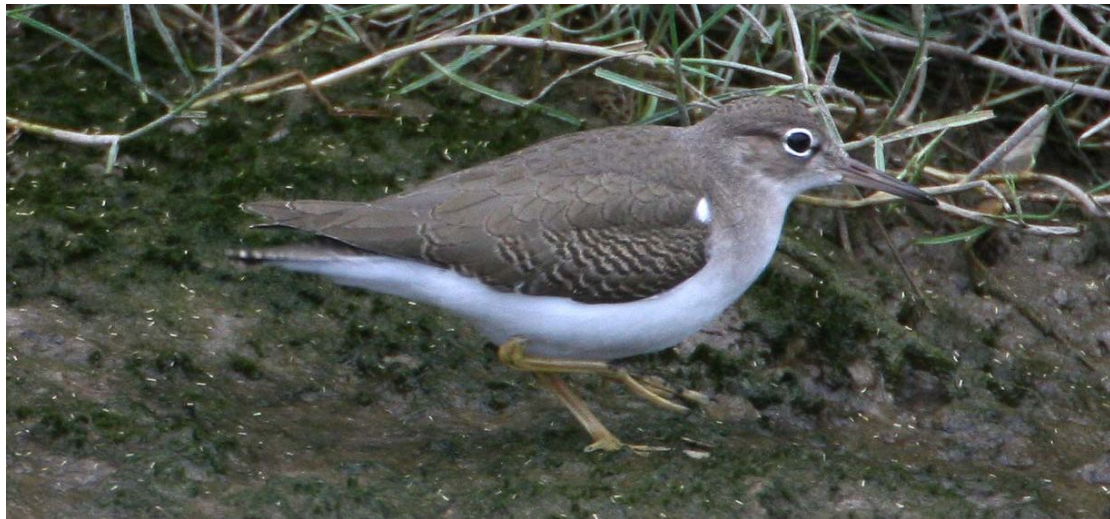
Juvenile Spotted Sandpiper ( Actitis macularius ) Ballycotton, Co. Cork, 3 September 2007.

The Shannon individual returned to moult at this locality for the third autumn in succession.