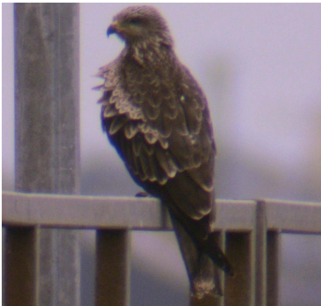
Juvenile Black Kite ( Milvus migrans ) South Slob, Co. Wexford, 12 September 2007.

Wexford One, near Tacumshin, 24 March (K.Fahy et al. ).