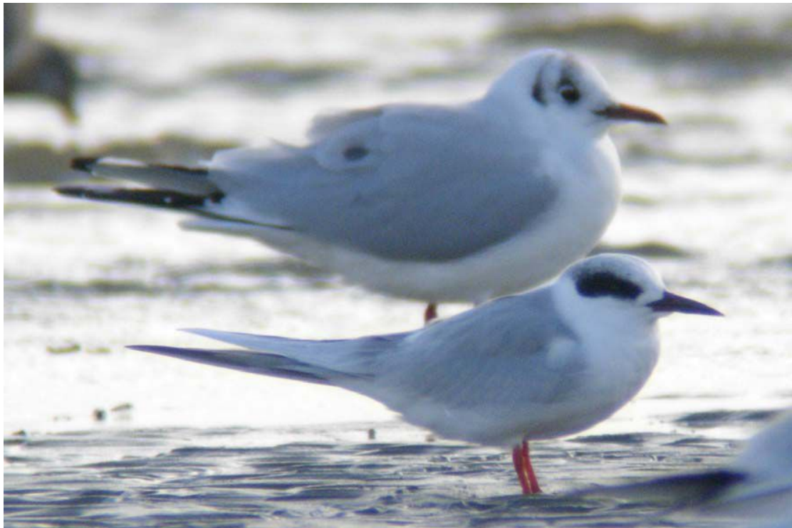
Adult winter Forster's Tern ( Sterna forsteri ) Galway Bay, Co. Galway, 3 March 2007.

Cork Adult, Pilmore Strand, 28 January to 9 February, photographed (S.Cronin et al. ), presumed returning individual.