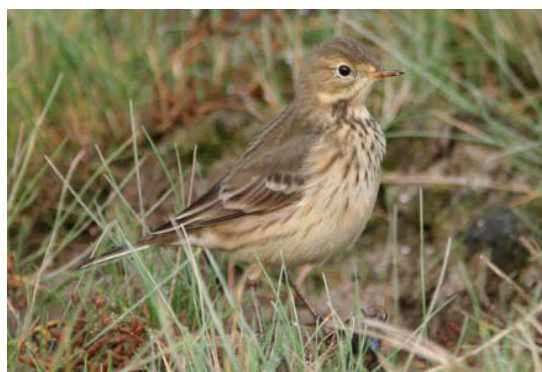
Buff-bellied Pipit ( Anthus rubescens ) – first bird - Lissagriffin, Co. Cork, 7 October 2007.

The multiple occurrences in 2007 were perhaps the most remarkable feature of the autumn, while the lengthy stay of one of the Cork birds went on to become the first recorded instance of an American passerine successfully over-wintering in Ireland. The above records were also in part a product of the modern internet grapevine: most, if not all, of the birds were found by observers deliberately searching for the species, having been forewarned by an unprecedented series of September occurrences, initially in Iceland, followed by progressively more southerly records in Scotland, England and France.