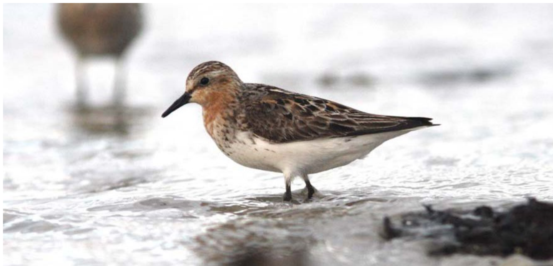
Adult Red-necked Stint ( Calidris ruficollis ) Carne, Co. Wexford, 30 August 2007.

This bird was discovered at dusk on the penultimate day of its stay by an entirely unsuspecting observer. It subsequently transpired that it had been photographed (but misidentified) by two visiting British birders three days previously. The first two birds, likewise adults in breeding plumage, were both at Ballycotton, Cork in July 1998 and July-August 2002.