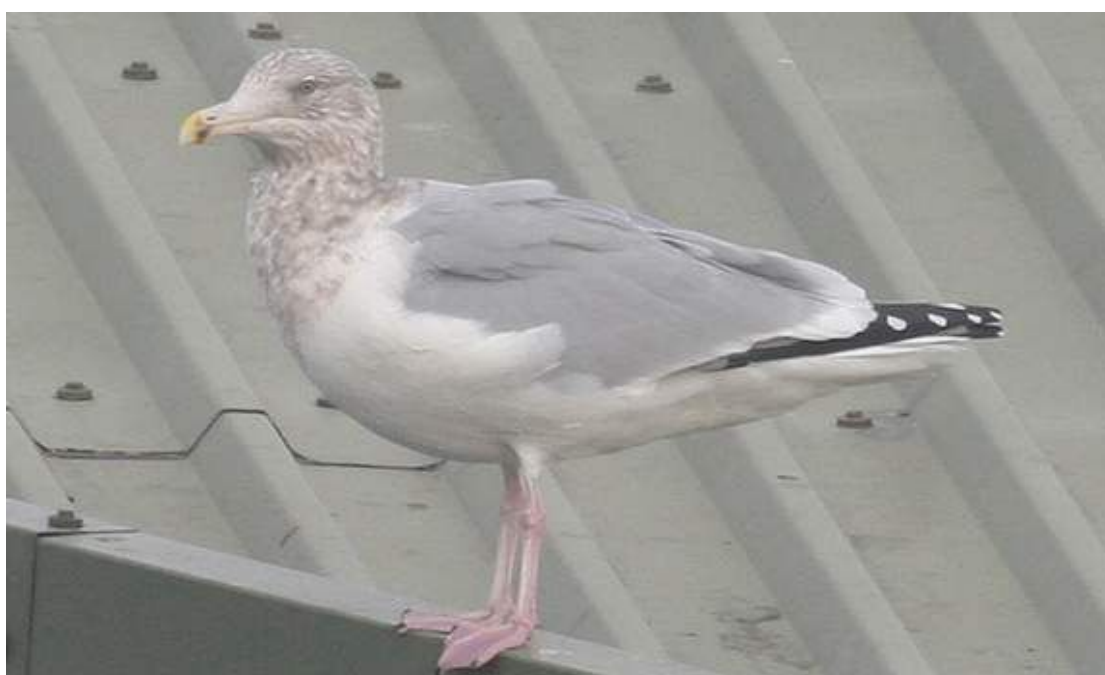
Fourth-winter American Herring Gull ( Larus smithsonianus ) Galway, 28 January 2007.