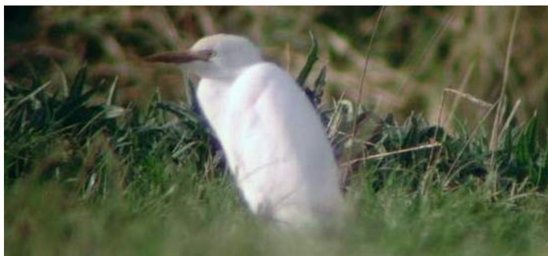
Cattle Egret ( Bubulcus ibis ) near Redbarn Strand, Co. Cork, 3 December 2007

Up to early November 2007, there had been just ten records of single birds in Cork (3), Kerry (2), Wexford (4) and Wicklow (1), fairly evenly spread over a 31-year period. For many birders, the above influx is likely to remain the most memorable event of winter 2007/2008. It began slowly, with one in Wicklow in November, followed by three sightings in the first half of December in Cork, Kerry and Clare. This series would in itself have rated as exceptional, yet the numbers that arrived in late December surpassed all expectations. By the end of the month at least 29 stationary individuals had been located, almost all in the southwest: 19 along the Cork coast (all but two in the western half of the county, including one flock of nine), three in Kerry, four in Galway but just three further east, in Waterford. Exceptionally large numbers also arrived in Britain about the same time, particularly in the southwest, eventually leading to the first breeding record there (Hudson et al. 2008).