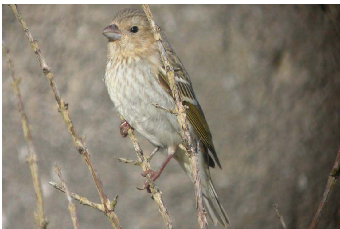
Juvenile Common Rosefinch ( Carpodacus erythrinus ) Tory Island, Co. Donegal, 4 October 2007.

The IRBC is currently assessing reports from Cork and Mayo, in addition to reports of Greenland / Iceland Redpoll Carduelis flammea rostrata / islandica from Donegal and Arctic Redpoll Carduelis hornemanni from Clare and Mayo, all in 2007.