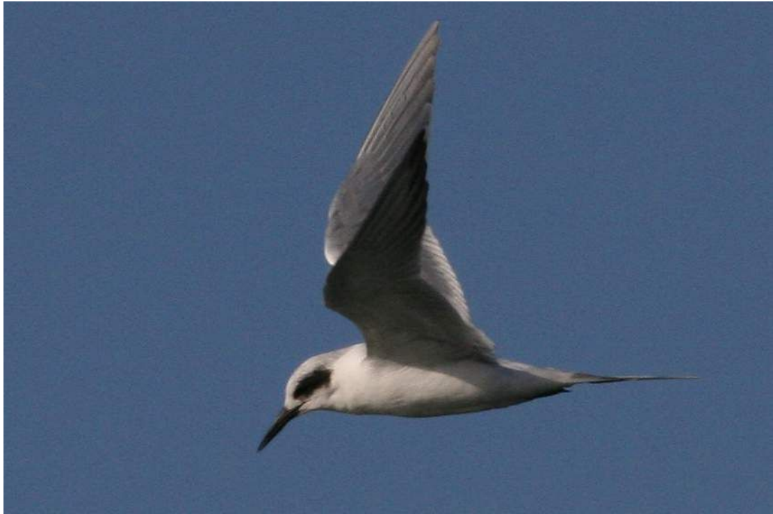
Adult winter Forster's Tern ( Sterna forsteri ) Pilmore Strand, Co. Cork, 28 January 2007.