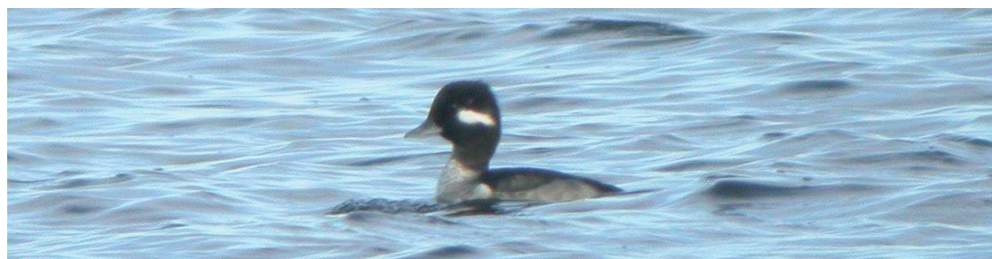
First-year male Bufflehead ( Bucephala albeola ) Lough Atedaun, Co. Clare, 9 February 2007.

With nine new individuals (including at least four first-years), the best year since 1984. These widely spread birds include two at rather atypically sheltered locations in Cork and Donegal.