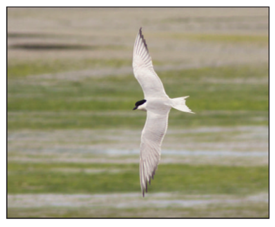
Plate 44. Gull-billed Tern Gelochelidon nilotica , Muckross Estuary, Cork, April 2017.