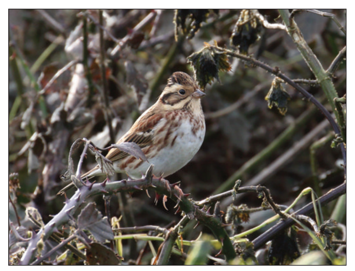
Plate 61. Rustic Bunting Emberiza rustica, Cape Clear Island, Cork, October 2017 (Tom Shevlin).