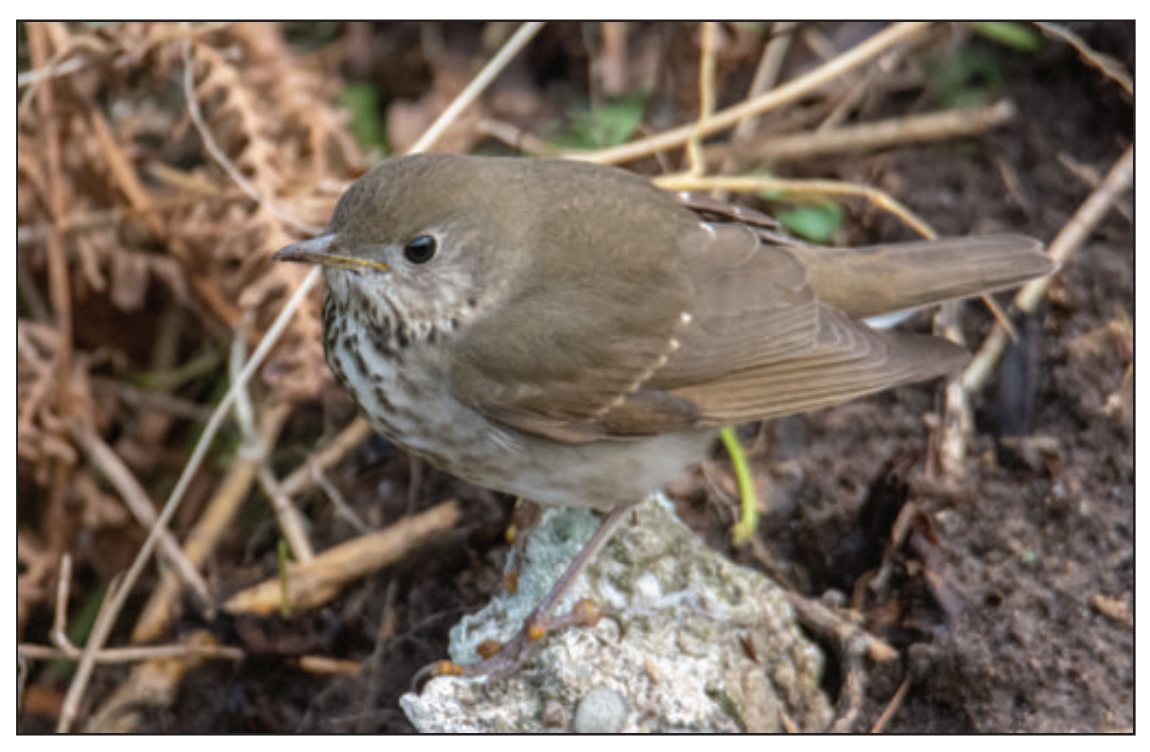
Plate 53. Grey-cheeked Thrush Catharus minimus , Galley Head, Cork, October 2017 (Calvin Jones/Ireland's Wildlife).

Clare One: Adult, Kilkee, 22nd August, photographed (E.O'Flynn). The ninth record for the county, with the last one at Spanish Point on 13th June 2012 ( Irish Birds 9: 603).