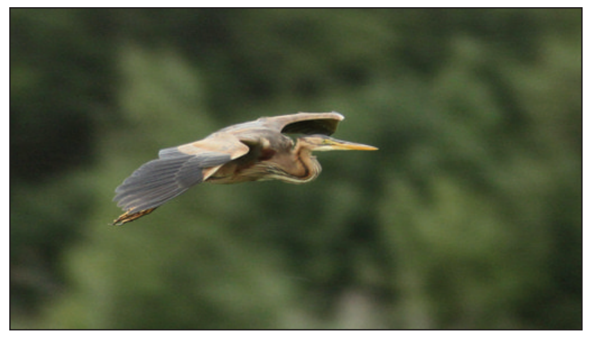
Plate 29. Purple Heron Ardea purpurea, East Coast Nature Reserve, Newcastle, Wicklow, July 2017.