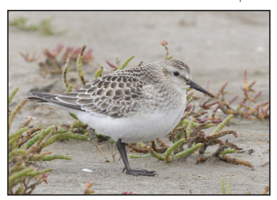
Plate 39. Baird's Sandpiper Calidris bairdii , Tacumshin Lake, Wexford, September 2017 (Dermot Breen).

Kerry Three: Adult, Carrahane Strand, 13th to 29th September,