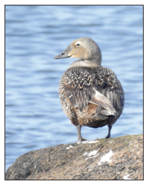
Plate 23. King Eider Somateria spectabilis , Nethertown, Wexford, June 2017.

Wexford One: female, Nethertown, 22nd June (J.Geraty, L.Geraty et al. ), photographed.