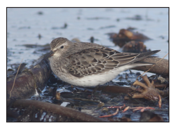
Plate 38. White-rumped Sandpiper Calidris fuscicollis , Tacumshin Lake, Wexford, November 2017 (Paul Kelly).