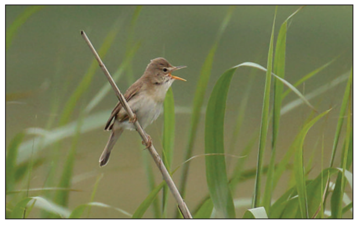
Plate 51. Marsh Warbler Acrocephalus palustris, Cahore, Wexford, July 2017 (Tom Shevlin).