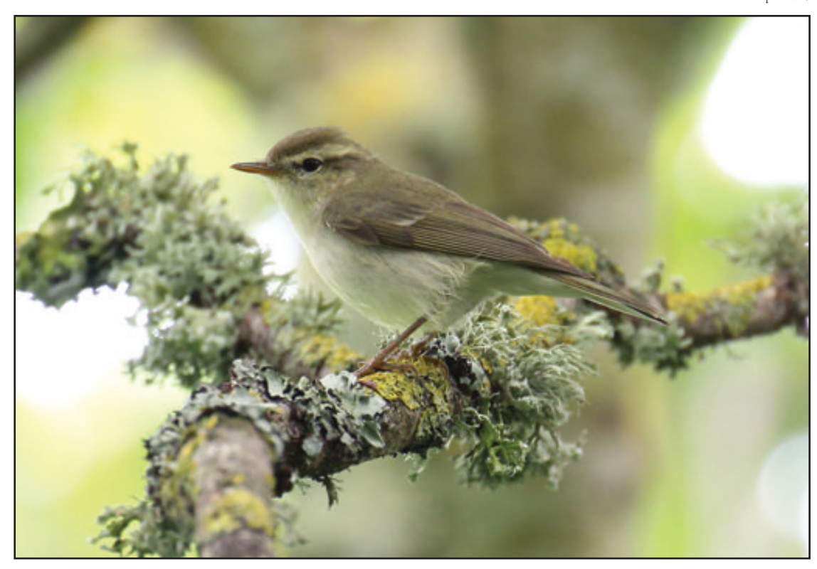
Plate 50. Greenish Warbler Phylloscopus trochiloides, Great Saltee Island, Wexford, May 2017 (Tom Shevlin).