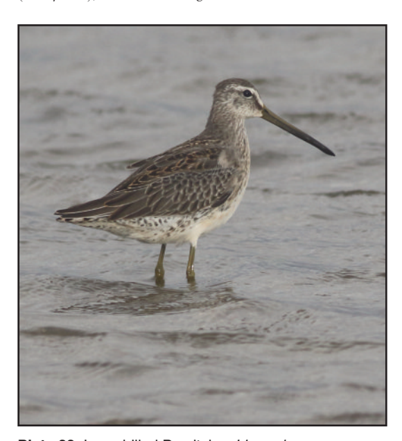
Plate 33. Long-billed Dowitcher Limnodromus scolopaceus , Tacumshin Lake, Wexford, October 2017.

Wexford Three: Juvenile moulting into first summer plumage, Tacumshin Lake, from 21st October 2016 ( Irish Birds 10: 555), until 22nd April (B.Haslam); Adult, Bannow Bay, 27th August to 2nd October (D.Bakewell et al. ); Juvenile, Tacumshin Lake, 1st October, joined by a second juvenile, 6th October to 19th November, photographed (P.Kelly et al. ), with one remaining into 2018.