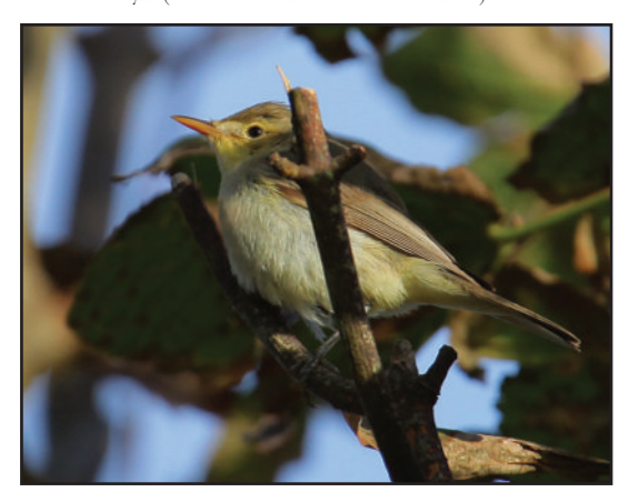
Plate 52. Melodious Warbler Hippolais polyglotta , Galley Head, Cork, September 2017.