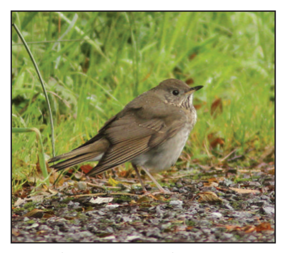
Plate 54. Grey-cheeked Thrush Catharus minimus , Rosscarbery Pier, Cork, October 2017 (Dick Coombes).