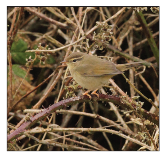
Plate 49. Radde's Warbler Phylloscopus schwarzi , Kilbaha, Clare, October 2017 (Tom Tarpey).

2016 ( Irish birds 10: 568), remained to 13th April, photographed (N.T.Keogh); One, Tolka Valley Park, from 31st December 2016 ( Irish birds 10: 568), remained to 26th January, photographed (D.O'Mahony); One, Ranelagh Gardens, 11th February (M.Carmody).