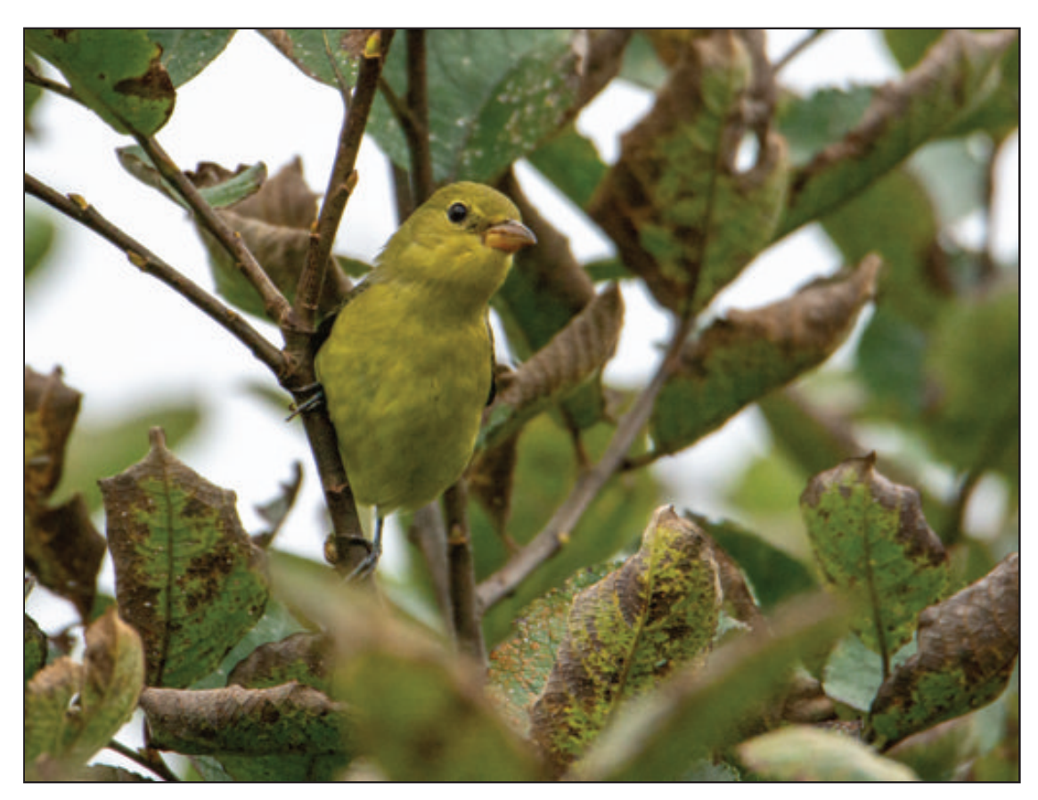
Plate 59. Scarlet Tanager Piranga olivacea, Mizen Head, Cork, October 2017.

The third record for Ireland, and the first for Donegal. The two previous records were from Cork, with the first at