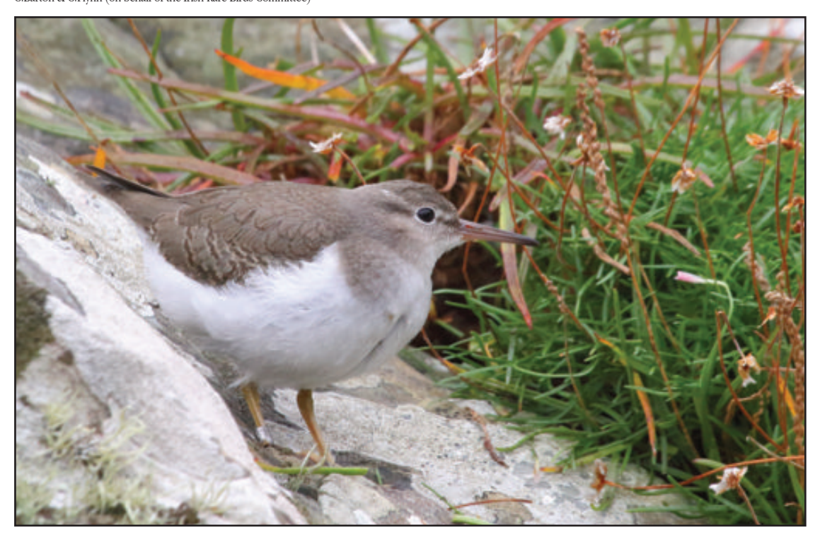
Plate 36. Spotted Sandpiper Actitis macularius, Cape Clear Island, Cork, October 2017 (Ciaran Cronin).