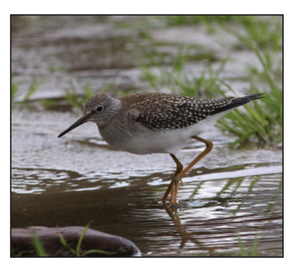
Plate 35. Lesser Yellowlegs Tringa flavipes, Cappagh Beach, Kerry, September 2017.

Another good year for this regular American wader. The majority of records come from Cork, Kerry and Wexford, but there have now been seven Clare records, six Galway records, and eight Mayo records.