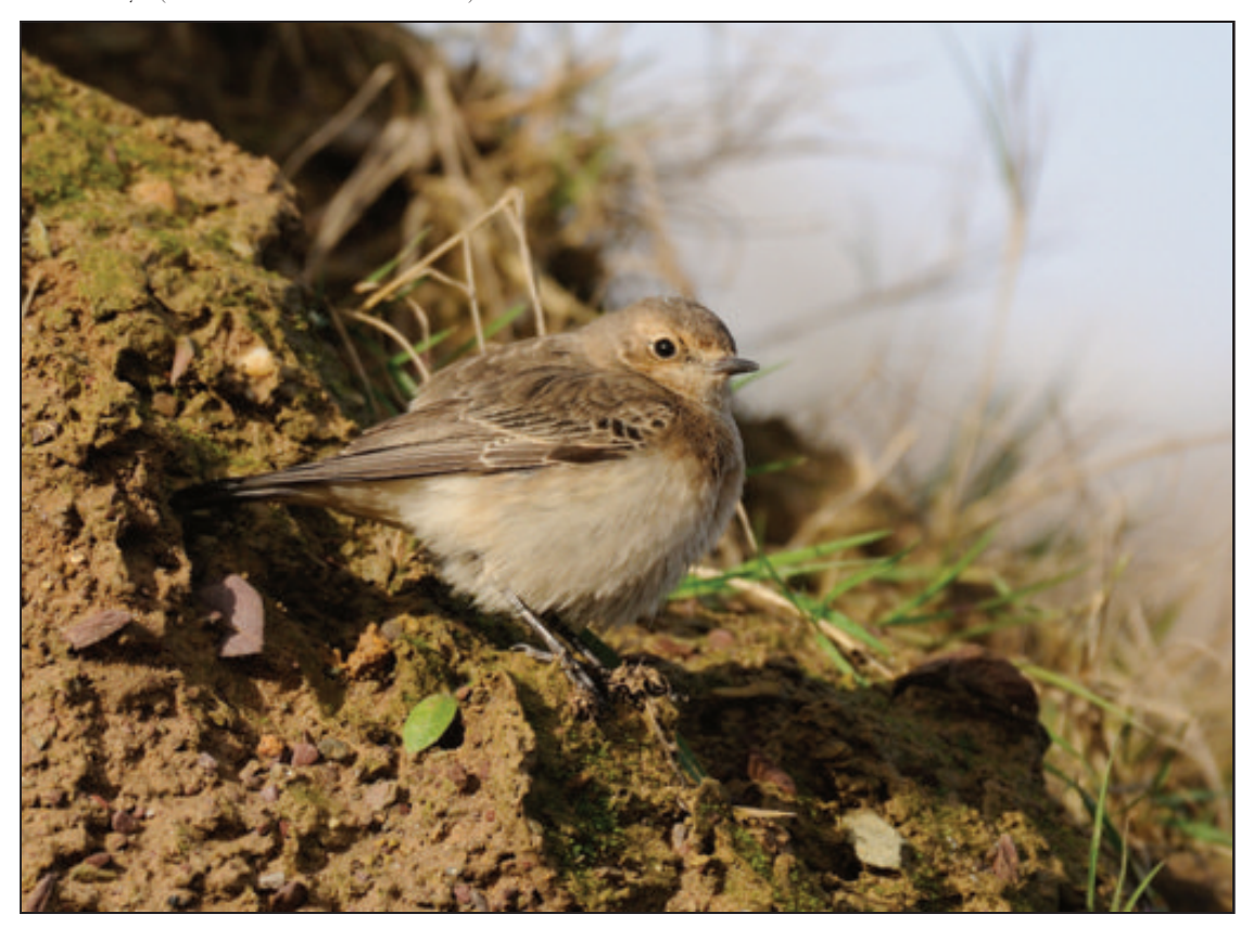
Plate 57. Pied Wheatear Oenanthe pleschanka , Ring Strand, Ballymacoda, Cork, December 2017 (Andrew Malcolm).