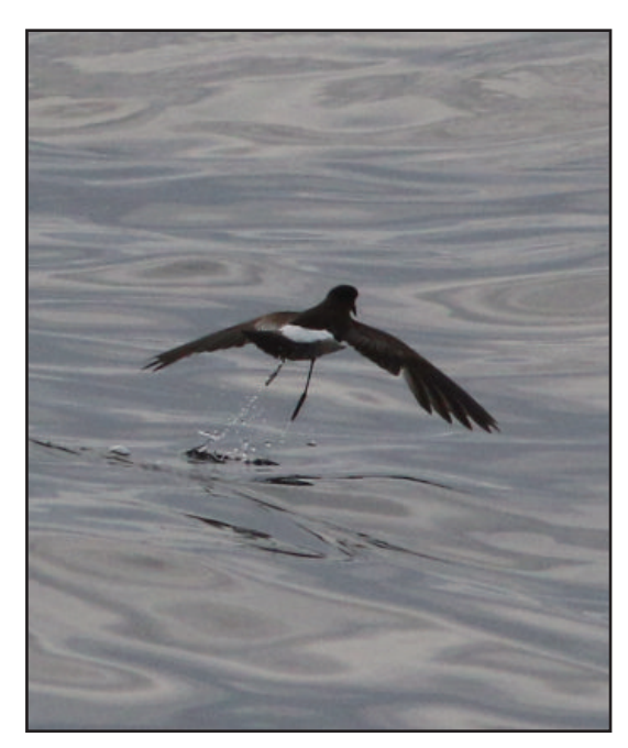
Plate 24. Wilson's Storm Petrel Oceanites oceanicus , off Great Blasket Island, Kerry, August 2017 (Michael O'Clery).

Cork 149: Nine, 15 nautical miles south of Toe Head, Cork, 21st June, photographed (P.Connaughton et al.); 40, south of Cape Clear Island, 25th July, photographed (P.Connaughton et al.); One, off Galley Head, 30th July (C.Cronin et al.); One, off Cape Clear Island, 31st July (S.Bayley); 56, south of Cape Clear Island, 6th August, photographed (P.Connaughton et al.); One, off Power Head, 6th August (D.O'Sullivan et al.); One, outside North Harbour, Cape Clear Island, 6th August