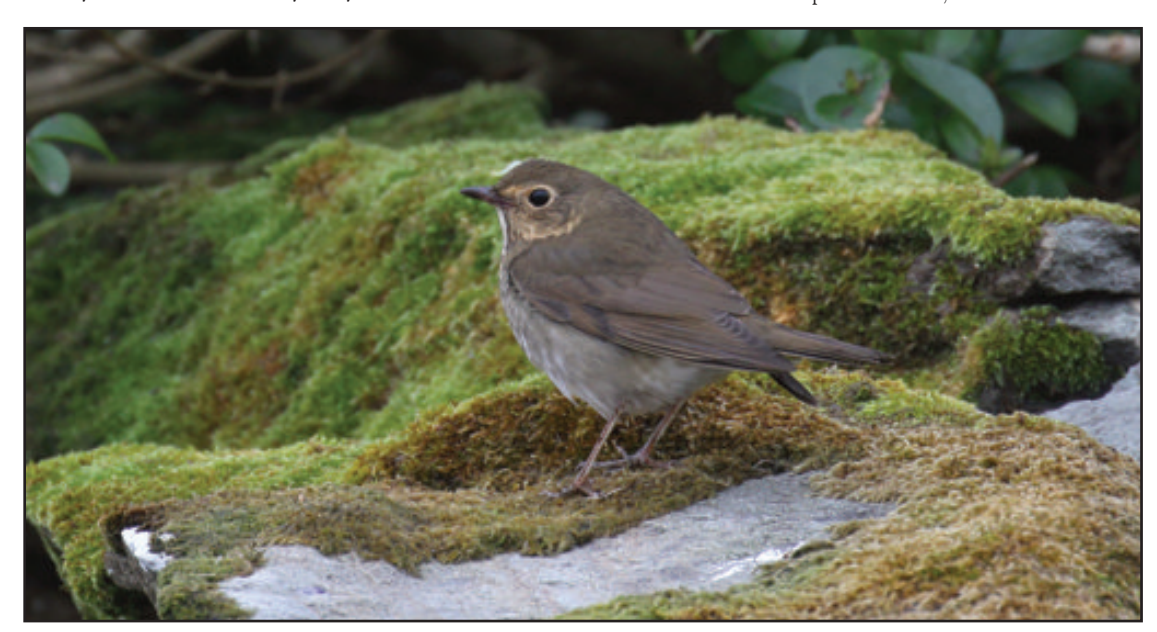
Plate 56. Swainson's Thrush Catharus ustulatus, Cape Clear Island, Cork, October 2017 (Tom Shevlin).

The third record for Cape Clear Island, and the fifth for Cork.