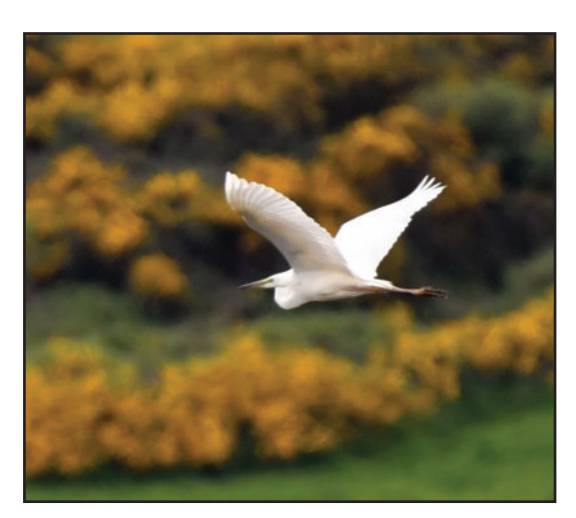
Plate 30. Great White Egret Ardea alba, The Gearagh, Cork, April 2017.