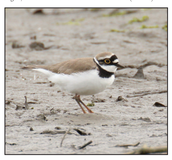
Plate 31. Little Ringed Plover Charadrius dubius , Broadmeadows, Swords, Dublin, April 2017 (Tom Shevlin).

Carlow Zero: The juvenile at Carlow Sugar Factory Lagoons, Laois, 7th August, was also seen on the Carlow side of the river (B.Power).