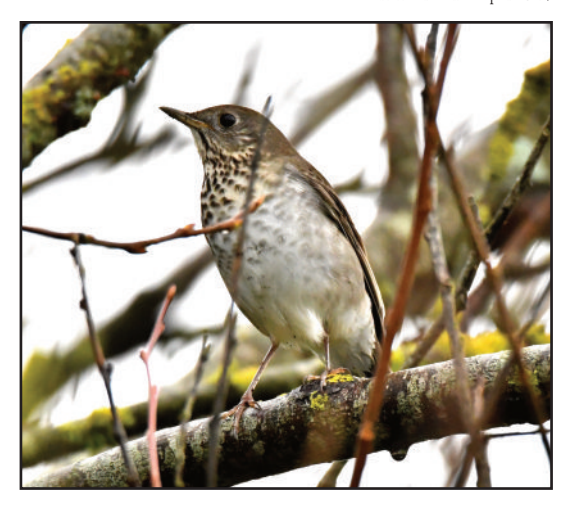
Plate 55. Grey-cheeked Thrush Catharus minimus , Red Strand, Cork, October 2017.