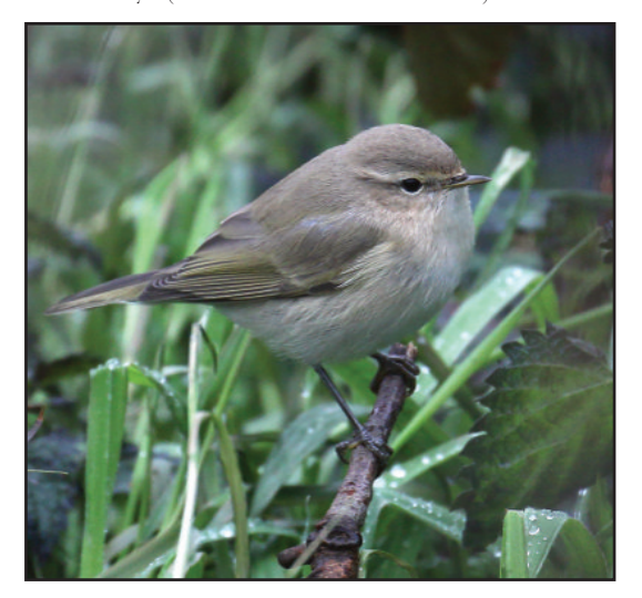
Plate 48. Siberian Chiffchaff Phylloscopus collybita tristis, Cape Clear Island, Cork, October 2017.