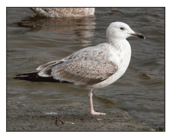
Plate 43. Caspian Gull Larus cachinnans , Limerick City, January 2017 (Tom Tarpey).