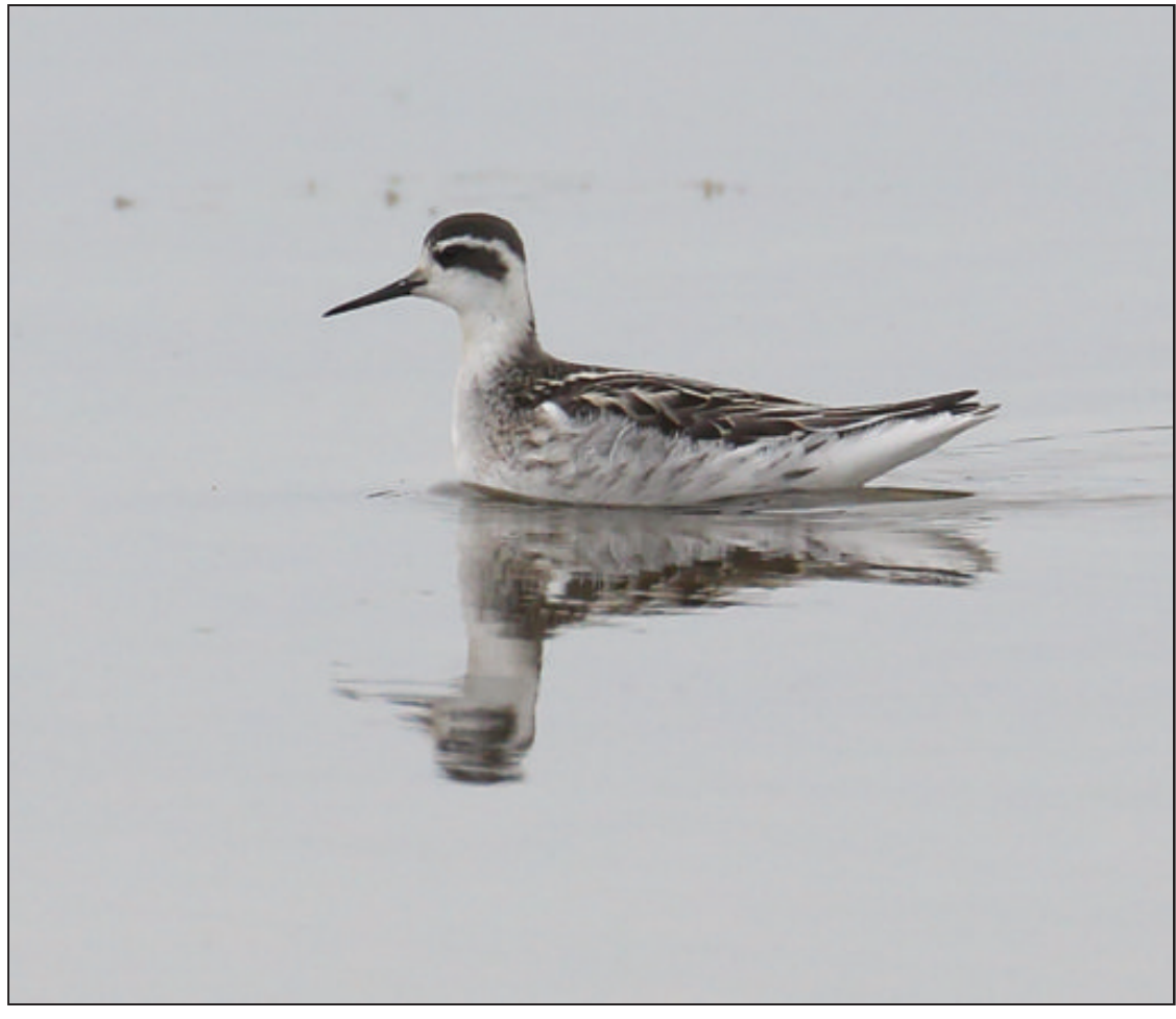
Plate 40. Red-necked Phalarope Phalaropus lobatus, Tacumshin Lake, Wexford, September 2017.