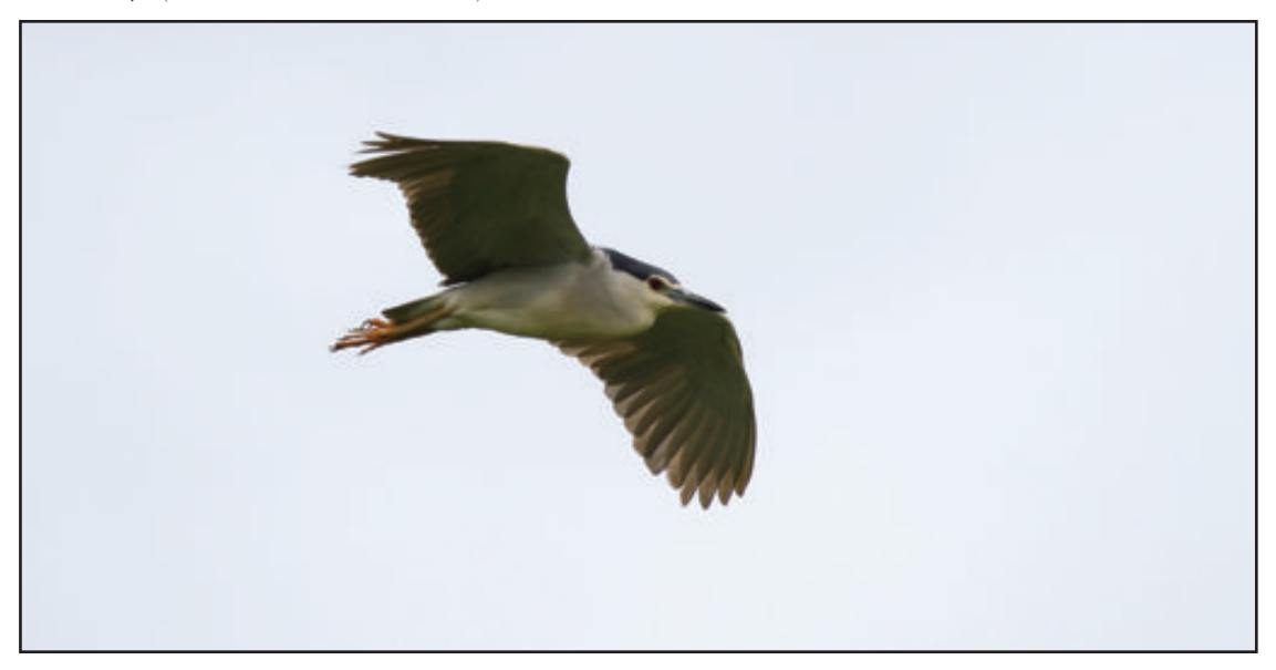
Plate 26. Black-crowned Night Heron Nycticorax nycticorax, Adare, Limerick, April 2017 (Tom Tarpey).