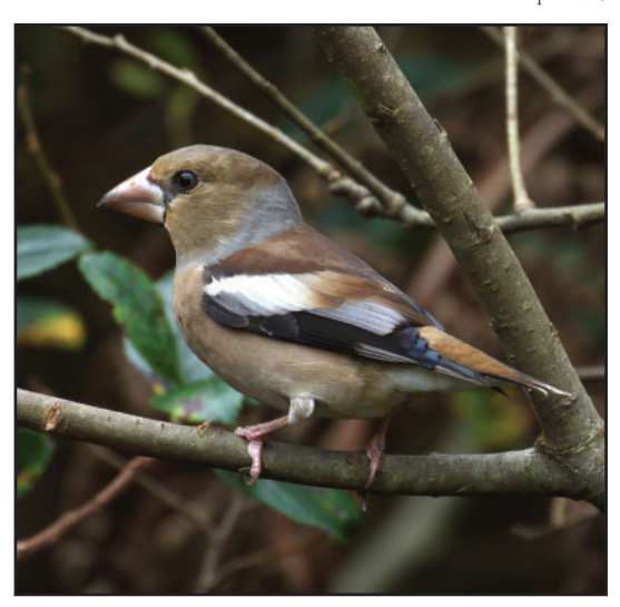
Plate 58. Hawfinch Coccothraustes coccothraustes , Cape Clear Island, Cork, October 2017.

Limerick 16: Two, Curraghchase Forest Park, 5th November (T.Tarpey), with 11 there, 20th November (T.Tarpey, G.Hunt), 12 on 22nd November (P.Cullinan), 15 on 22nd November (P.Cullinan, J.Fox