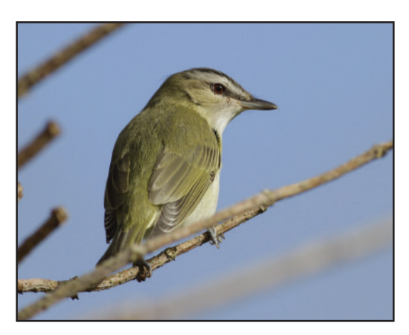
Plate 46. Red-eyed Vireo Vireo olivaceus, Inishmore, Galway, October 2017.