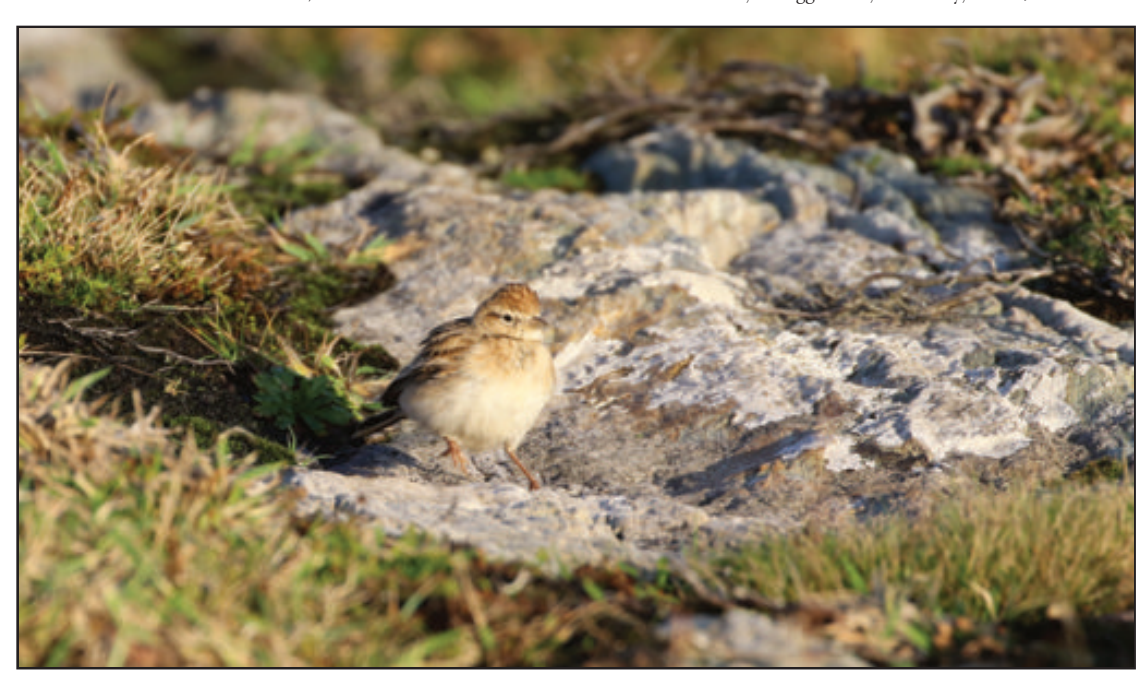
Plate 47. Short-toed Lark Calandrella brachydactyla, Cape Clear Island, Cork, October 2017.

Dublin One: One, Kilbogget Park, Cabinteely, from 29th December