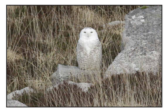
Plate 45. Snowy Owl Bubo scandiacus, Cloghernagun, Galway, January 2017 (Dermot Breen).

Wicklow One: One, Five Mile Point, 20th to 22nd April, photographed (C.Cardiff et al. ), also seen at Newcastle Airfield, East Coast Nature Reserve and Castlegrange.