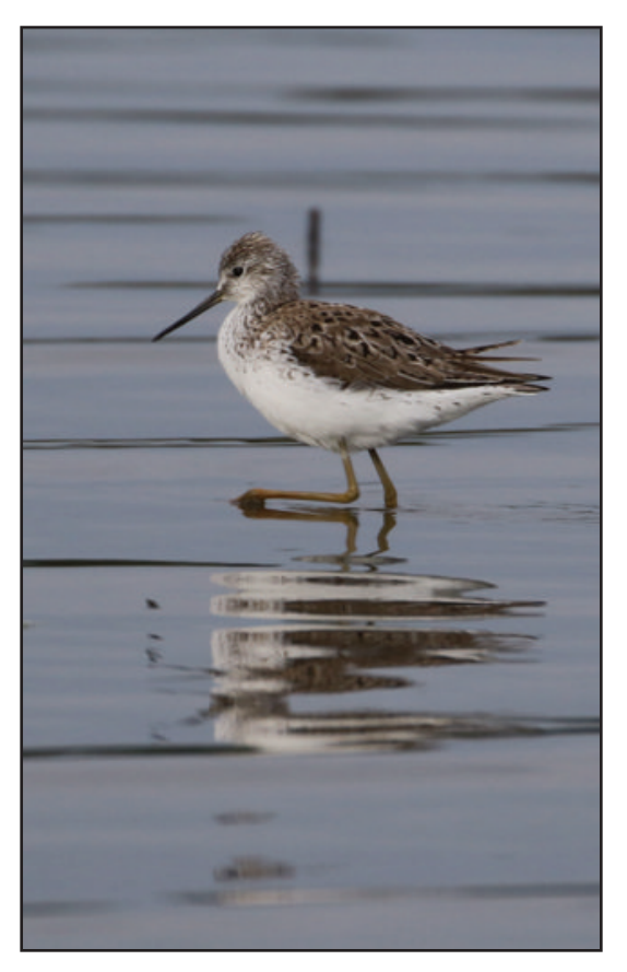
Plate 34. Marsh Sandpiper Tringa stagnatilis , Broadmeadows, Swords, Dublin, May 2017.

The first county record, the first in spring, and only the fifth Irish record. The last record was at Great Island, Cork on 20th August 1999 ( Irish Birds 7: 397), while the three previous records all occurred in Wexford, in August.