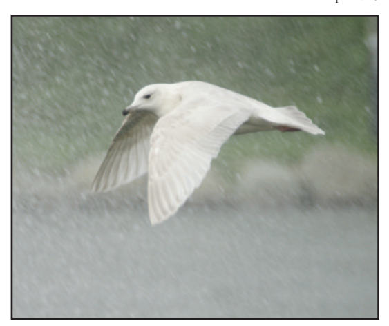
Plate 42. Kumlien's Gull Larus glaucoides kumlieni , Tralee, Kerry, February 2017 (Luke Geraty).

2016 Wexford One: Adult winter, Carnsore Point, 26th August could not be identified to species (P.Cosgrove, L.Waters).