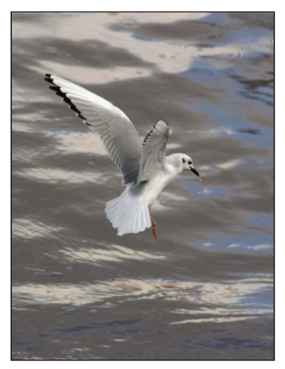
Plate 41. Bonaparte's Gull Chroicocephalus Philadelphia, Cork City, February 2017.