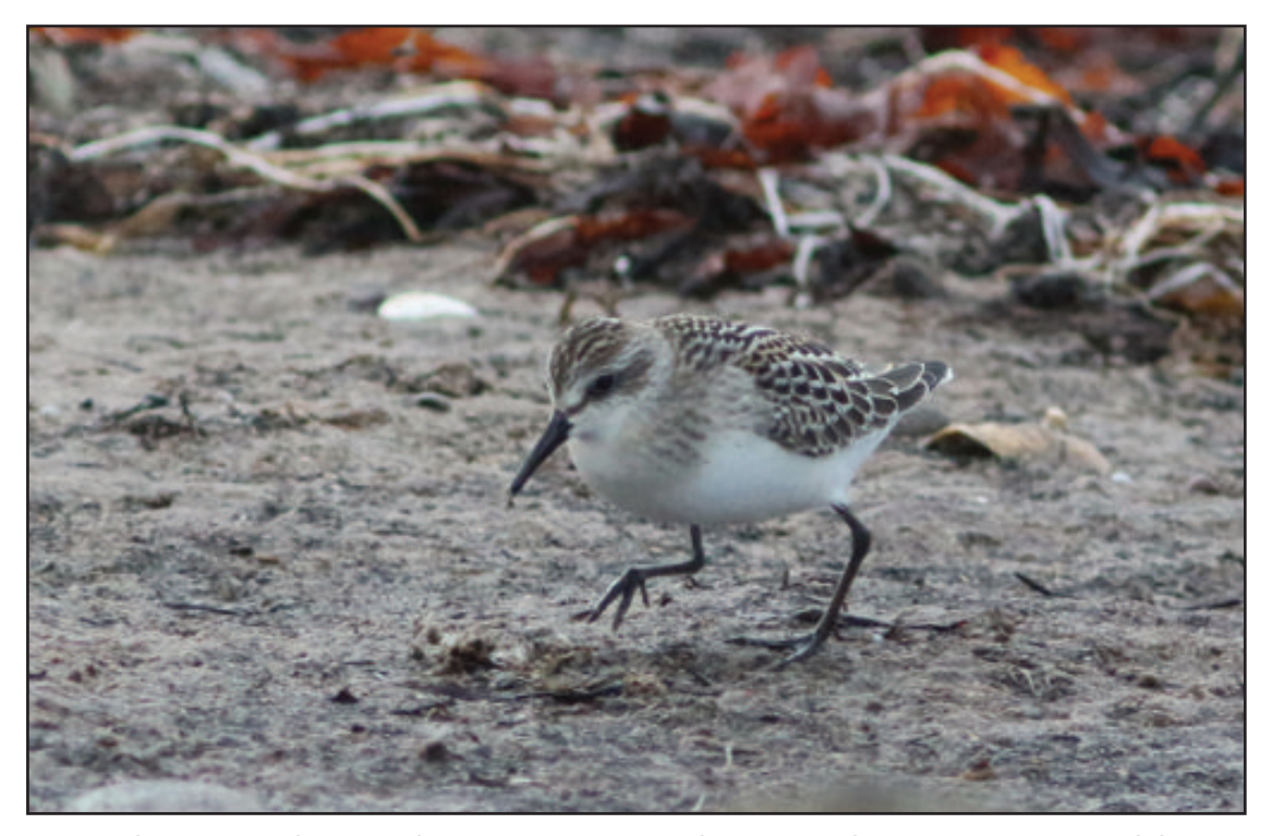
Plate 37. Semipalmated Sandpiper Calidris pusilla, Derrymore Strand, Kerry, September 2017 (Michael O'Clery).