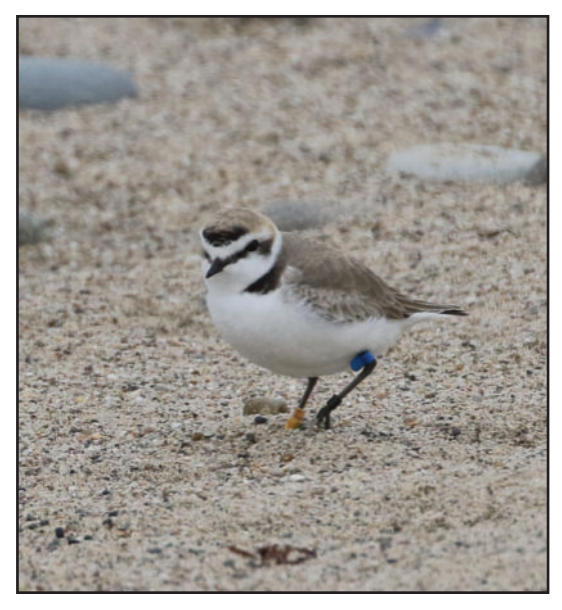
Plate 32. Kentish Plover Charadrius alexandrinus , Tacumshin Lake, Wexford, April 2017 (Killian Mullarney).

The first record since one at the same site between 25th April and 2nd May 2011 ( Irish Birds 9: 462).