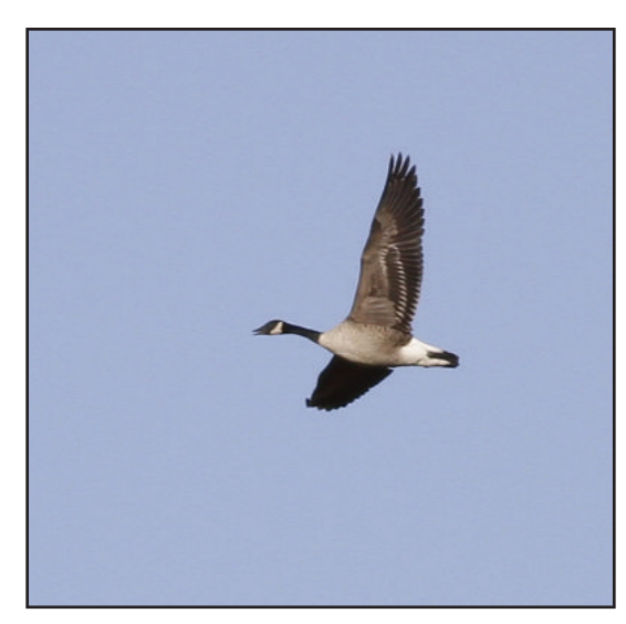
Plate 22. Canada Goose Branta canadensis , Belclare Turlough, Galway, February 2017.

Cackling Goose Branta hutchinsii (0; 28; 3) Donegal One: One, Culdaff, 3rd November, identified from photographs (C.Cardiff, C.Cassidy et al.).