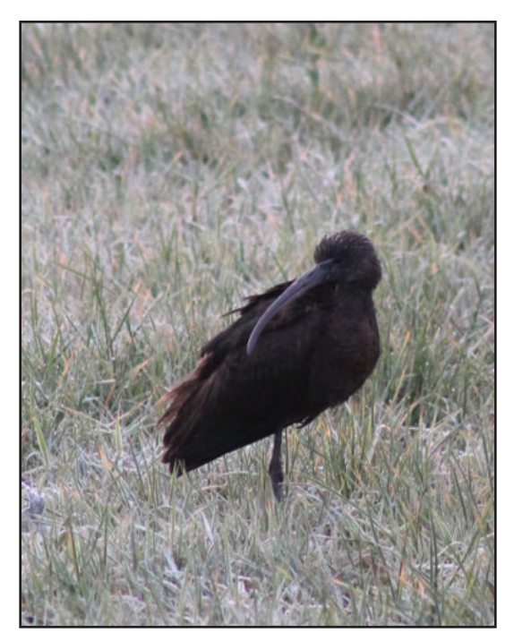
Plate 25. Glossy Ibis Plegadis falcinellus , Dungarvan, Waterford, December 2017 (Ian Stevenson).